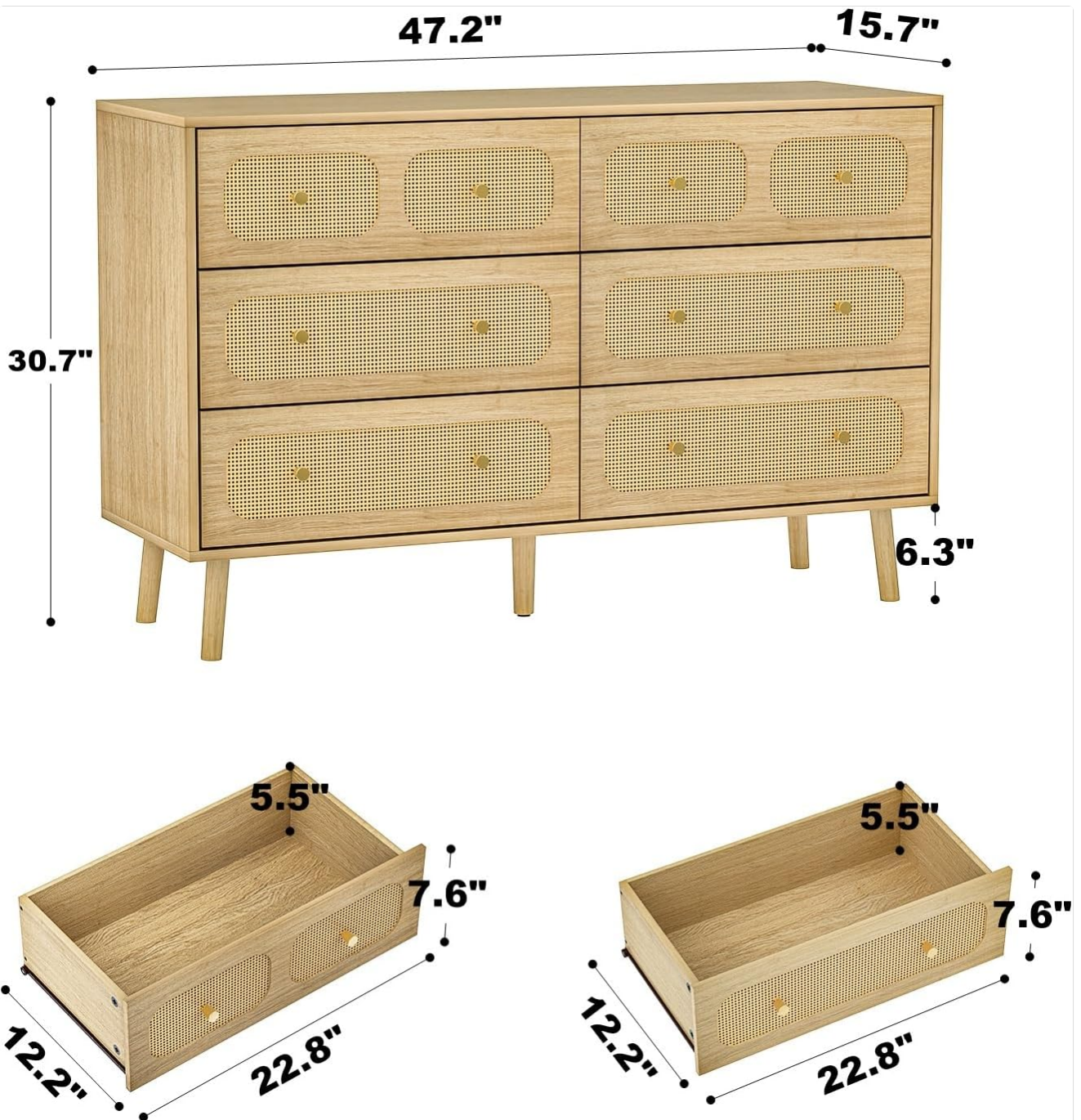
Image: Overall dimensions of the dresser (47.2"W x 15.7"D x 30.7"H) and individual drawer dimensions (22.8"W x 12.2"D x 7.6"H).