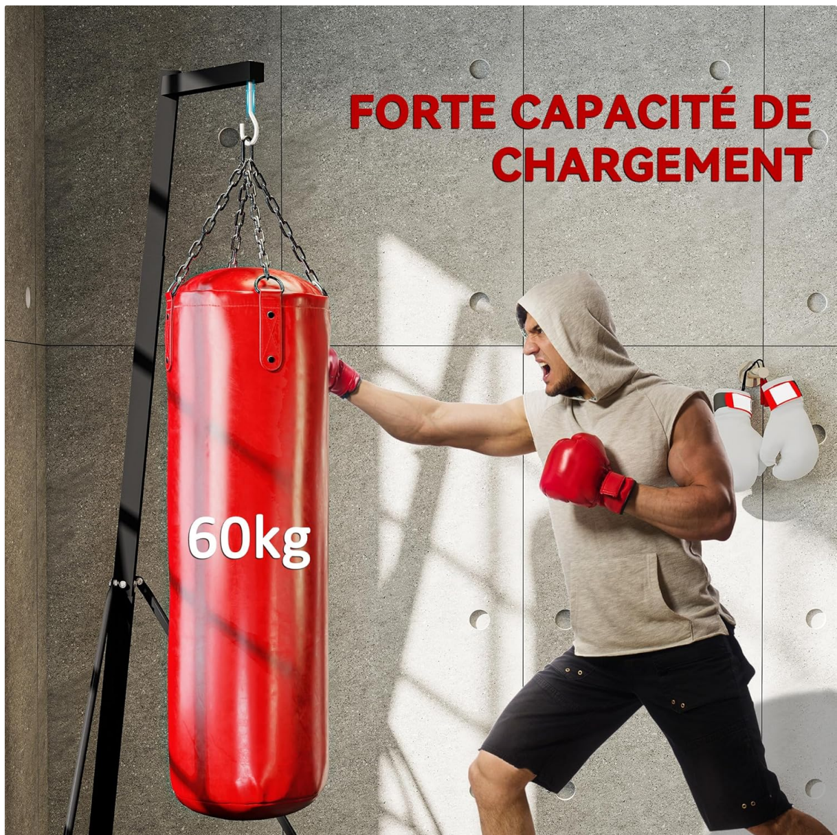
Image: A person is shown striking a red punching bag, demonstrating the stand's strong load capacity, capable of holding bags up to 60 kg.