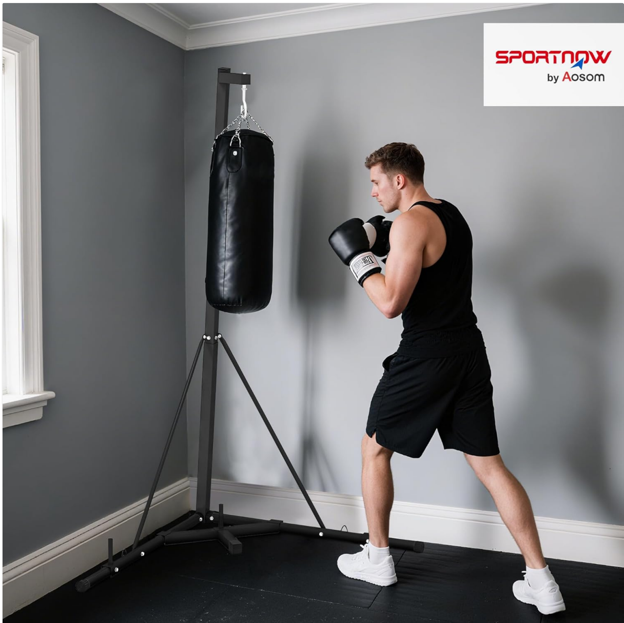
Image: A user is shown actively training with a punching bag attached to the SPORTNOW stand, illustrating the product in its intended use.