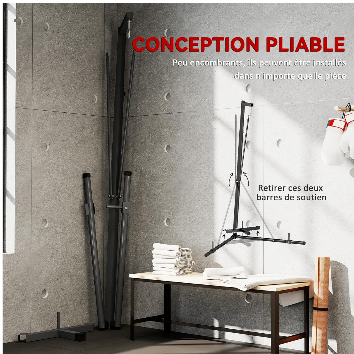
Image: The stand can be folded for compact storage. To fold, remove the two support bars as indicated by the arrows. This allows for easy storage in any room or garage.