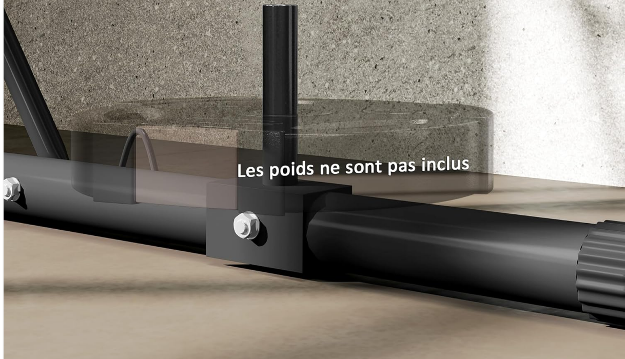
Image: The stable triangular base features three posts for placing weight plates (not included). These weights help maintain the stand's balance and security during use, preventing wobbling or swaying.

Trois poteaux pour les plaques de poids afin de maintenir l'équilibre et la sécurité du stand