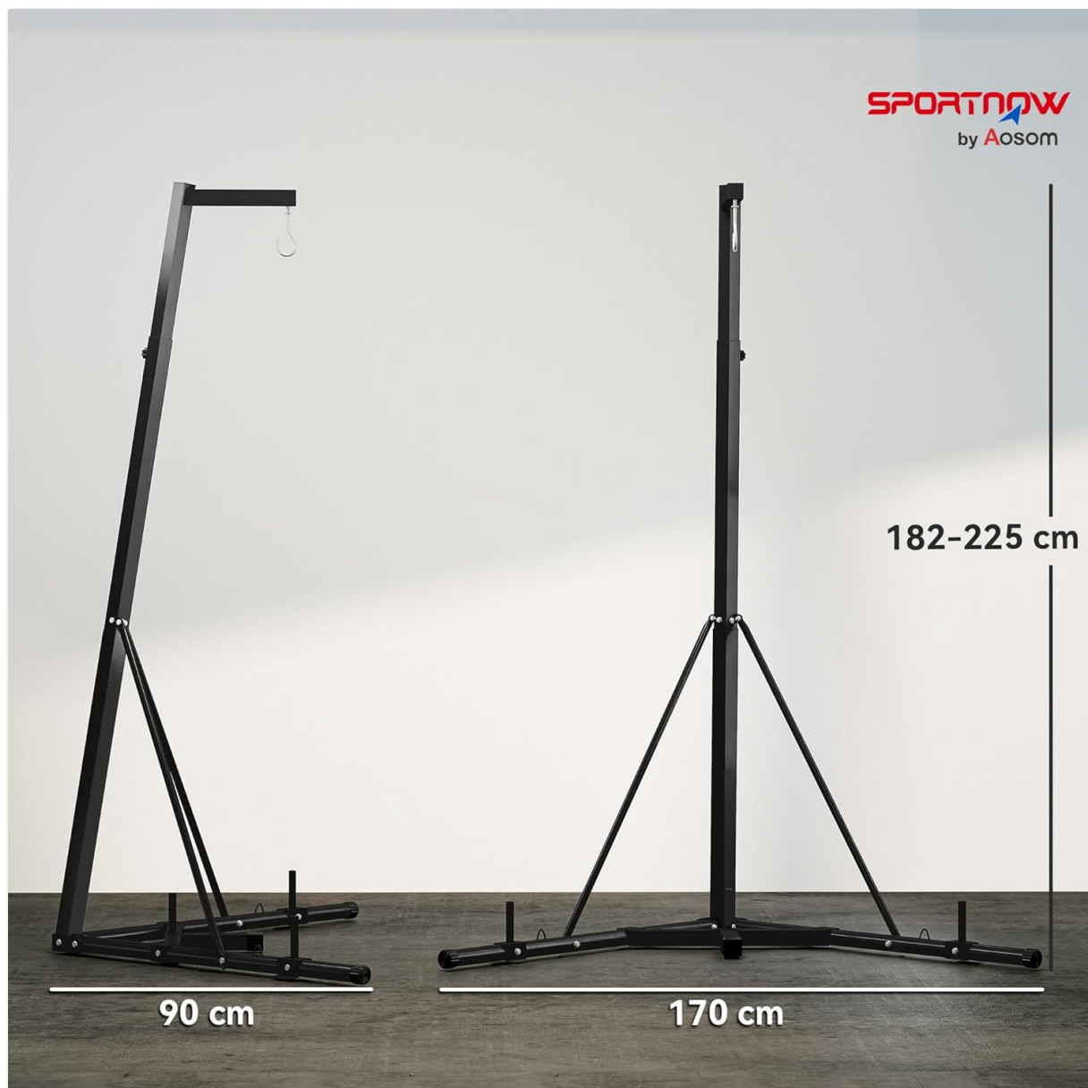
Image: Detailed dimensions of the stand are provided, showing the overall length of 170 cm, width of 90 cm, and an adjustable height range from 182 cm to 225 cm.