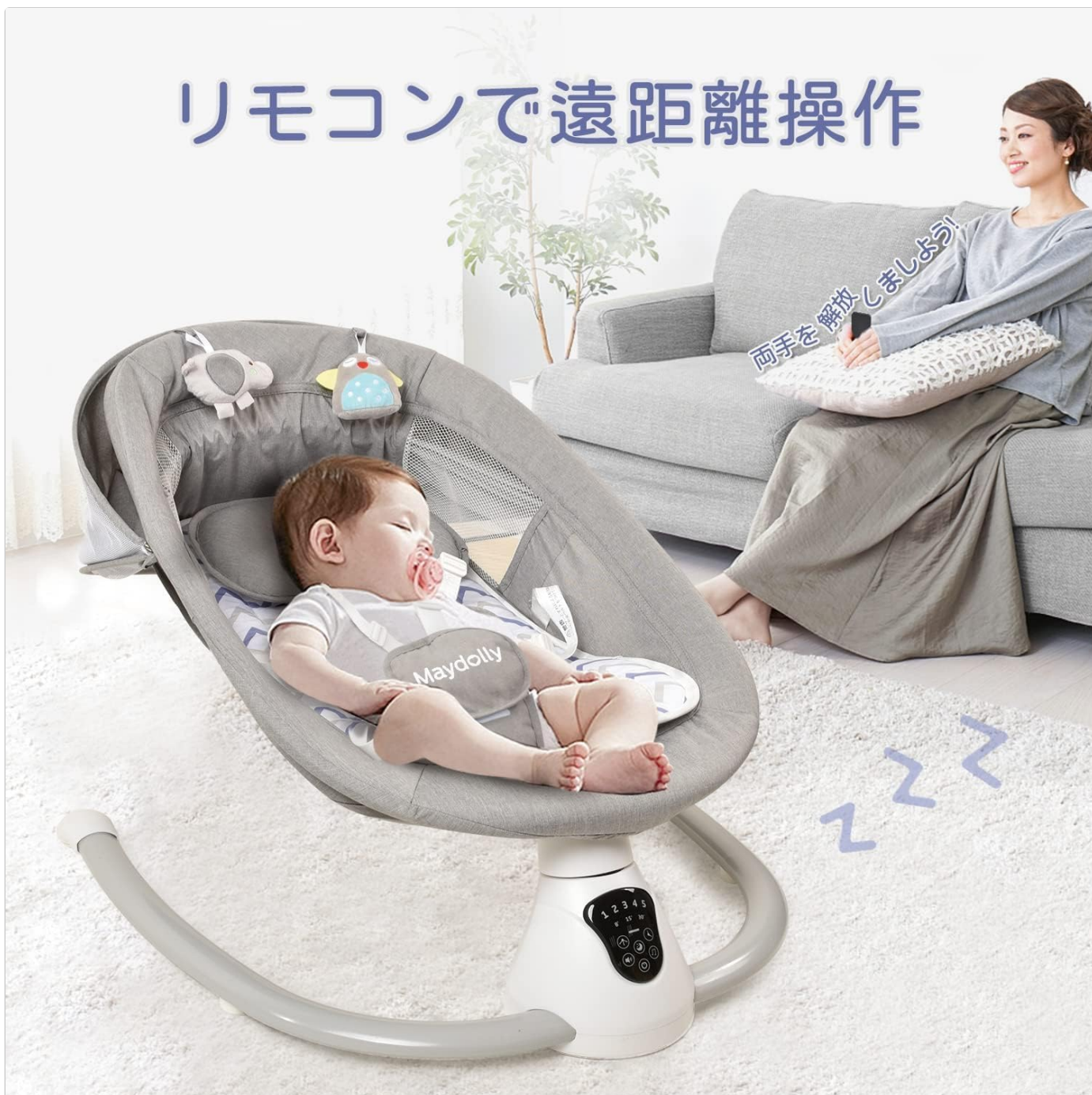
Image: A baby comfortably resting in the Maydolly Electric Baby Bouncer, with a remote control visible. This image highlights the remote operation feature.