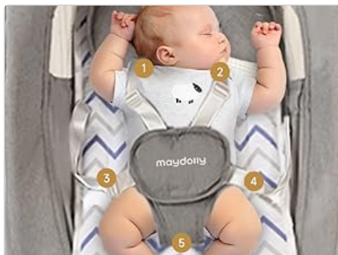
Image: A detailed view of the 5-point safety harness, emphasizing its role in securing the baby.