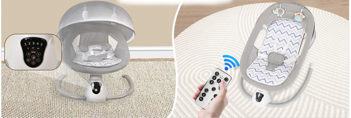
Image: Close-up of the bouncer's control panel, showing buttons for power, speed, timer, music, and volume. This illustrates the easy operation.