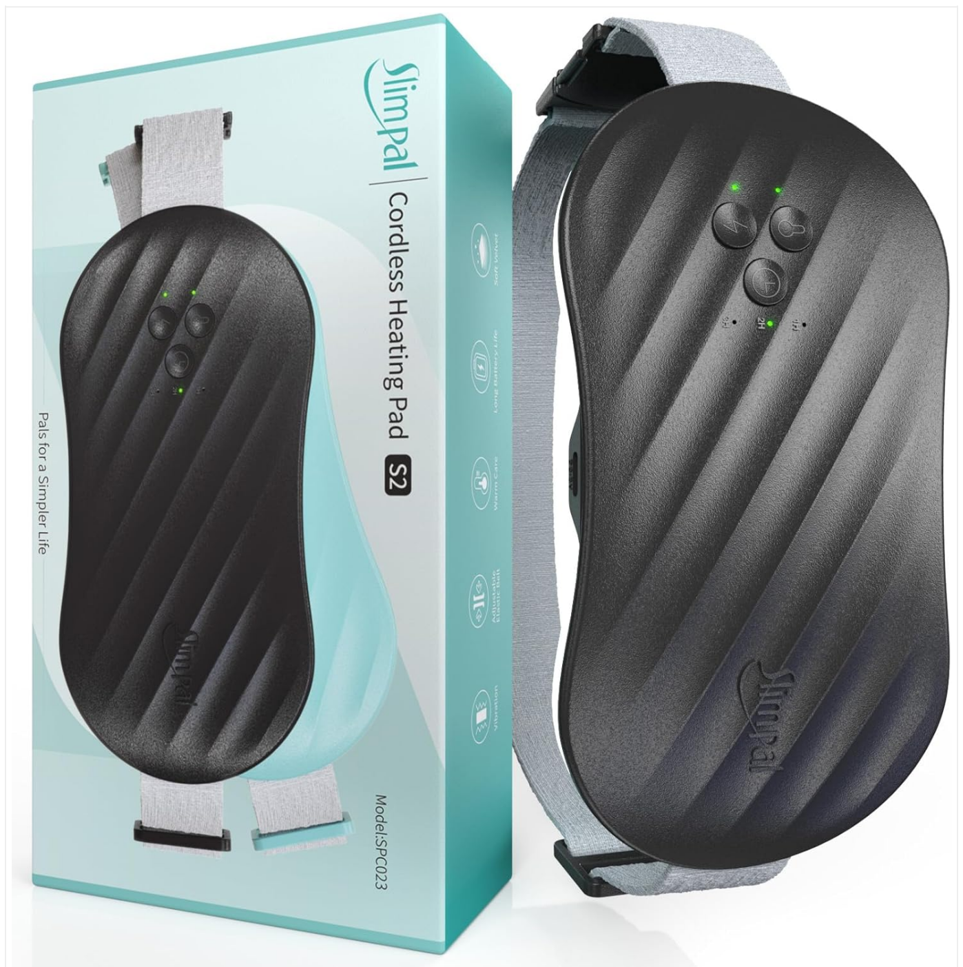
Image: The Slimpal SPC023-S2 Cordless Heating Pad shown with its retail packaging. The device is black with three control buttons and indicator lights, attached to an adjustable grey strap.