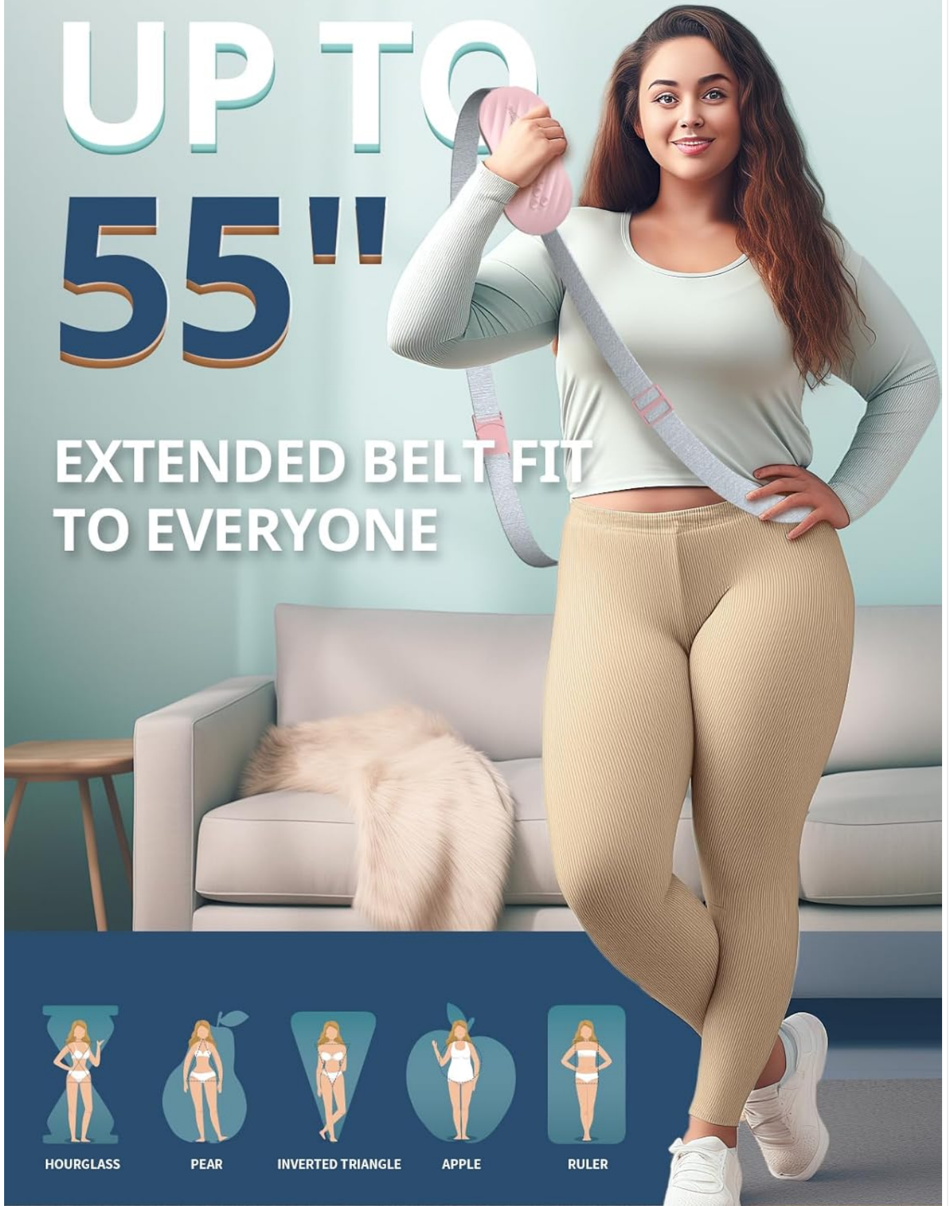
Image: A woman wearing the Slimpal heating pad around her waist, illustrating the extended belt fit suitable for various body types.