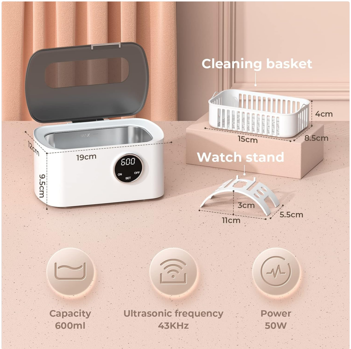
Image 1: Ultrasonic Cleaner and Included Accessories. This image displays the main unit, the cleaning basket, and the watch stand, along with their approximate dimensions. It also highlights the 600ml capacity, 43kHz ultrasonic frequency, and 50W power.