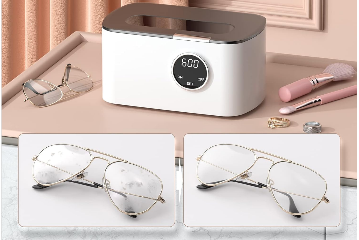
Image 3: Cleaning Effectiveness. This image illustrates the ultrasonic cleaner in operation, with a visual comparison of glasses before and after cleaning, demonstrating the 43kHz deep cleaning capability.

360° all-round deep cleaning of your items