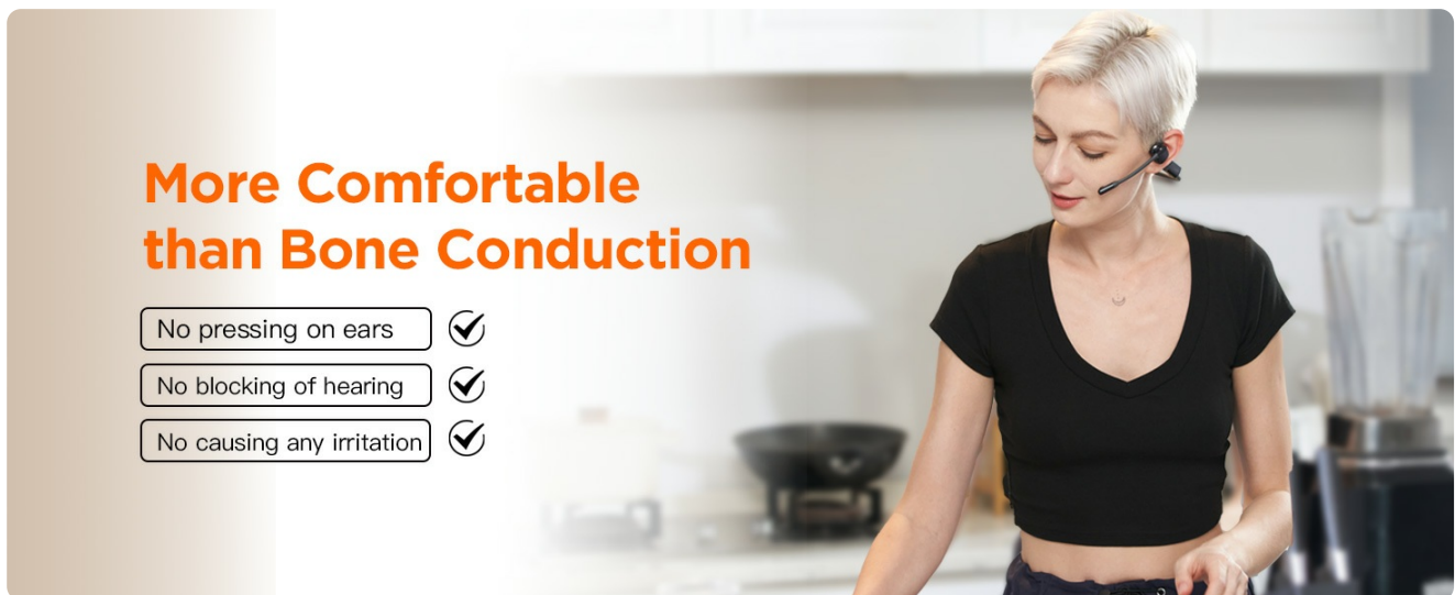
Figure 3.3: The open-ear design offers comfort and situational awareness, unlike traditional bone conduction headphones.

The open-ear design of the Pilot P100b allows you to remain aware of your surroundings while enjoying audio. The flexible neckband and ear hooks provide a secure and comfortable fit without pressing on your ears or causing irritation.