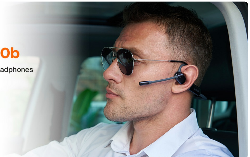
Figure 1.1: oleap Pilot P100b Open-Ear AI Noise Canceling Headphones in use.