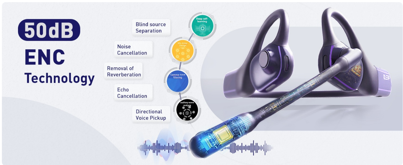
Figure 3.2: The 50dB ENC technology actively reduces background noise for clearer calls.

Video 3.1: This video demonstrates the microphone's noise-canceling capabilities of the OLEAP Pilot headset in a noisy environment.