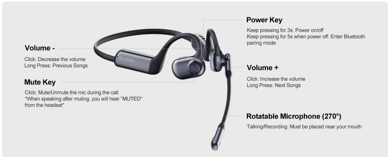
Figure 1.2: Key controls and components of the oleap Pilot P100b headset.