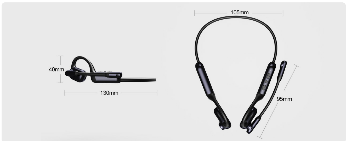
Figure 6.1: Dimensions of the oleap Pilot P100b headset.