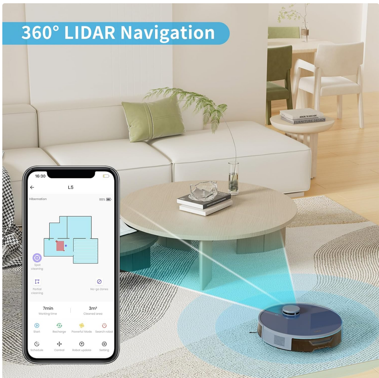
Figure 3: Robot mapping your home for efficient cleaning

The L5 uses LiDAR technology to create and save accurate maps of your home. This allows for efficient navigation and the ability to customize cleaning schedules for different floors without re-mapping. Through the app, you can define "no-go zones" to restrict the robot from certain areas (e.g., pet bowls, delicate decor) or set "invisible walls" to create virtual barriers.