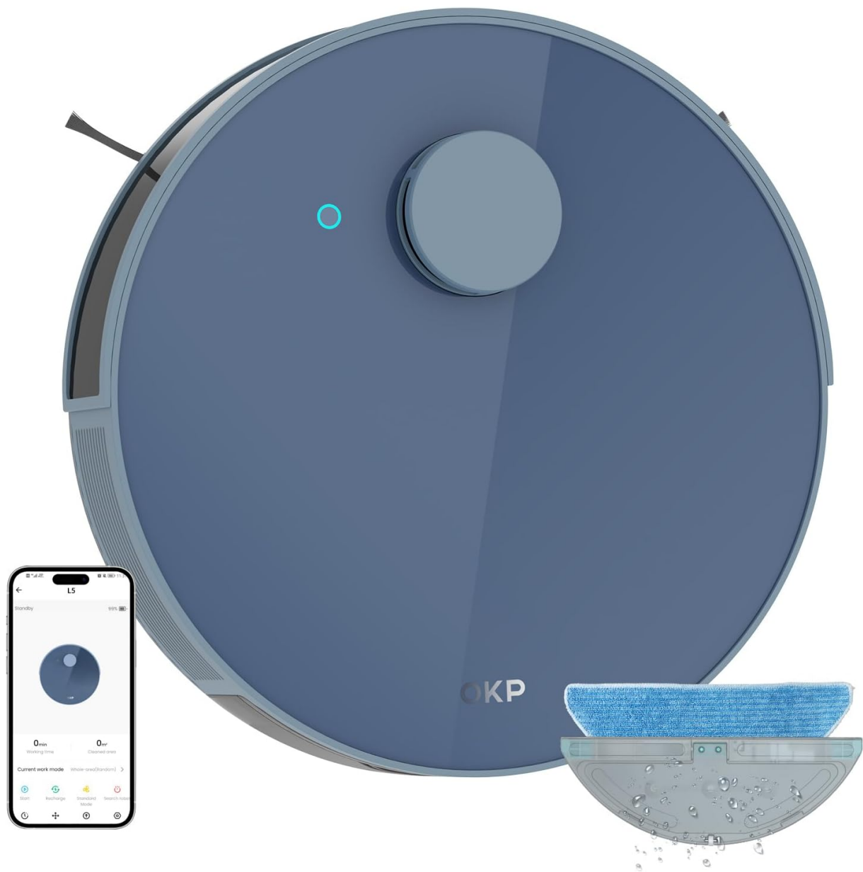
Figure 1: OKP Life L5 Robot Vacuum and Mop Combo