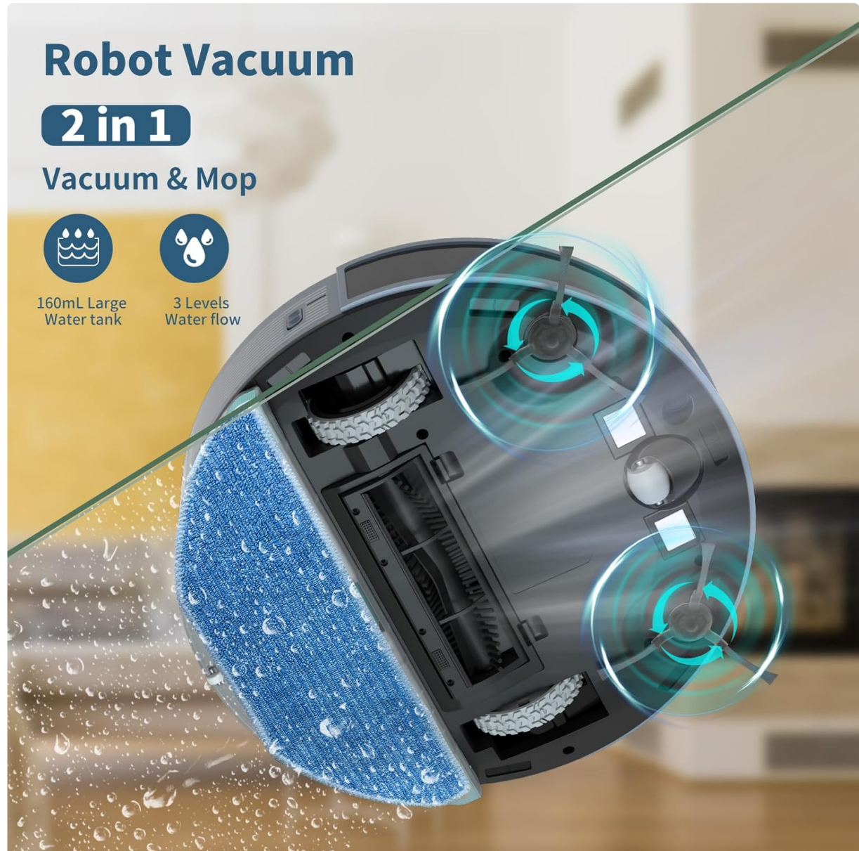
Figure 2: Underside of the robot with brushes and mop pad

Carefully remove all components from the packaging. Ensure all accessories, including the charging dock, power adapter, dustbin, water tank, side brushes, and filters, are present. Install the side brushes by pressing them onto the designated posts on the underside of the robot.