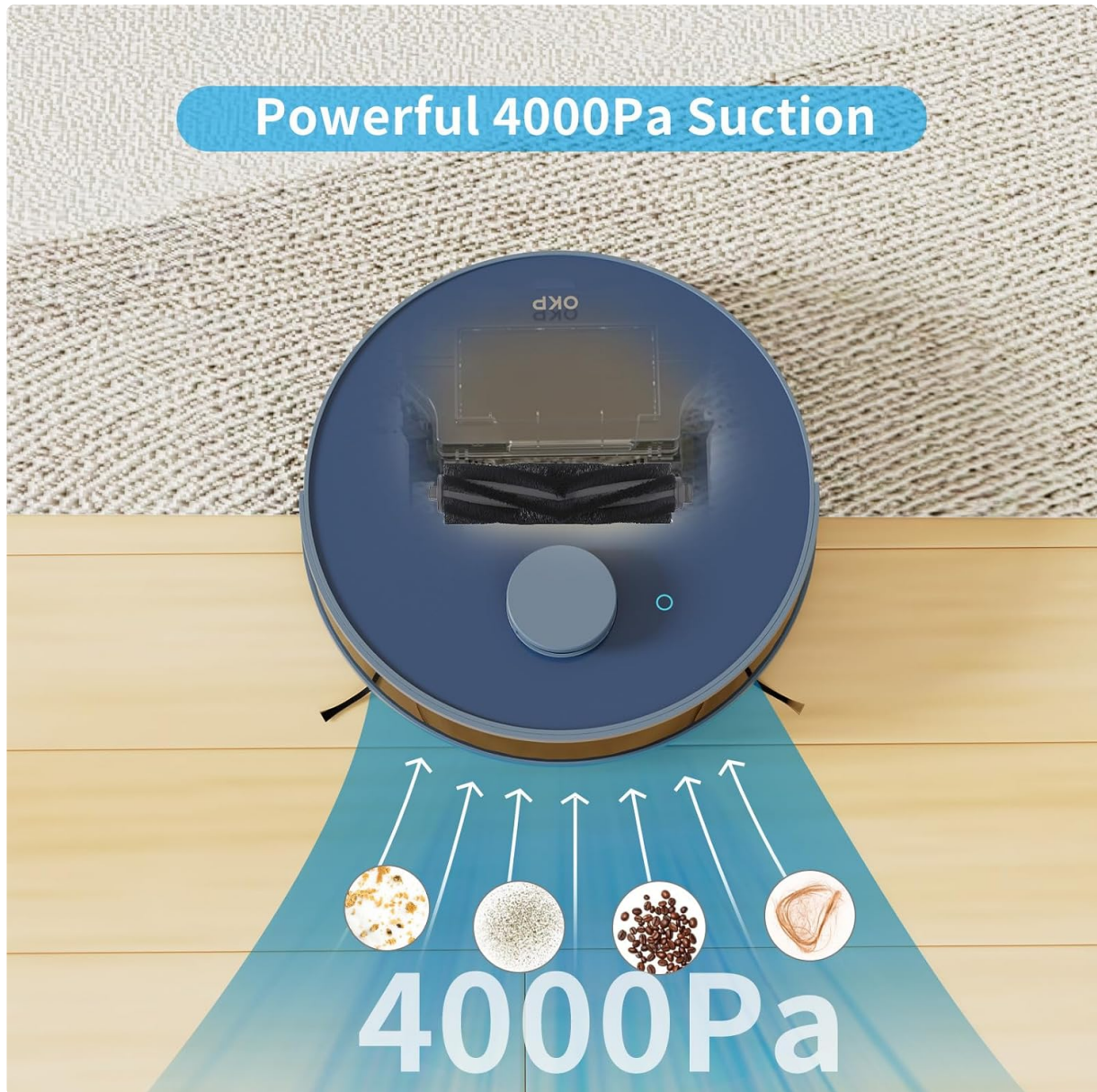
Figure 4: Powerful 4000Pa suction for deep cleaning

boosts suction on carpets. For mopping, ensure the 160ml water tank is filled and attached. The robot offers 3-level water output control for different cleaning needs. Remember to remove the water tank when cleaning carpets to avoid wetting them.