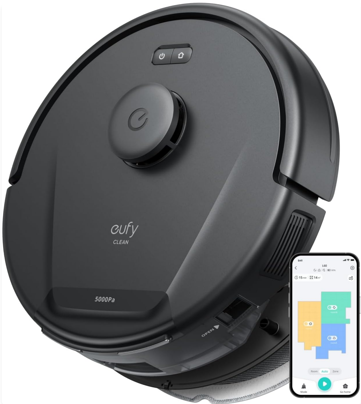
The eufy RoboVac L60 Hybrid, a versatile robotic vacuum and mop, shown alongside its companion app interface which displays the cleaning map and controls.