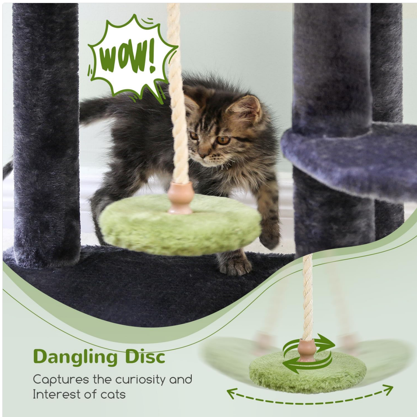
Image 5.3: The dangling disc toy, attached to a sisal rope, designed to capture a cat's attention and encourage play.