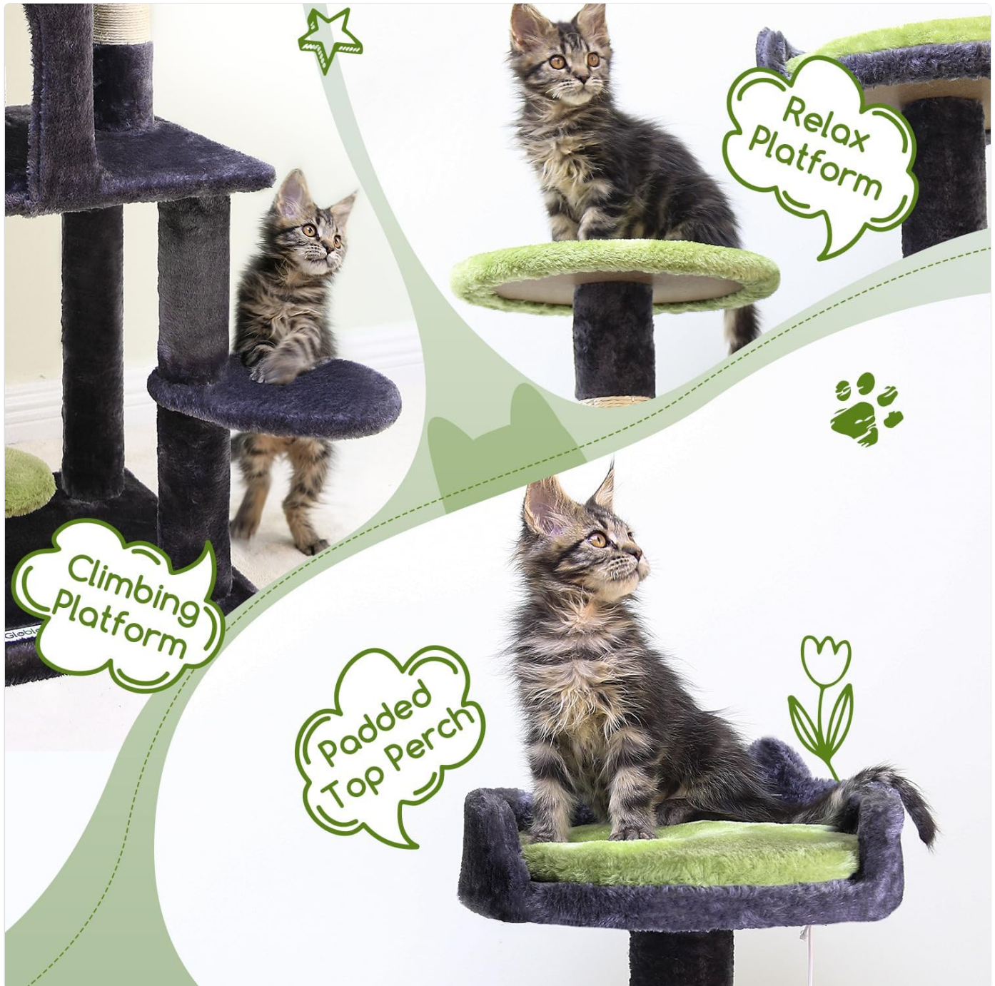
Image 5.1: Detailed view of the padded top perch, relax platform, and the climbing platform, highlighting their design for cat comfort and accessibility.