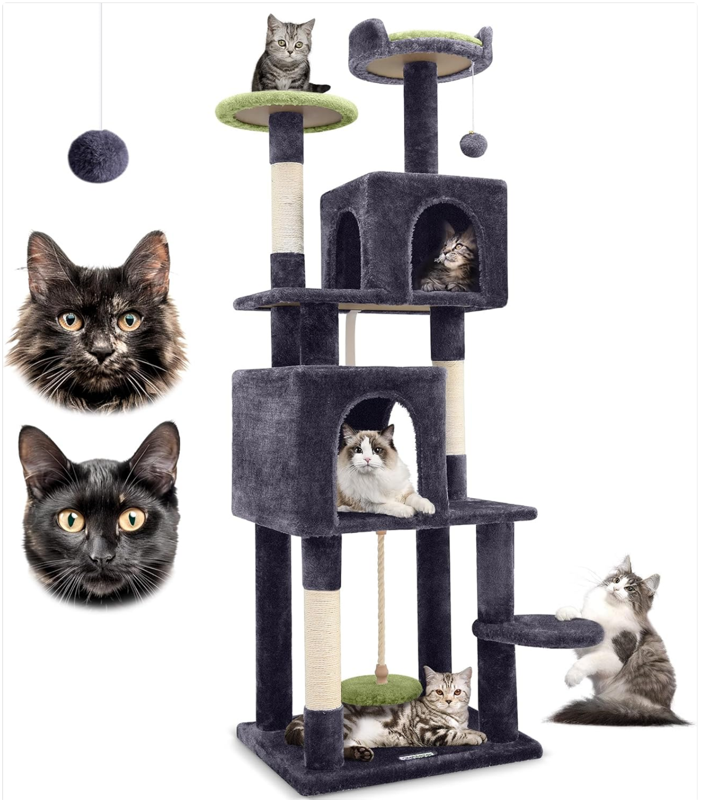
Image 1.1: The Globlazer 62-inch Multi-Level Cat Tree, showcasing its various features and multiple cats enjoying the structure.