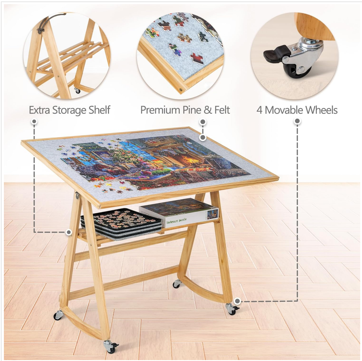
Image: Overview of table features, including the storage shelf and movable wheels.