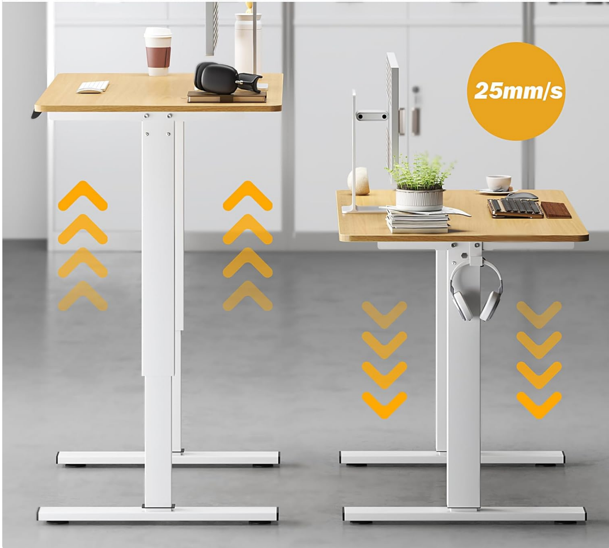
Figure 5.2: Depicts the desk's ability to smoothly transition between sitting and standing heights at a speed of 25mm/s, promoting a dynamic work environment.