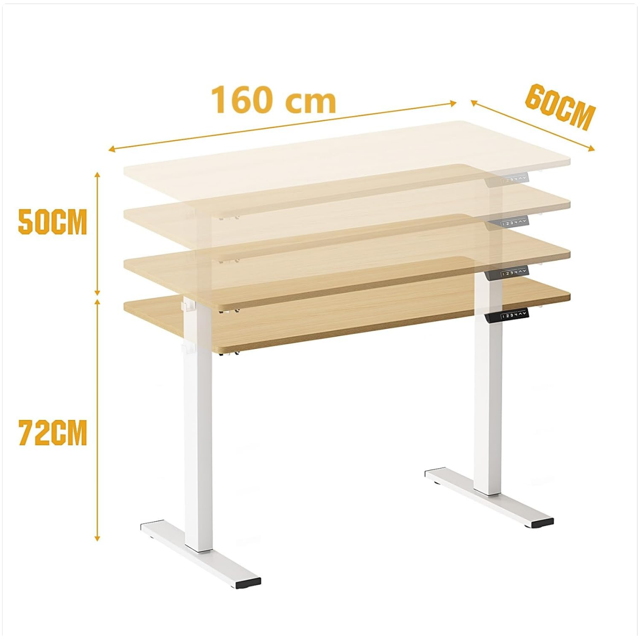
Figure 5.1: Illustrates the adjustable height range of the desk, from a minimum of 72 cm to a maximum of 122 cm, providing a 50 cm adjustment span for ergonomic sitting and standing positions.