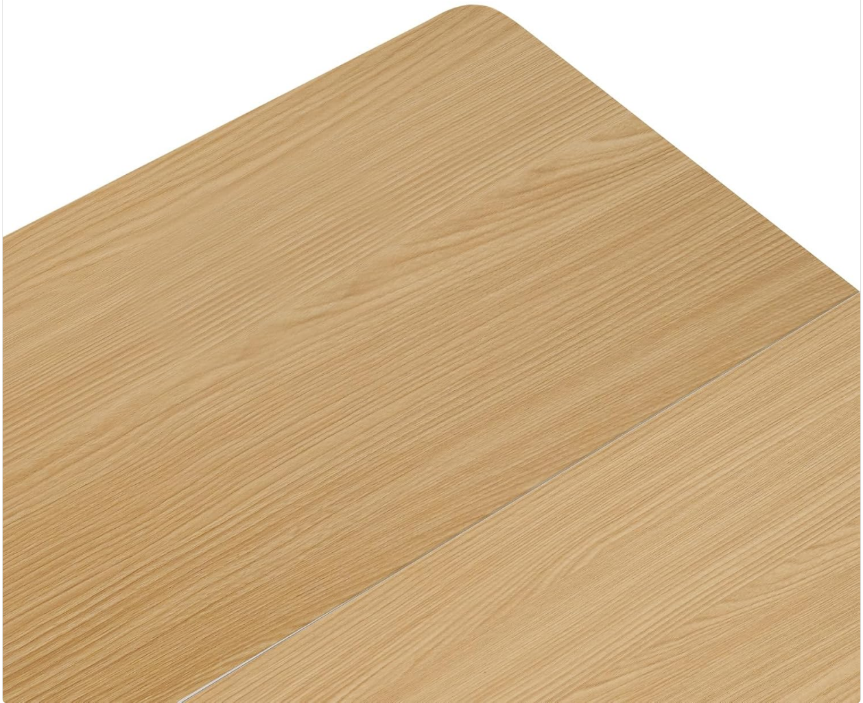
Figure 4.2: A close-up view of the desktop surface, highlighting the joint where the two desktop pieces meet. This design ensures a large working area while facilitating easier packaging and assembly.