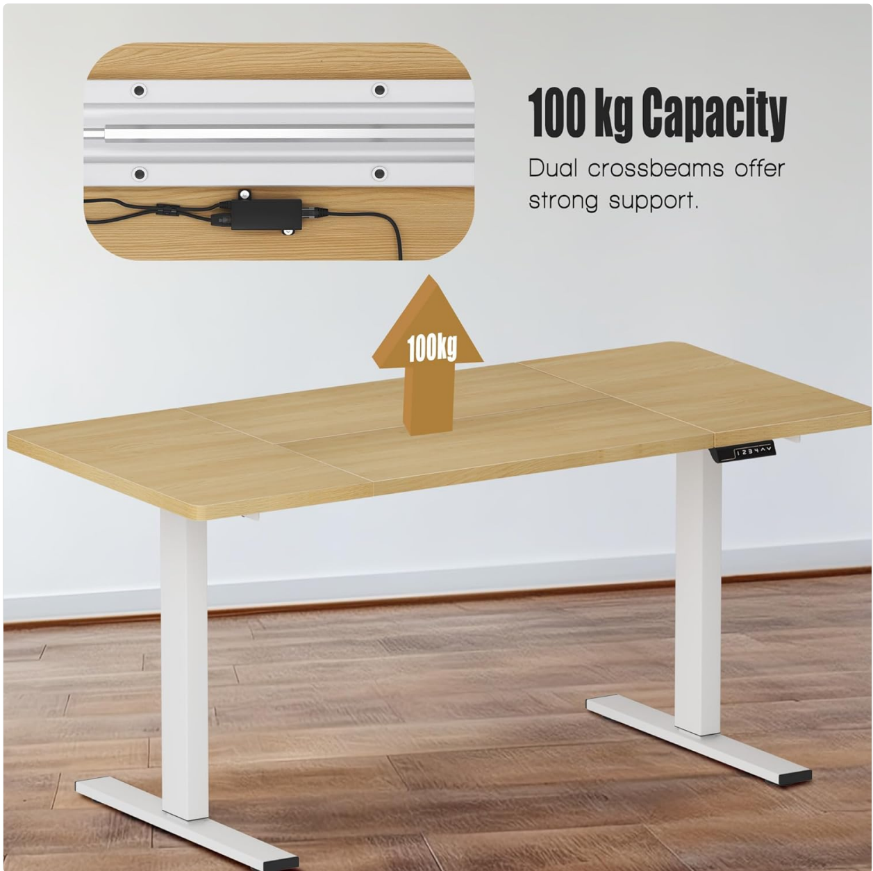
Figure 8.1: Illustrates the desk's robust construction with dual crossbeams, designed to support a significant load. While the image indicates 100 kg, the official specification is 80 kg.