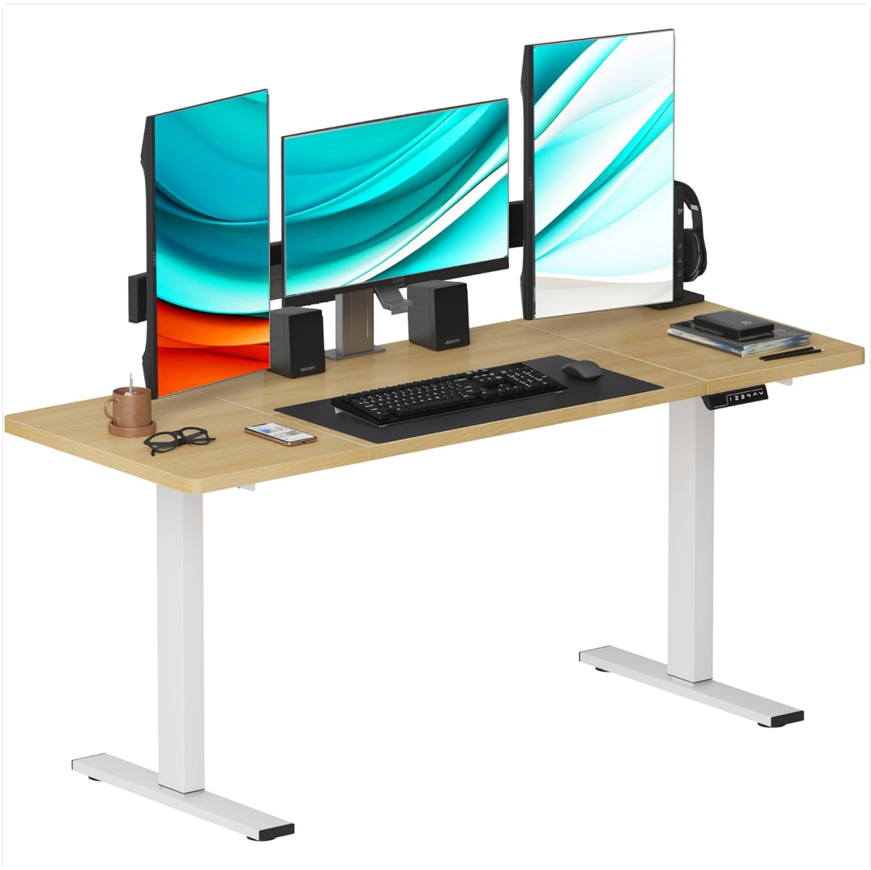
Figure 4.1: Fully assembled SogesHome Electric Height Adjustable Desk, showcasing its spacious desktop and sturdy frame. The desk is shown with multiple monitors and accessories, demonstrating its capacity as a functional workstation.