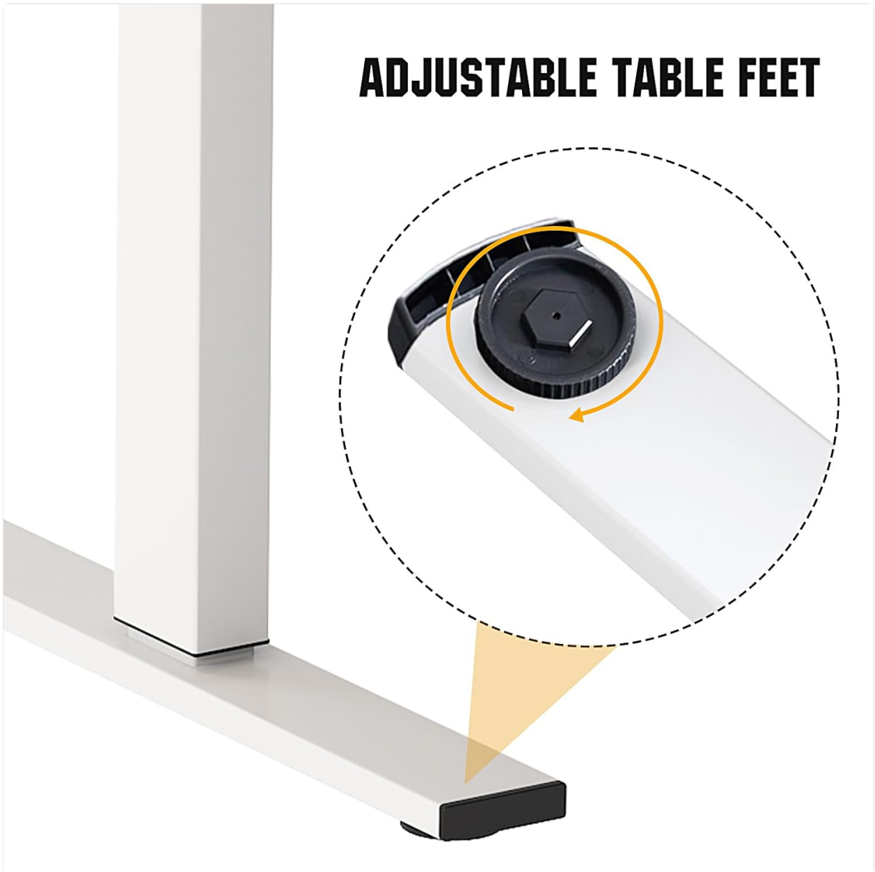
Figure 4.3: Detail of the adjustable table feet located at the base of the desk legs. These feet can be rotated to compensate for uneven floor surfaces, ensuring the desk remains stable and level.