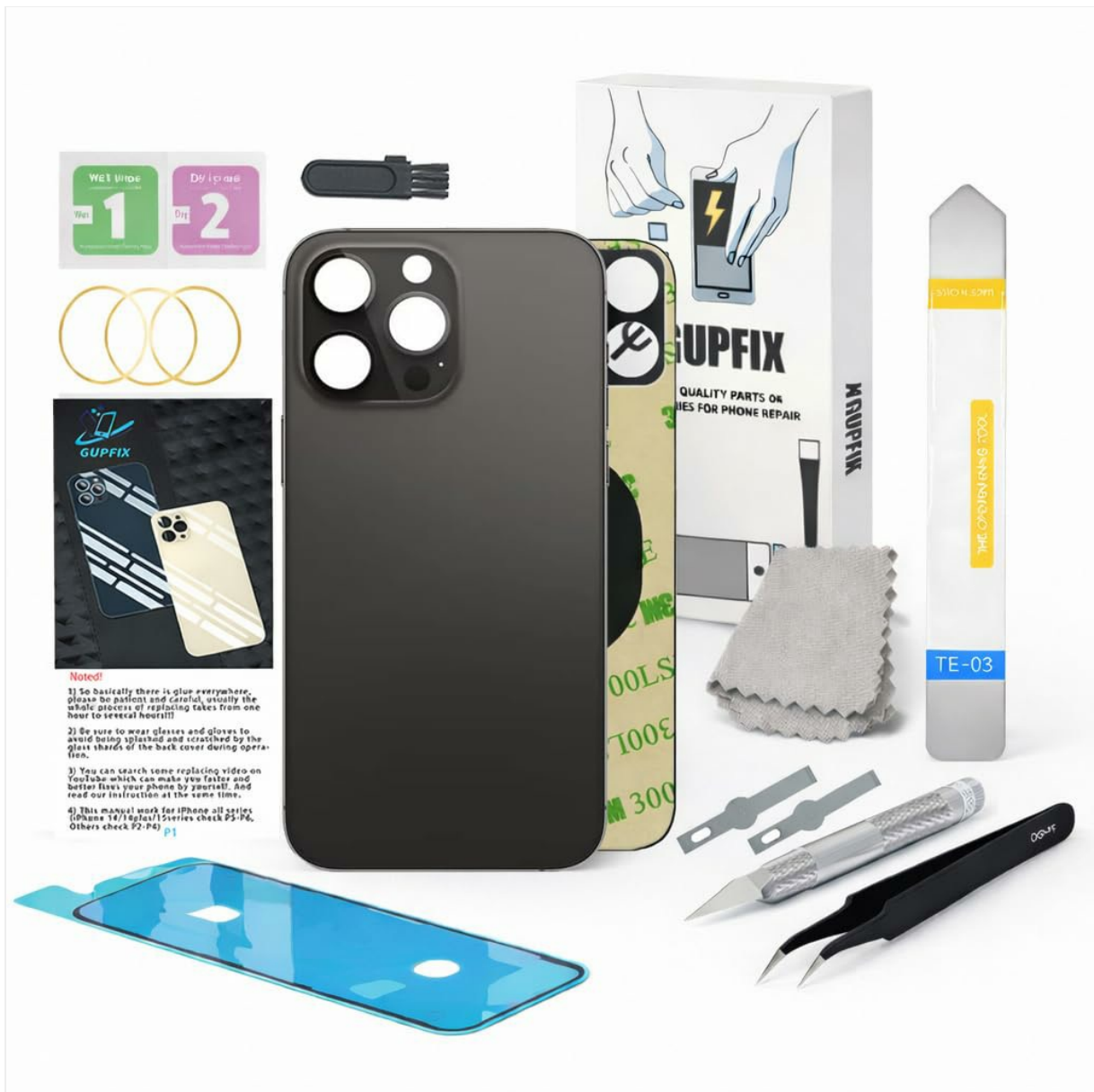
Image: GUPFIX Space Black back glass replacement for iPhone 14 Pro Max.

Important: This back glass is only compatible with the iPhone 14 Pro Max. Please verify your phone model before proceeding with the installation.