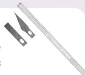
Image: Overview of the repair tools provided in the kit.

Metal knife and two piece of No.17 knife head are use to remove the broken glass