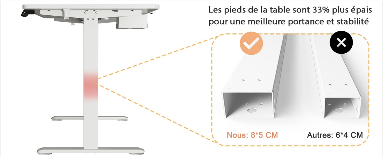
Figure 8.1: Homall desk legs are 33% thicker (8x5 cm) compared to standard designs (6x4 cm), enhancing stability.