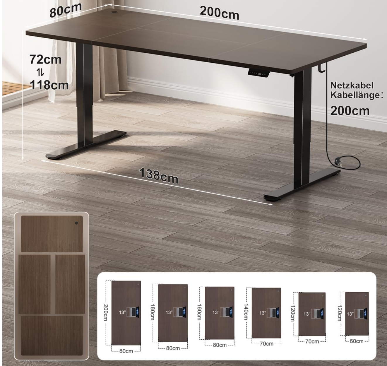
Figure 4.1: Desk dimensions and a visual representation of the four-part desktop construction.