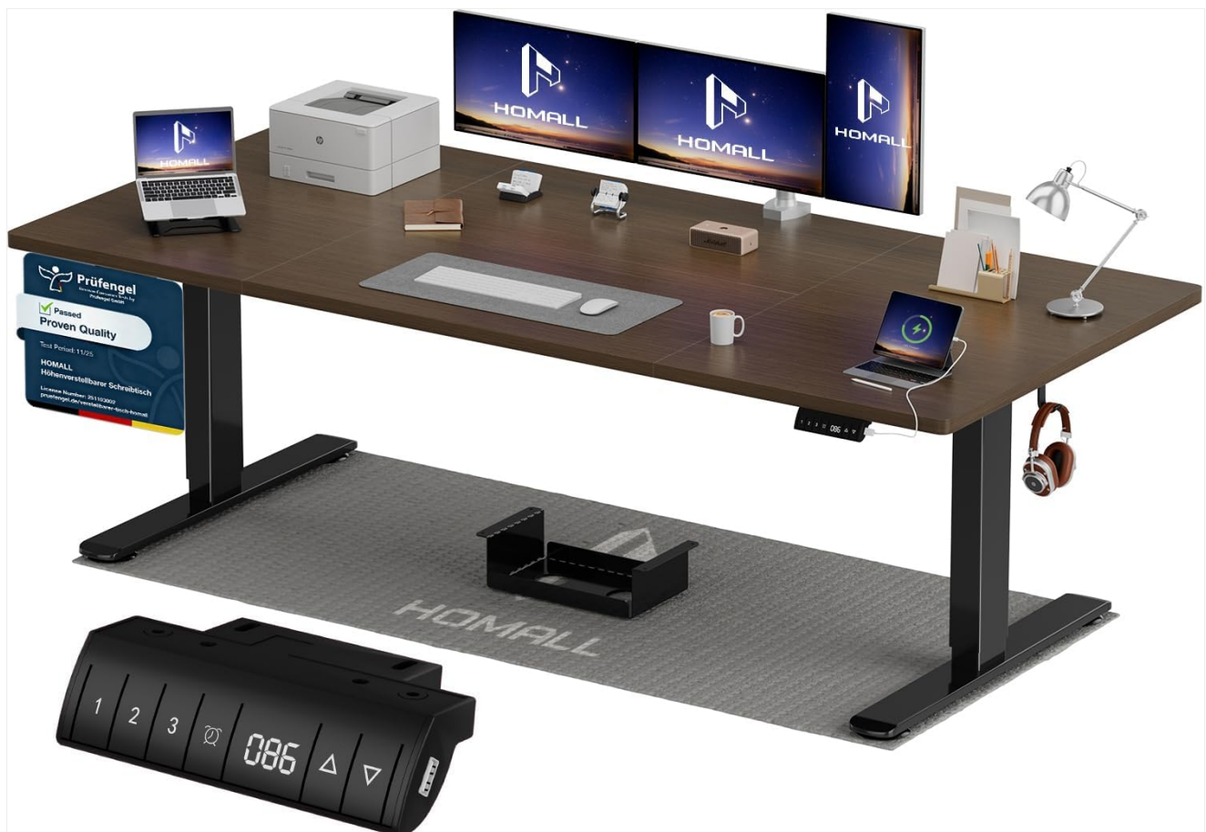
Figure 1.1: Homall Electric Sit-Stand Desk in a typical office setup.