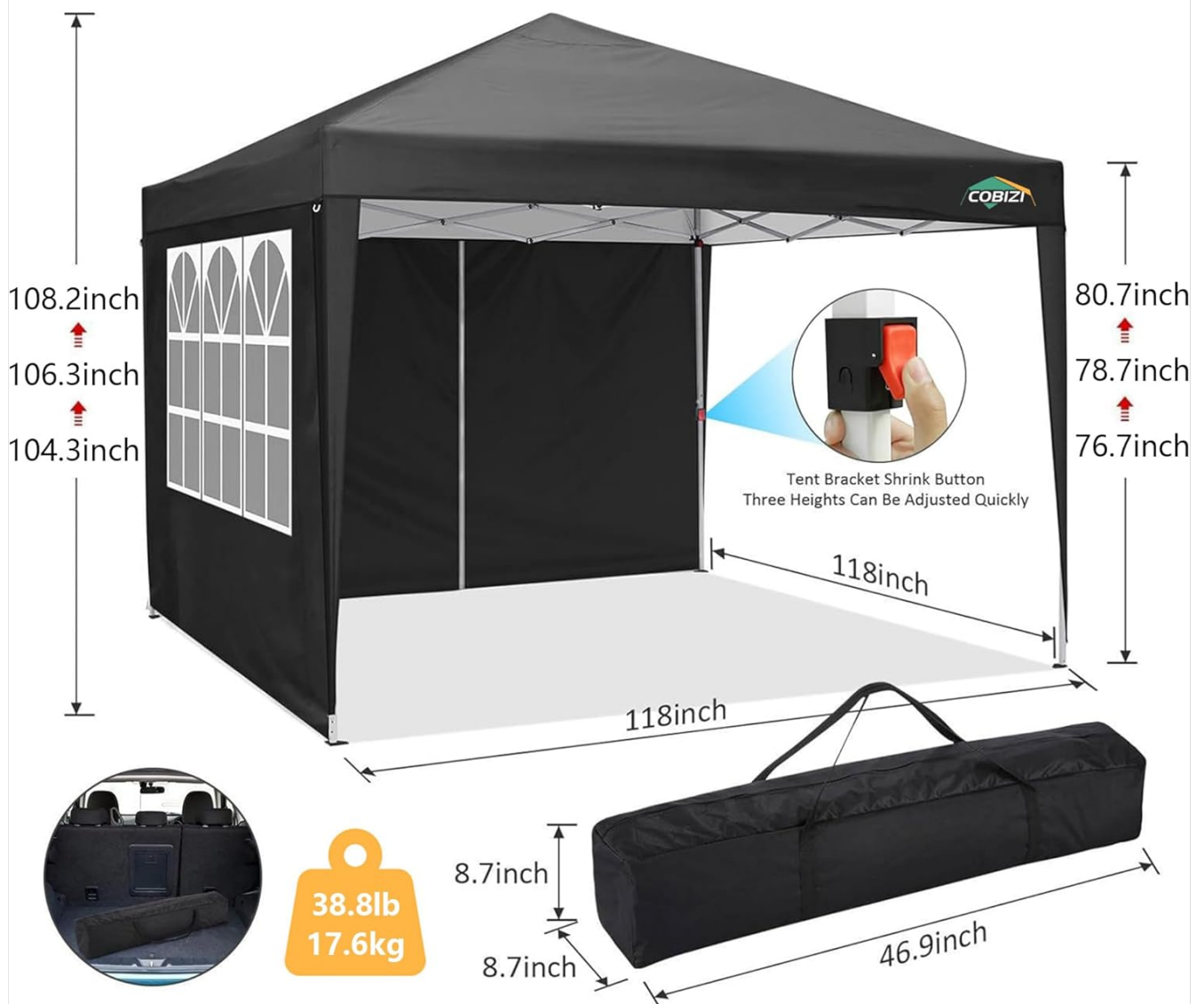
Figure 7.1: Detailed dimensions of the COBIZI 10x10 Pop Up Canopy Tent.

Height adjustment hole can be used to quickly adjust height