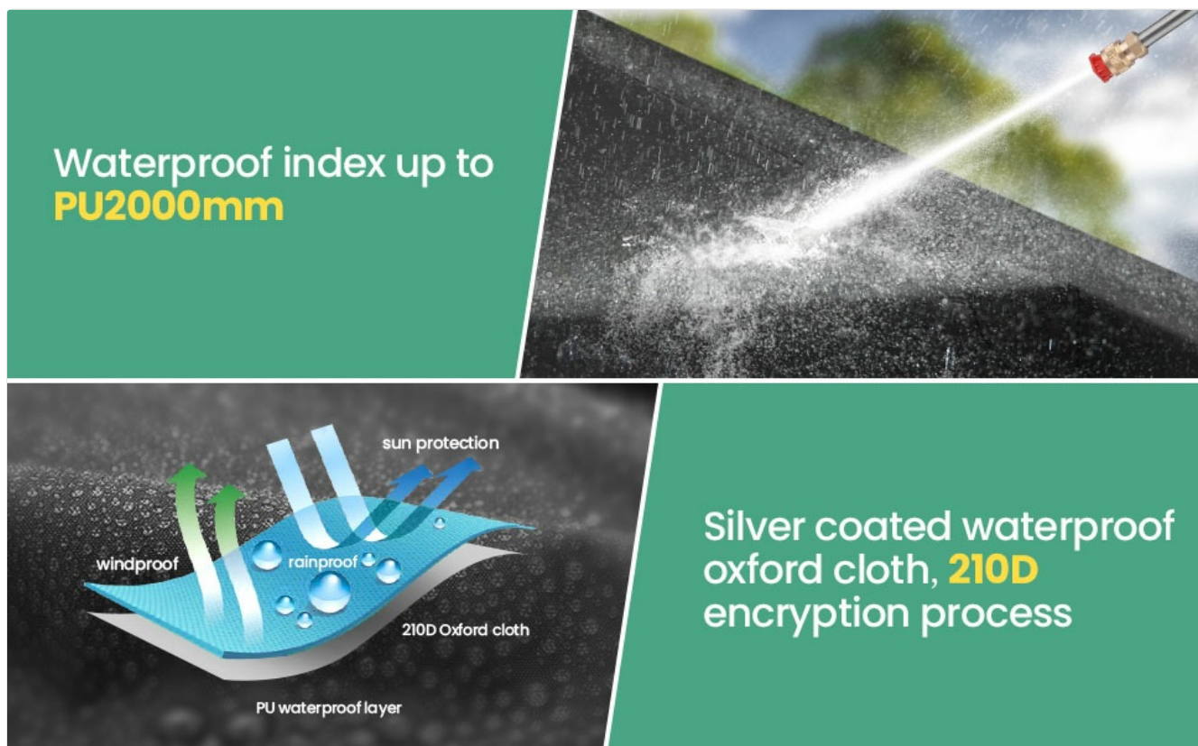
Figure 5.1: The canopy features 210D silver-coated oxford fabric with a PU2000mm waterproof index and UPF 50+ sun protection.

weights (not included) for extra security in moderate wind conditions.