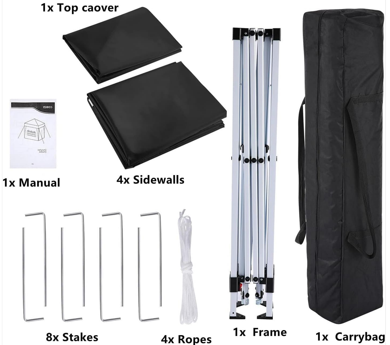
Figure 2.1: All components included in the COBIZI 10x10 Pop Up Canopy Tent package.