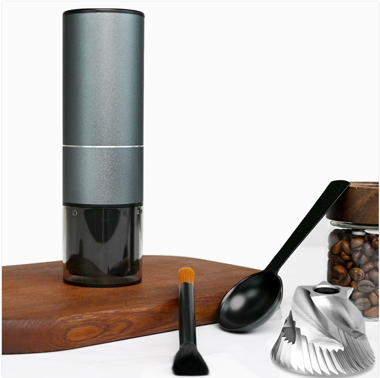
Figure 1: Main unit of the NEXT-SHINE Electric Coffee Grinder.