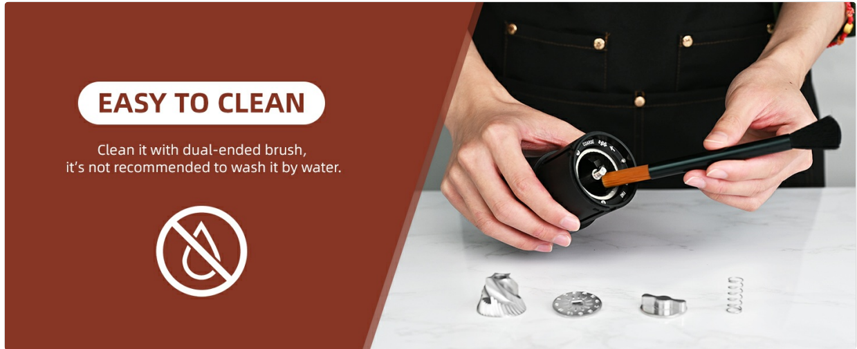
Figure 7: Cleaning the conical burr and grinding chamber with the provided brush.

Regular cleaning ensures optimal performance and preserves the flavor of your coffee.