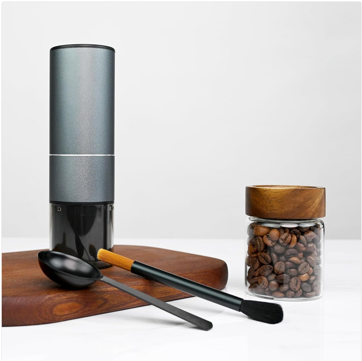
Figure 3: The coffee grinder shown with its included accessories, such as the cleaning brush and spoon.