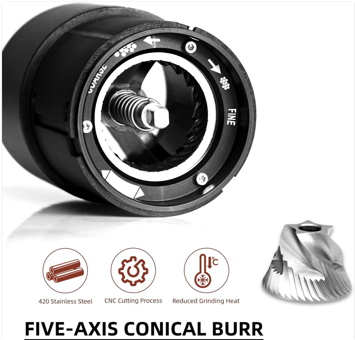
Figure 2: Close-up view of the CNC Stainless Steel Conical Burr, highlighting its robust construction.