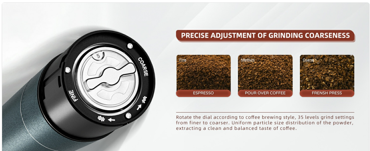
Figure 5: Recommended grind settings for various brewing methods.