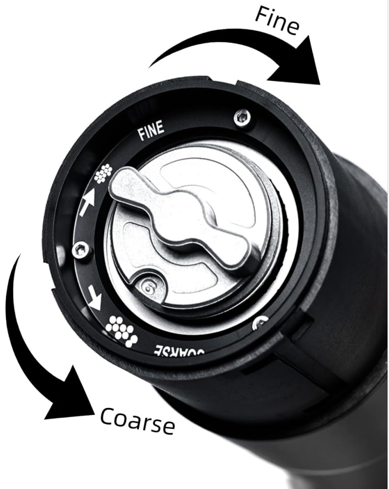
Figure 4: Adjusting the grind size using the numerical dial.