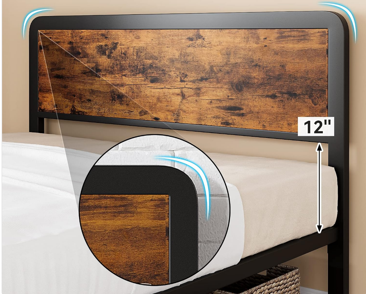
Figure 6: Safety Rounded Corners. The headboard features safe rounded corners, designed to prevent accidental bumps and provide a comfortable lean height of approximately 12 inches from the mattress to the bottom of the headboard.