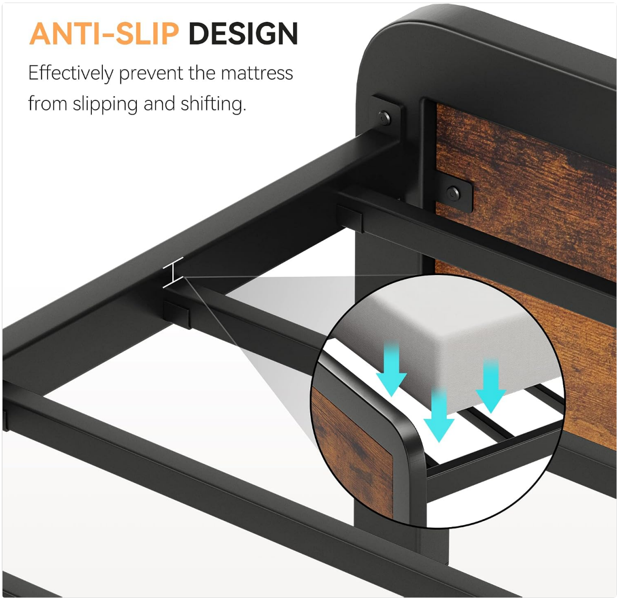
Figure 4: Anti-Slip Design. An anti-slip design is integrated into the bed frame to effectively prevent the mattress from shifting or slipping, ensuring a stable sleeping surface.

Effectively prevent the mattress from slipping and shifting.