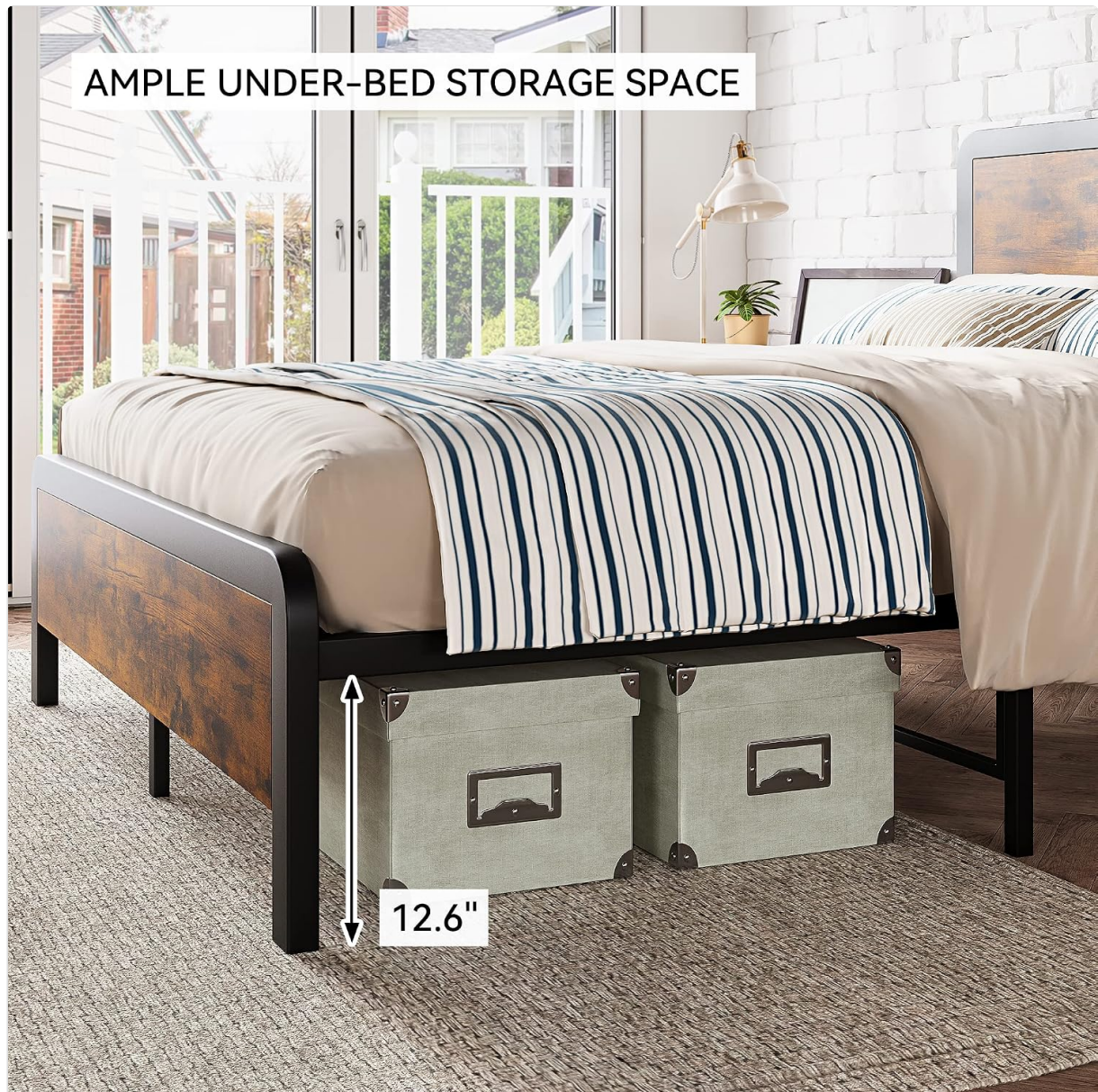
Figure 3: Ample Under-Bed Storage Space. The bed frame offers 12.6 inches of under-bed clearance, providing ample space for storage boxes or other items, helping to keep your bedroom organized.

Benefit from 12.6 inches of clearance beneath the bed frame, providing ample space for storage containers, boxes, or other items to help keep your bedroom tidy.