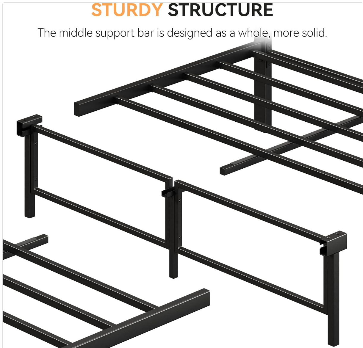
Figure 2: Sturdy Structure. The bed frame is constructed with a sturdy metal support structure, including a middle double-row support bar and multiple support legs, ensuring stability and durability for your mattress.