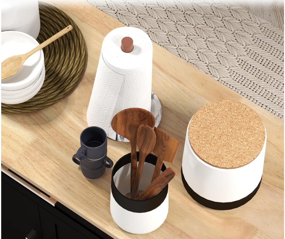
Figure 4: Close-up of the solid natural rubberwood top, emphasizing its smooth finish and durability.

Hard rubberwood ensure it holds up to everyday living