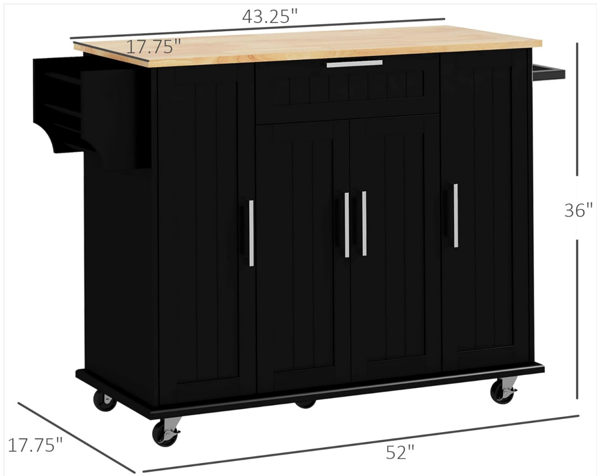
Figure 7: Diagram illustrating the overall dimensions of the kitchen island: 52 inches (W) x 17.75 inches (D) x 36 inches (H).