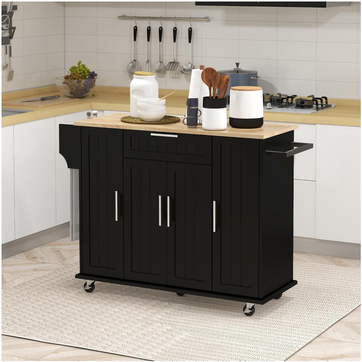
Figure 2: The kitchen island integrated into a kitchen environment, demonstrating its functional size and aesthetic appeal.