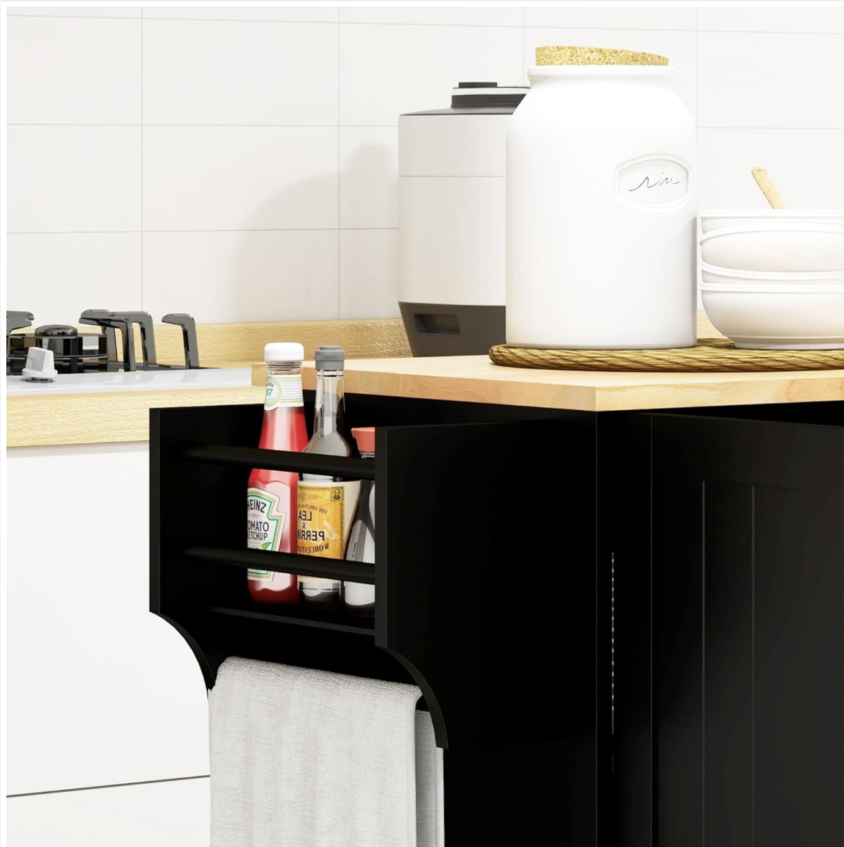
Figure 8: Close-up view of the integrated side spice rack and towel bar, demonstrating their practical design for kitchen essentials.