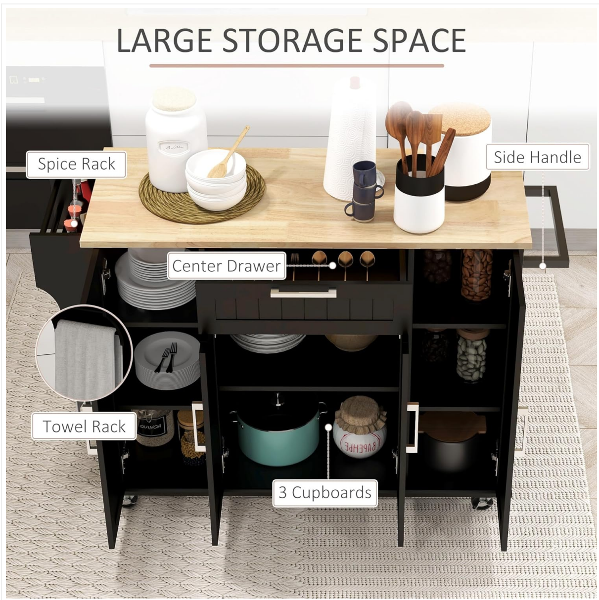
Figure 3: View of the kitchen island with all cabinet doors open, highlighting the large storage space, central drawer, spice rack, and towel rack.