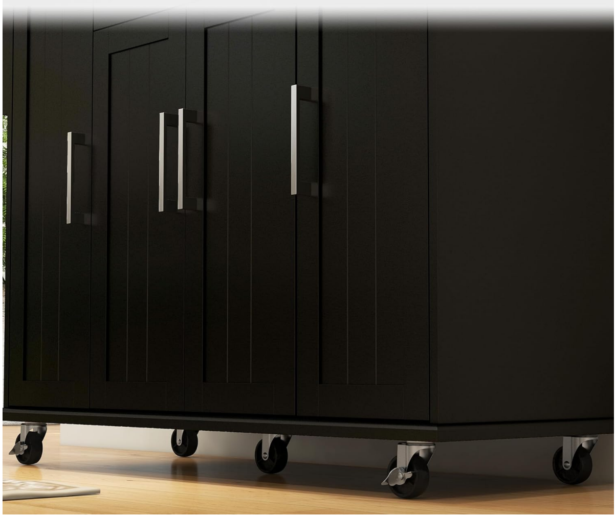
Figure 6: Detail of the five rolling castors at the base of the island, two of which are equipped with brakes for stability.