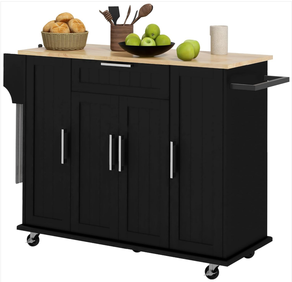
Figure 1: Front view of the HOMCOM Kitchen Island on Wheels, showcasing its black finish and rubberwood top.