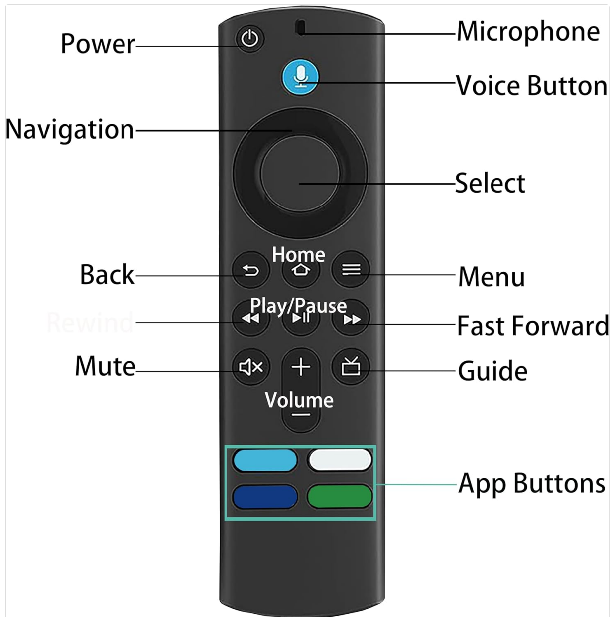
Figure 3.1: Labeled buttons of the L5B83G Voice Remote Control.