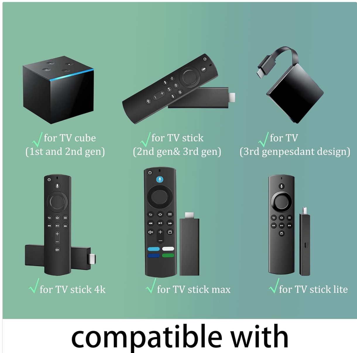
Figure 6.1: Visual guide to compatible Smart TV devices.