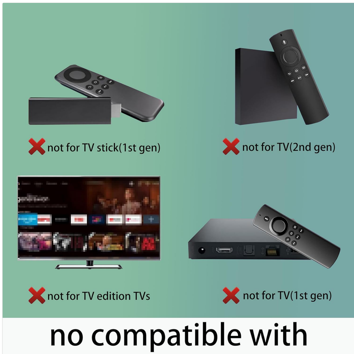
Figure 6.2: Visual guide to incompatible Smart TV devices.