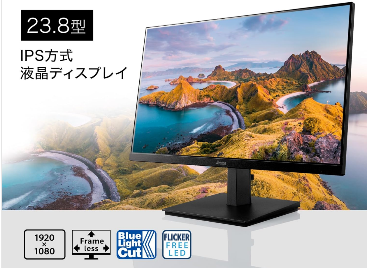
Figure 3: The monitor displayed in a professional environment, emphasizing its suitability for both office and remote work with features like IPS technology, Full HD resolution, frameless design, Blue Light Cut, and Flicker-Free LED.