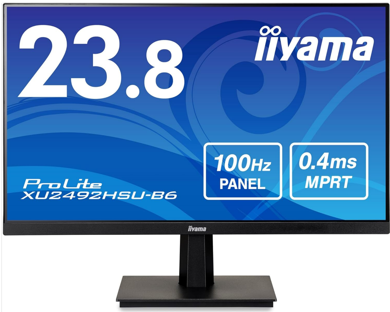
Figure 1: Front view of the IIYAMA ProLite XU2492HSU-B6 monitor, highlighting its 23.8-inch display, 100Hz refresh rate, and 0.4ms MPRT response time.