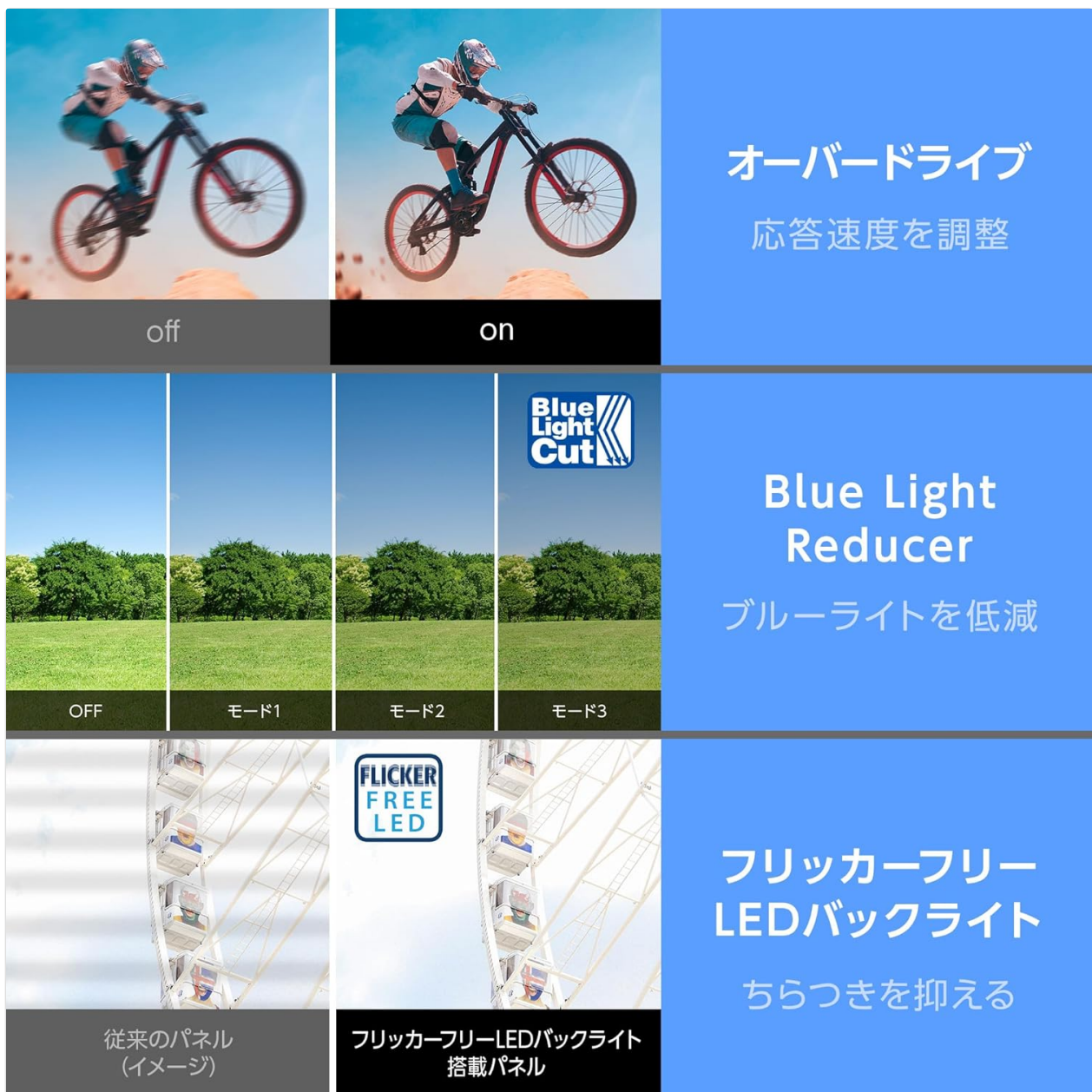
Figure 5: Illustrations of Overdrive for response time adjustment, Blue Light Reducer for blue light reduction, and Flicker-Free LED technology to prevent screen flickering.