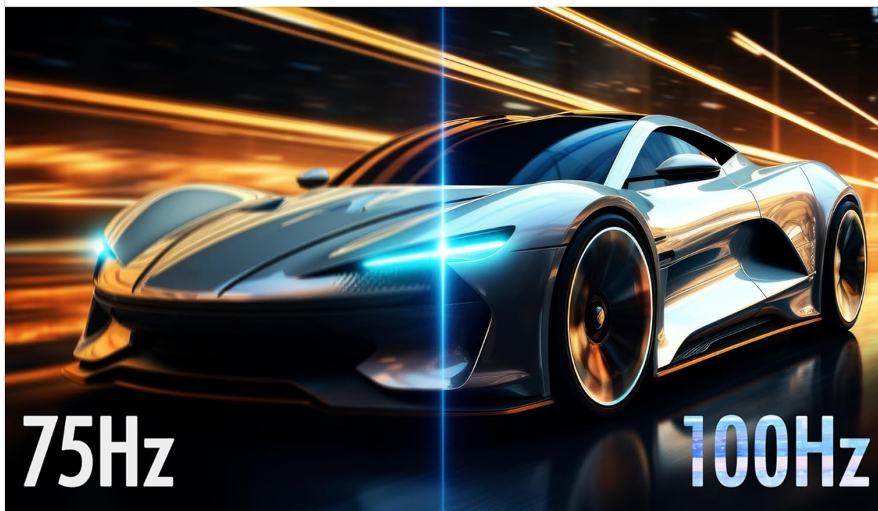
Figure 4: Visual explanation of the 100Hz refresh rate for smooth motion and the 0.4ms MPRT (Moving Picture Response Time) for reduced blur.