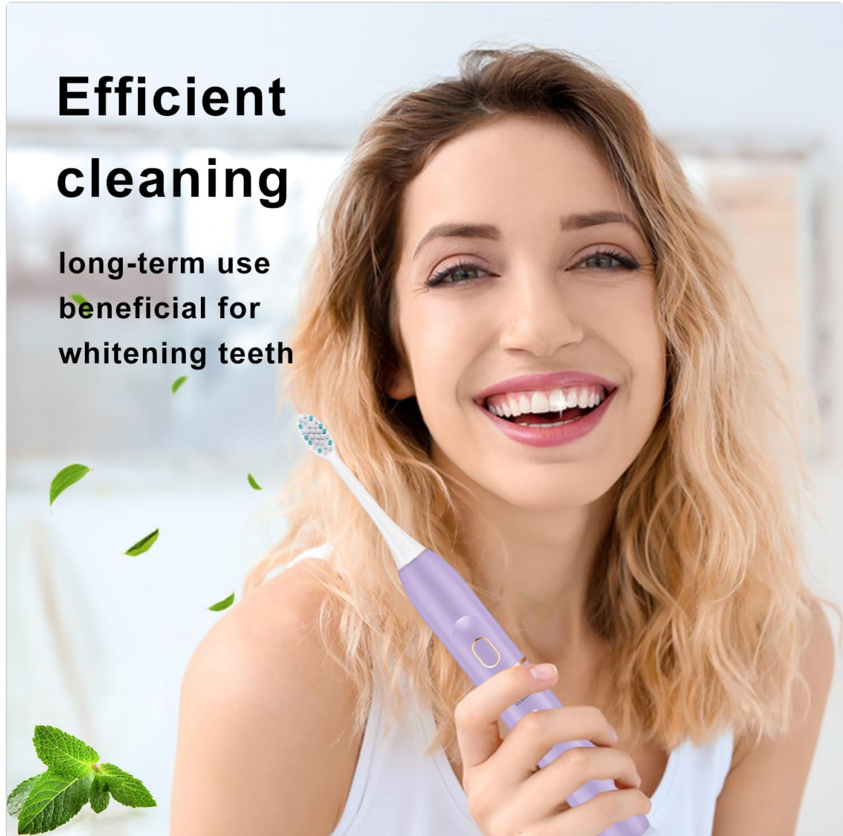
Image: The kingheroes C2PRO toothbrush in use, highlighting its efficient cleaning capabilities.