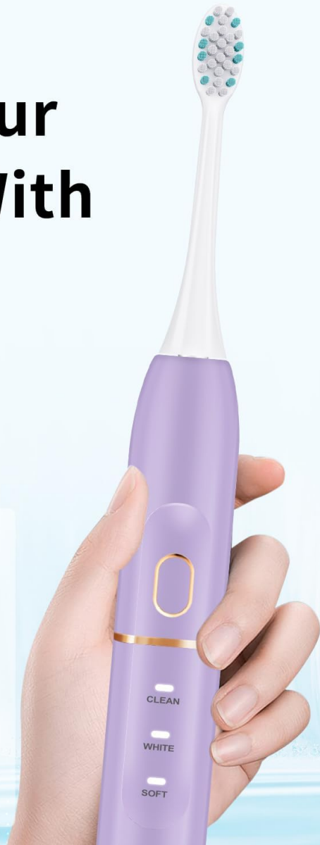
Image: Detailed view of the toothbrush handle displaying the four distinct brushing modes.