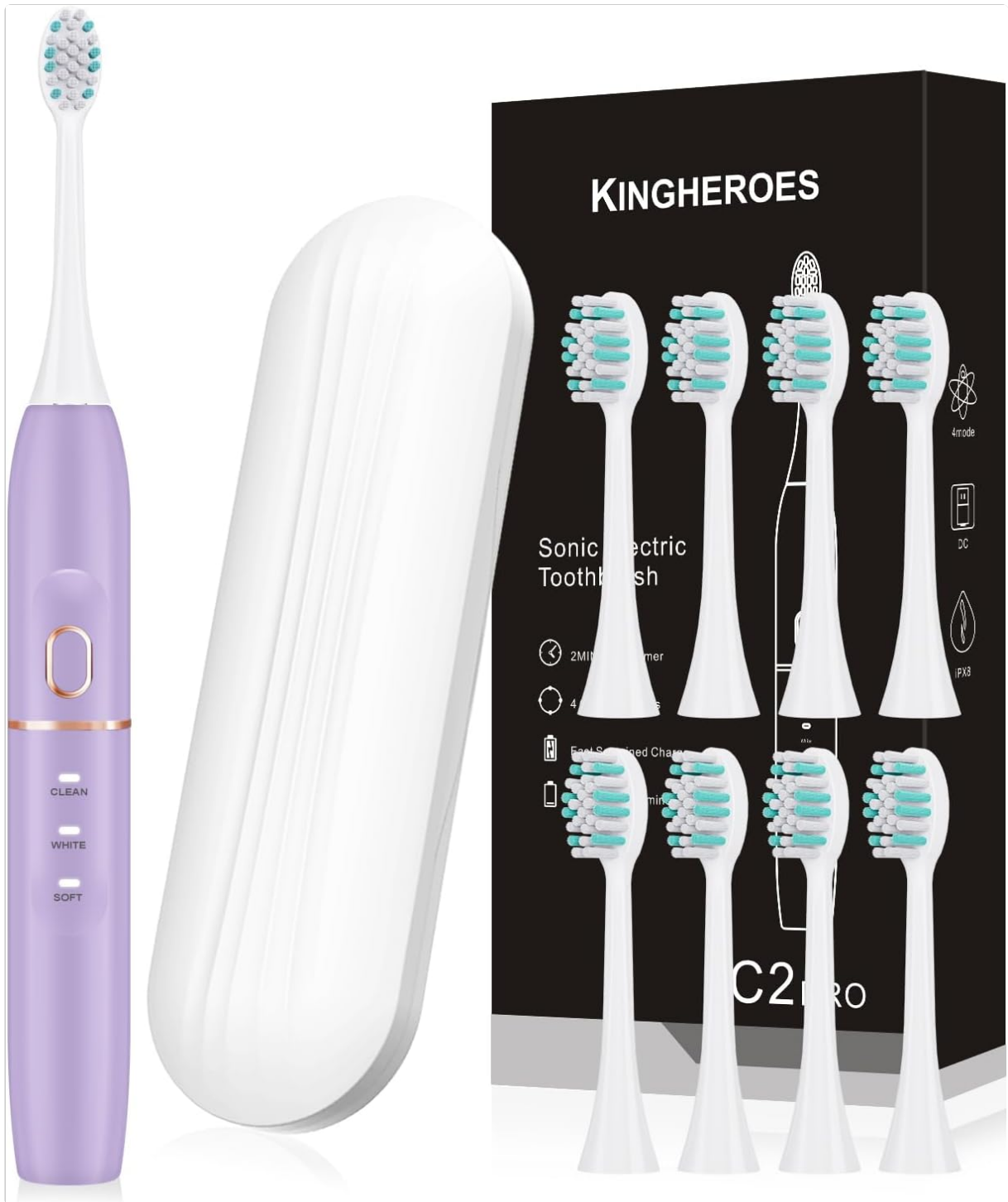
Image: Complete package contents including the purple toothbrush, 8 brush heads, charging cable, and travel case.