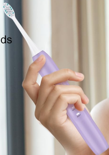
Image: Visual representation of the intelligent 2-minute brushing timer with 30-second quadrant reminders.