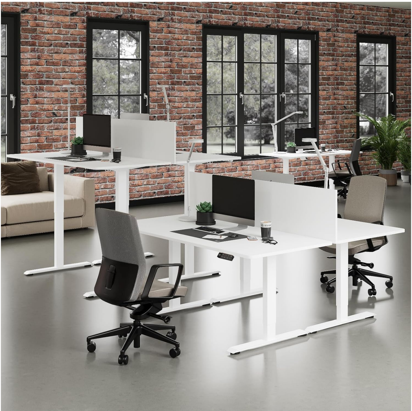
Image 1.1: The TRIUMPHKEY Height Adjustable Desk in a modern office environment.