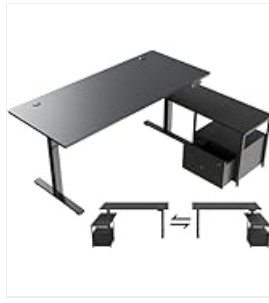
Image 6.1: The integrated cable management tray helps keep your workspace tidy.