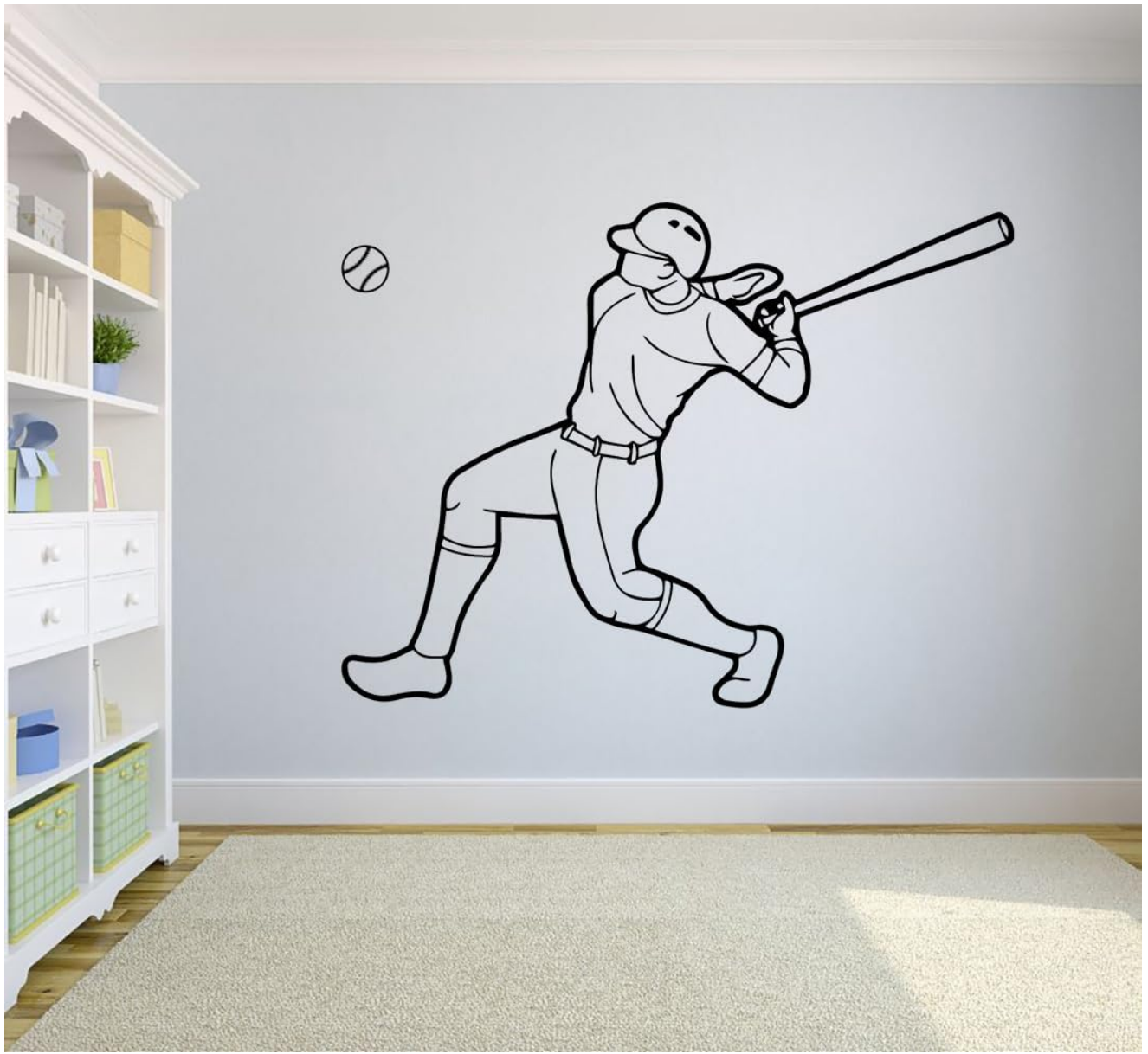
Figure 5.1: Example of the Xerial YU59 Baseball Player Wall Decal applied to a wall.