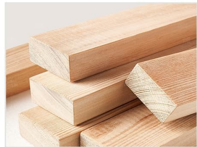
Solid Wood Frame

Image: Visual representation of the internal components: high bounce springs, high-density sponge, and solid wood frame, highlighting the quality of construction.