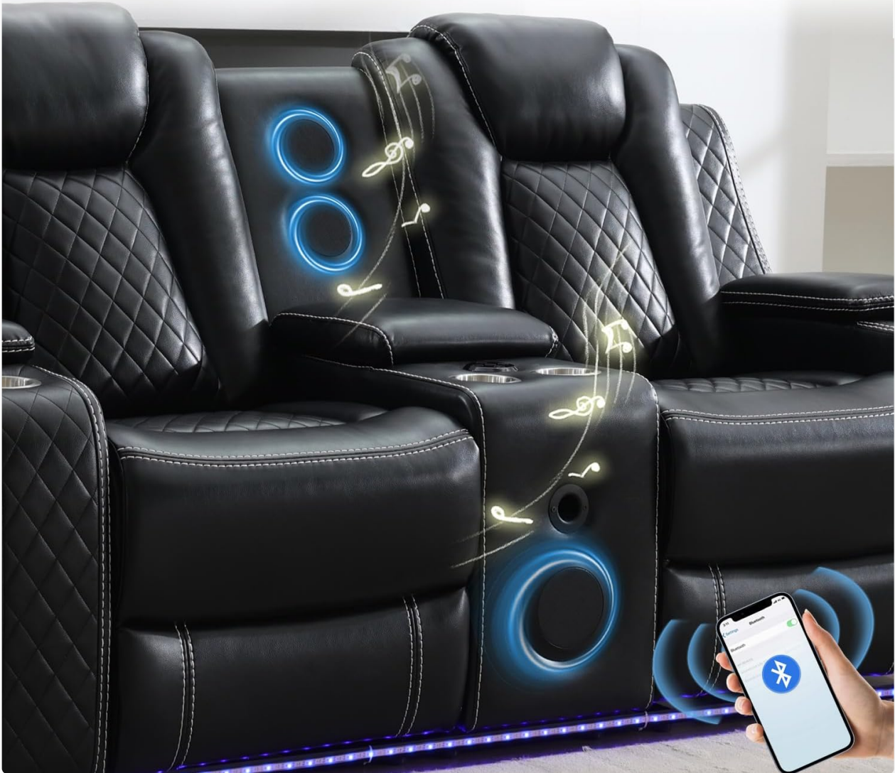
Image: A detailed view of the loveseat's center console, highlighting the built-in bass speakers and a smartphone indicating a successful Bluetooth connection.