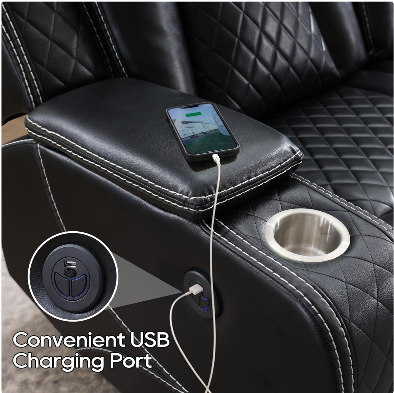
Image: A close-up of the loveseat's armrest, showing a convenient USB charging port in use with a smartphone.