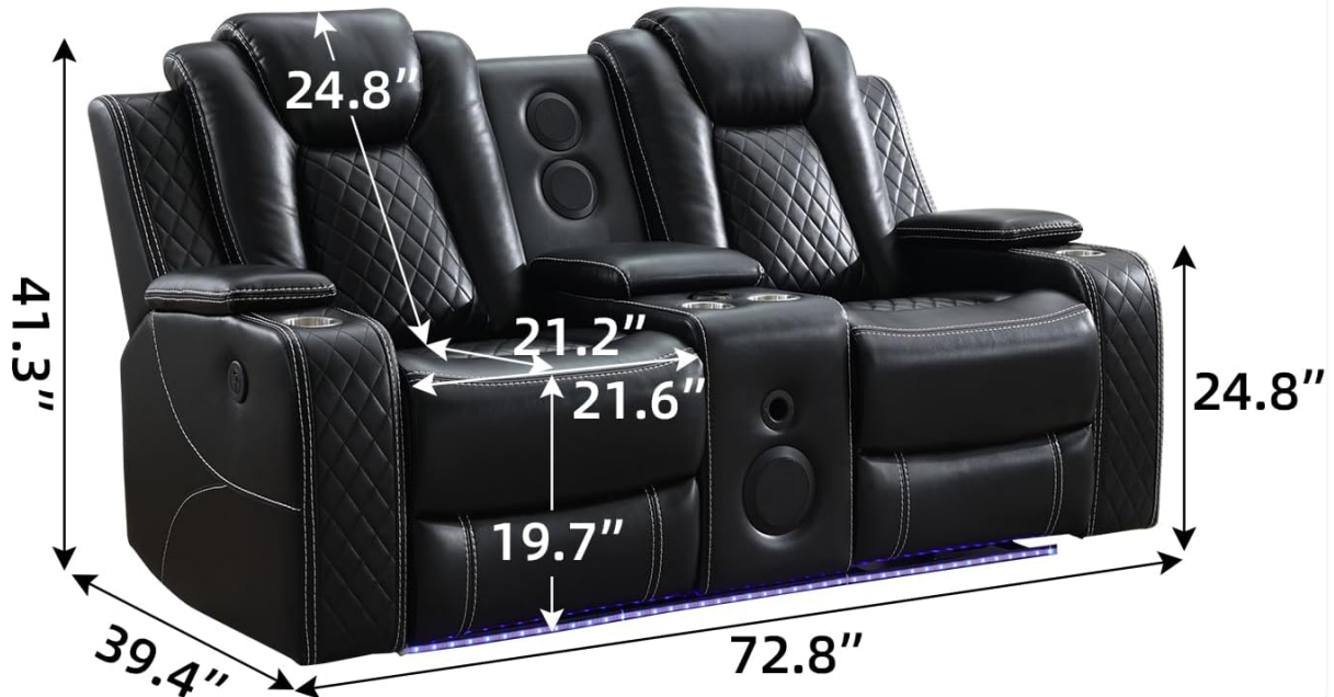
Image: A detailed diagram illustrating the dimensions of the loveseat, including height, width, and depth.