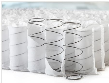
High Bounce Spring