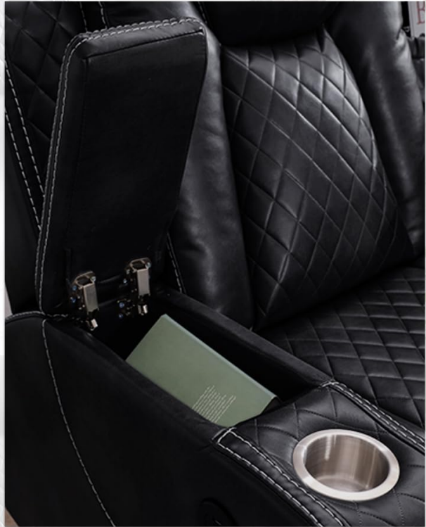
Image: A composite image displaying the open center console with cup holders and a hidden storage compartment within the armrest, designed for space-saving convenience.