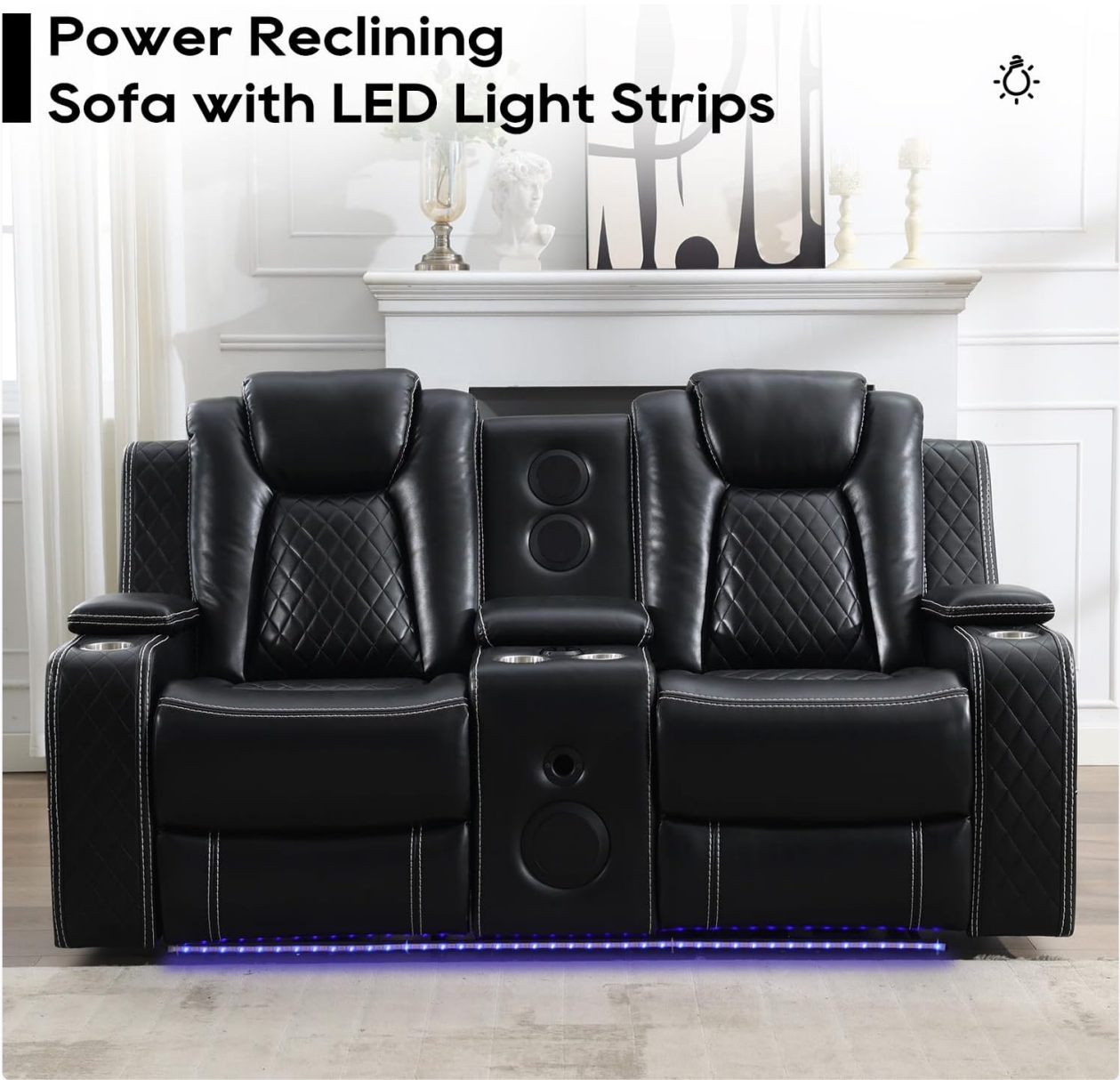
Image: The power reclining loveseat showcasing its integrated LED light strips along the base, providing ambient illumination.