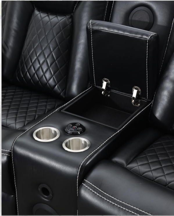
Storage Console with Cup Holders