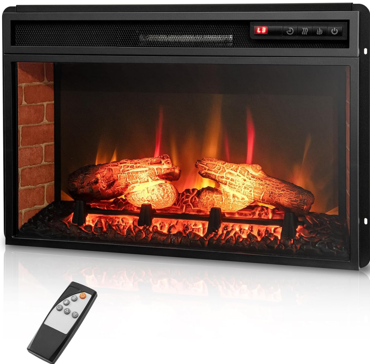
Image: The COSTWAY Electric Fireplace Insert with its remote control, showcasing the realistic flame effect and control panel.