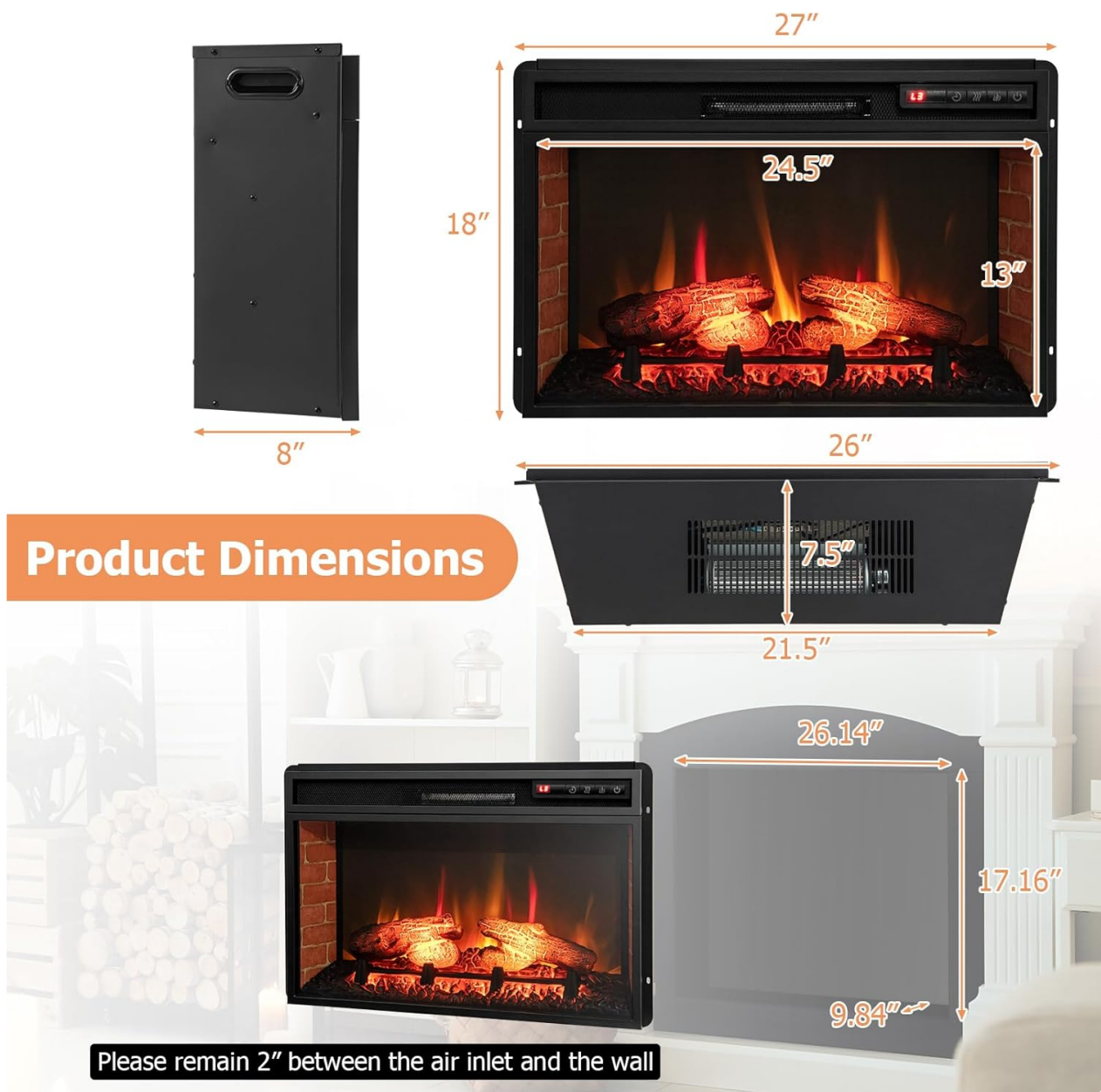
Image: Detailed diagram showing the product dimensions for installation planning.