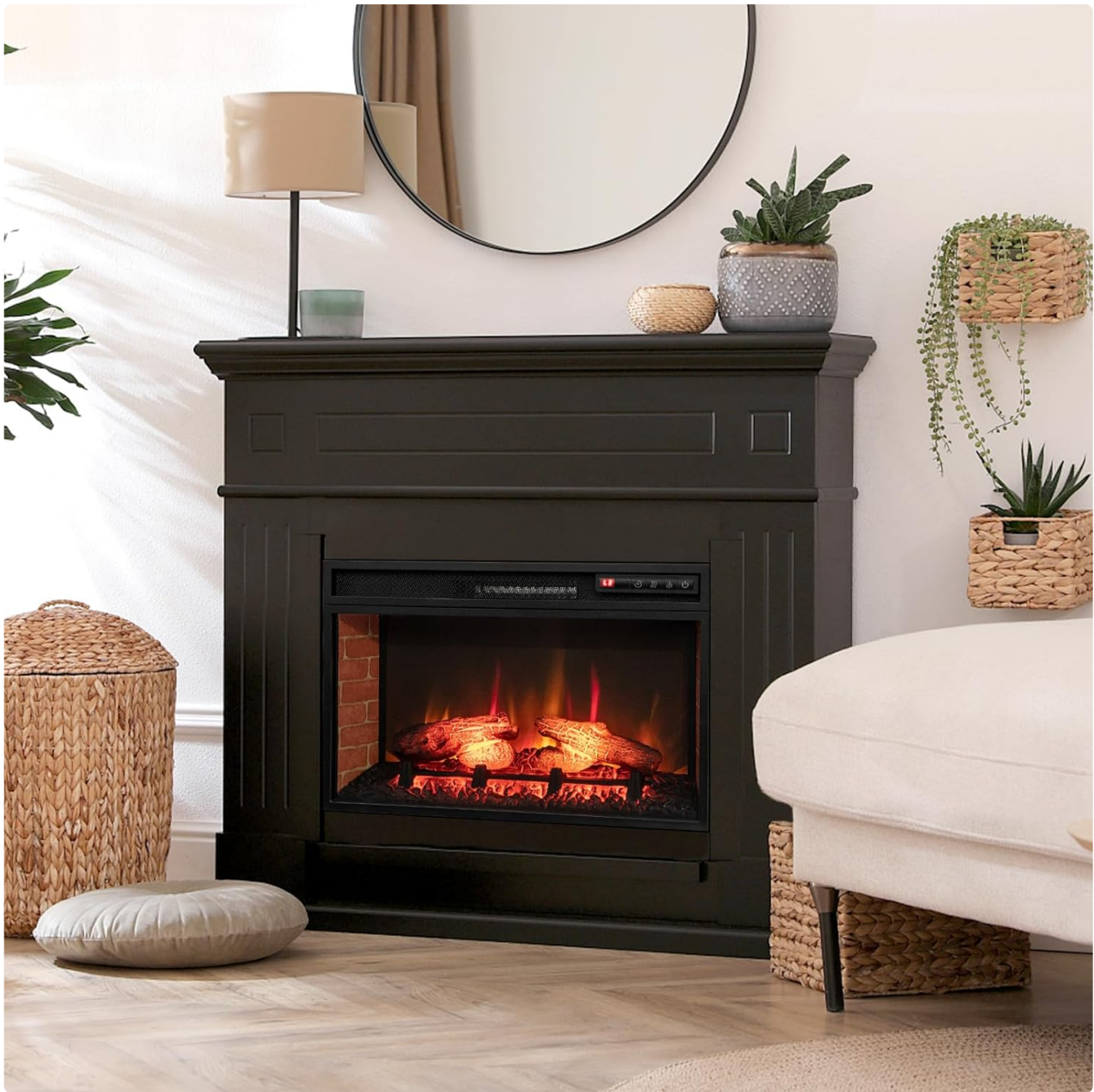
Image: The electric fireplace insert seamlessly integrated into a living room setting, demonstrating a recessed installation.