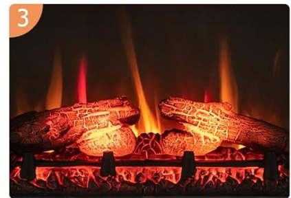
Image: Demonstration of the realistic 3D flame effect at its three adjustable brightness levels.