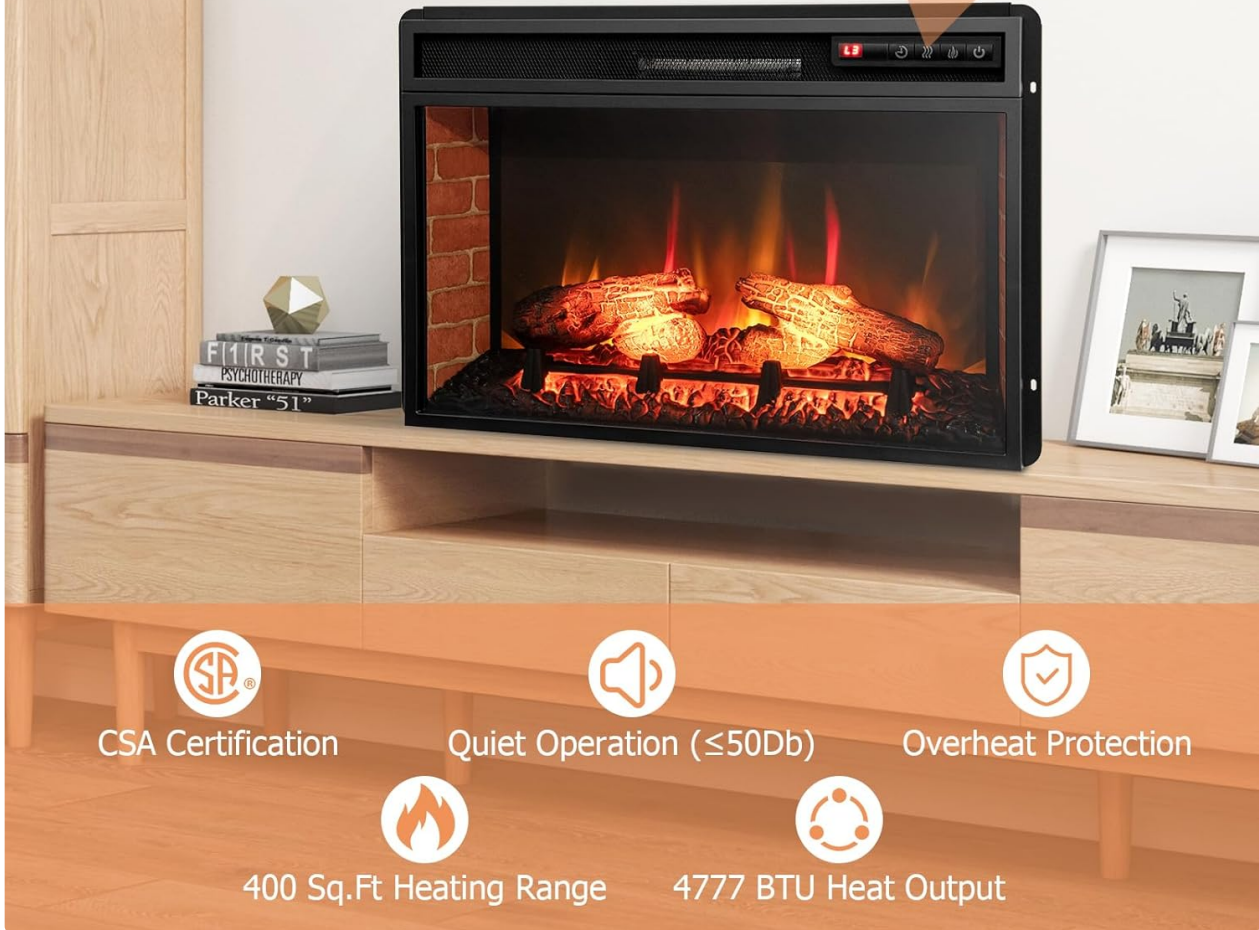
Image: Visual representation of the fireplace's safety and efficiency features, including CSA certification, quiet operation, overheat protection, heating area, and BTU output.