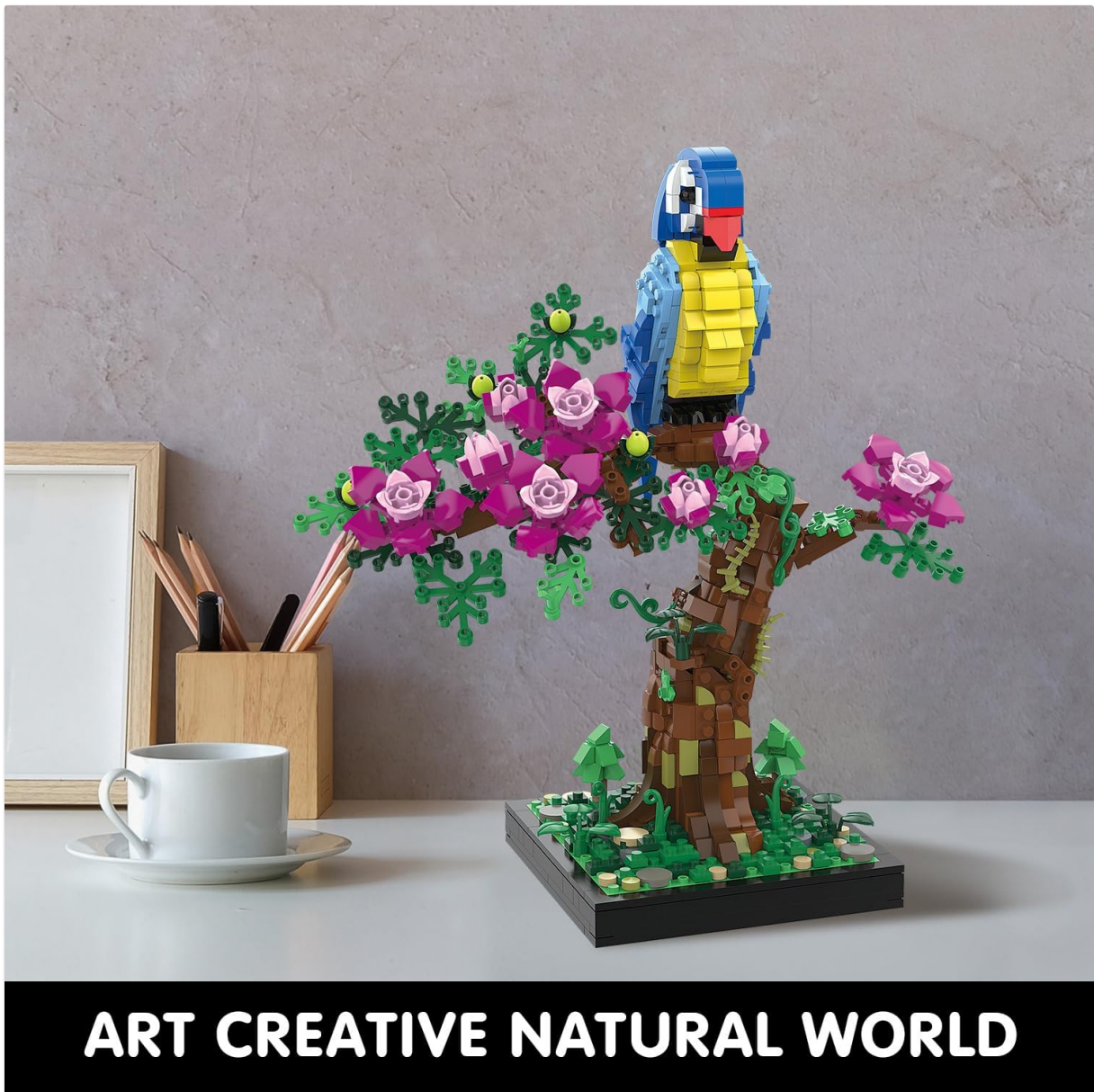
Image 6: The assembled Micro Brick Flower Parrot model displayed as a decorative item on an office desk.