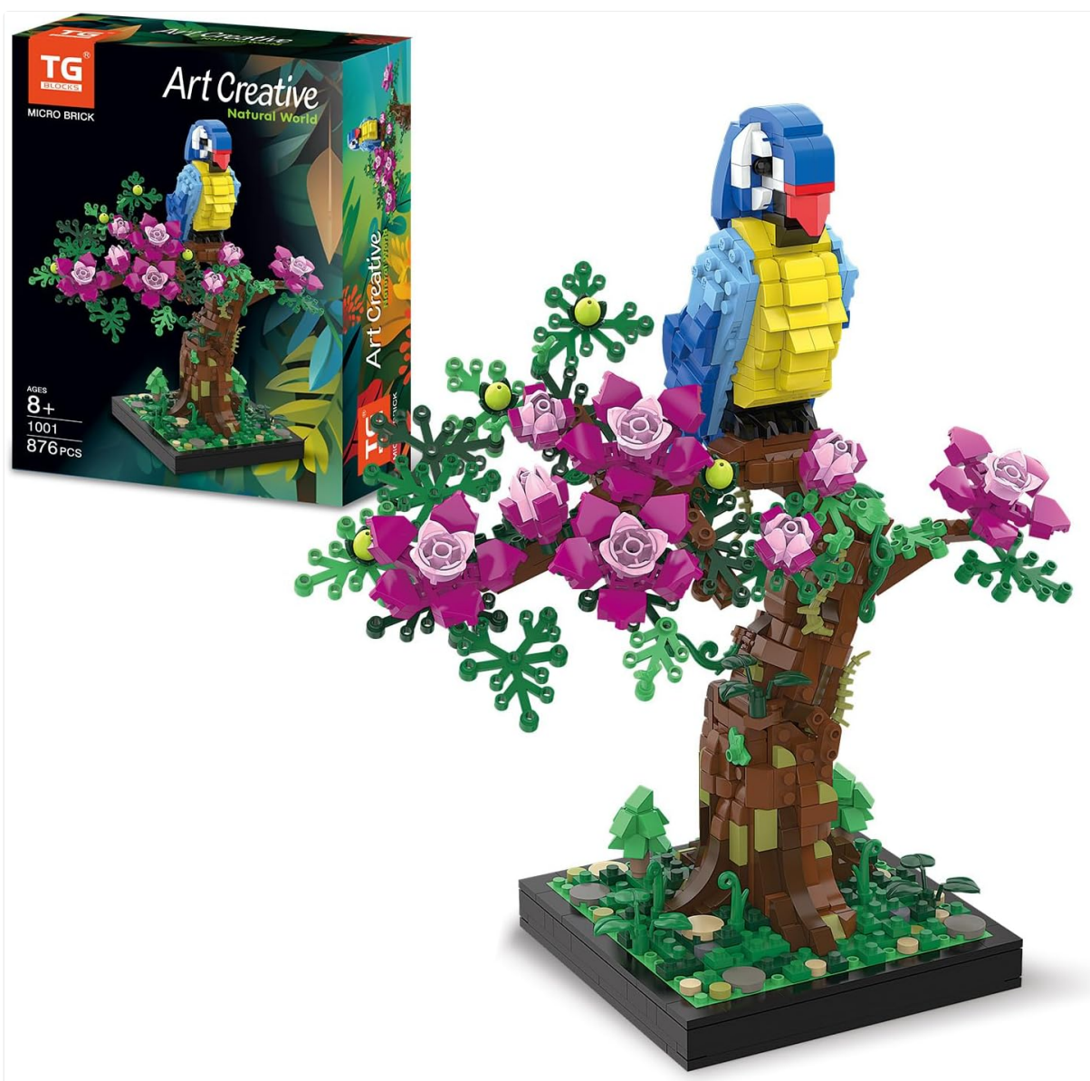
Image 1: Overview of the TG BLOCKS Micro Brick Flower Parrot Toy Building Set, showing the completed model and its packaging.