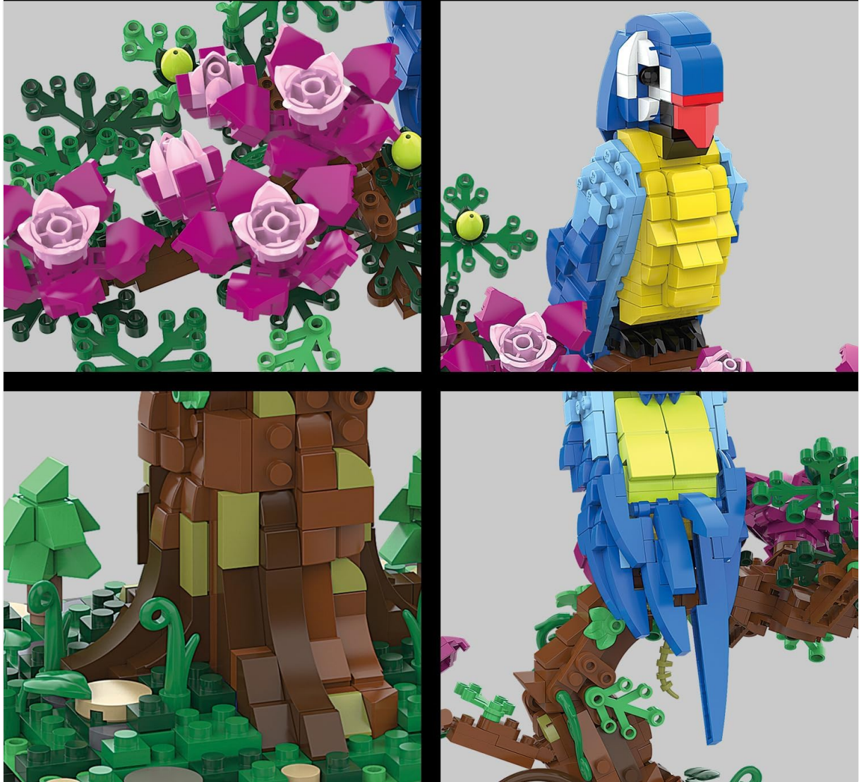
Image 5: A collage of four close-up images showcasing the detailed construction of the parrot's head, the flowers, the tree trunk, and the parrot's tail feathers.