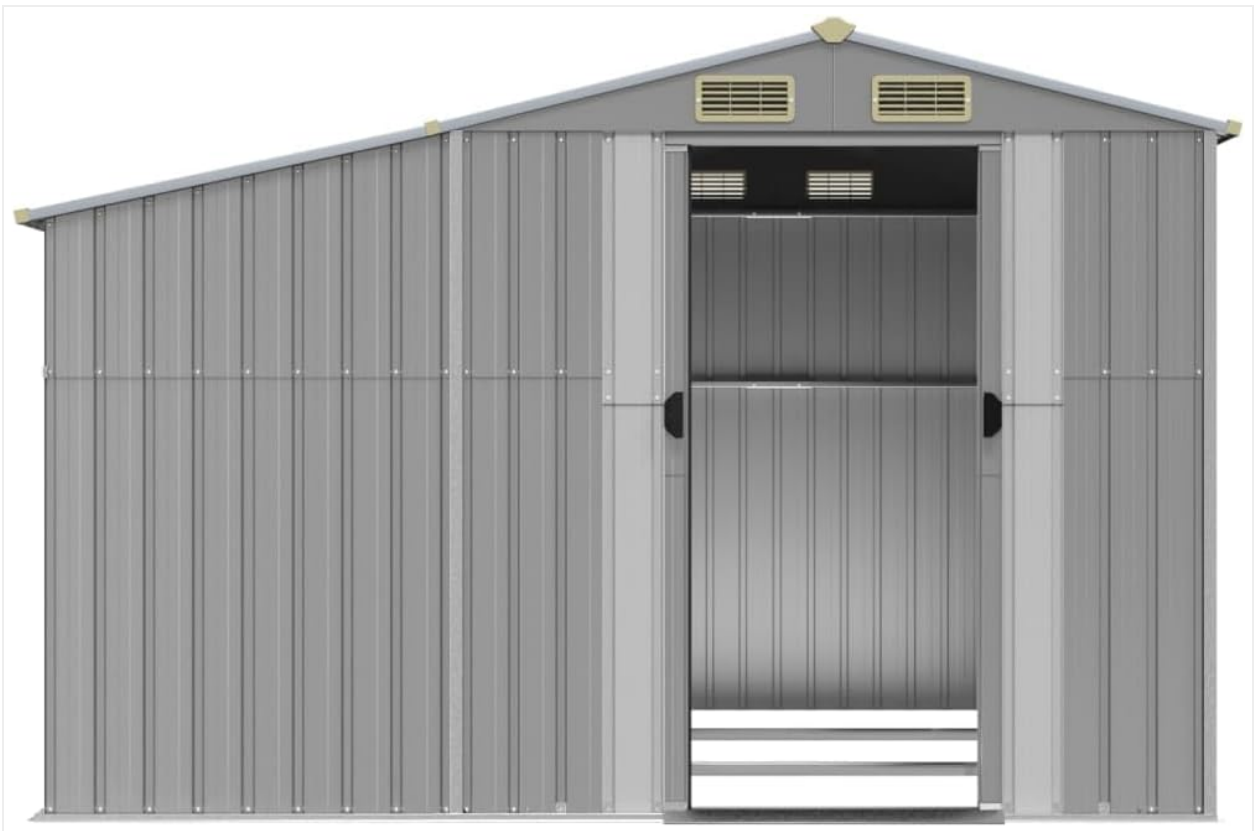
Image: Front view with door open.