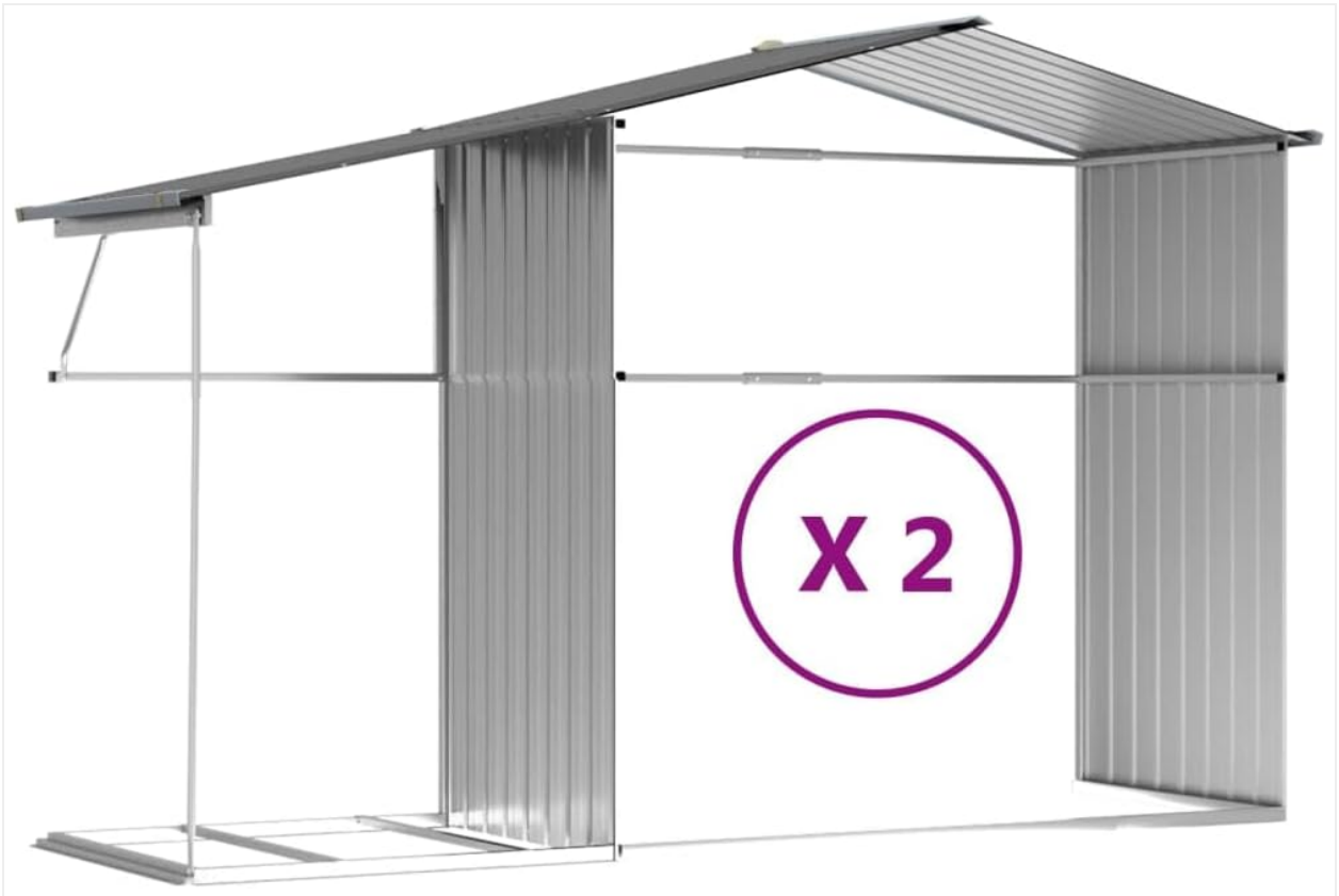
Image: Internal frame structure during assembly.