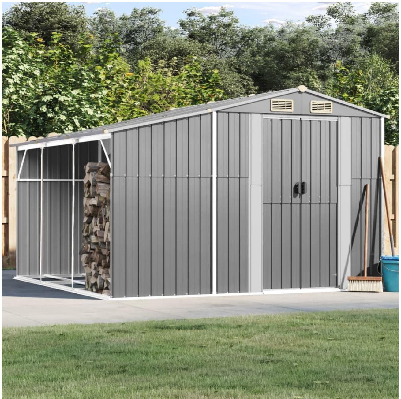
Image: Fully assembled LAPOOH Garden Shed.

Once assembled, the shed provides ample space, including a dedicated section for firewood storage if applicable to your model.