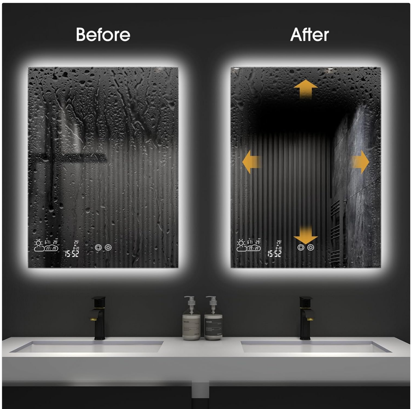
Image: A visual demonstration of the anti-fog function. The "Before" image shows a mirror covered in condensation, while the "After" image shows a perfectly clear reflection, indicating the effectiveness of the defogger.