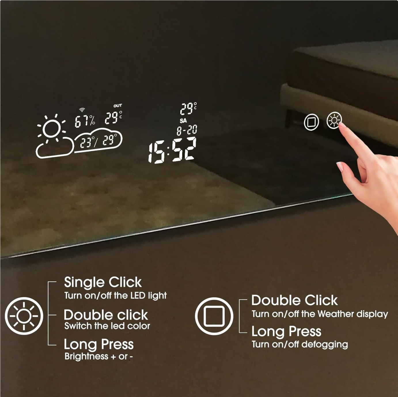
Image: Detailed guide to the mirror's touch controls. The left icon controls the LED light: single click to turn on/off, double click to switch LED color, long press for brightness adjustment. The right icon controls the weather display and defogging: double click to turn weather display on/off, long press to turn defogging on/off.