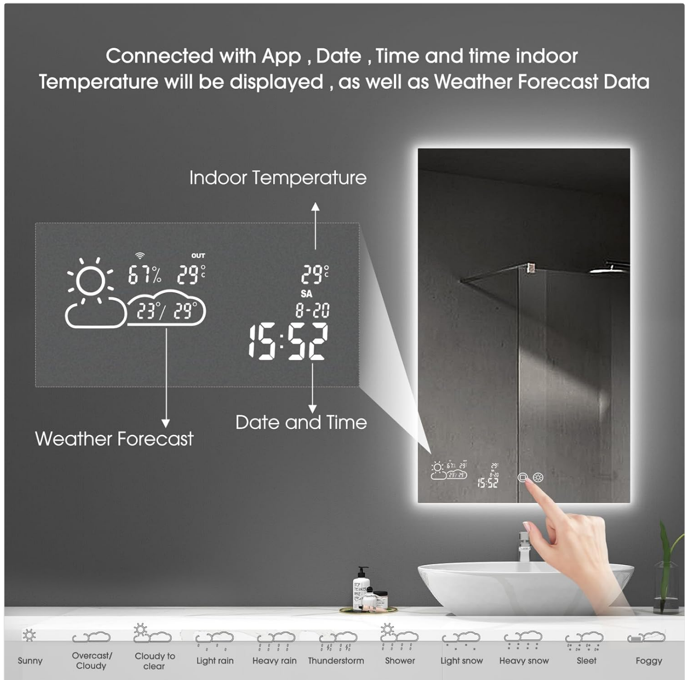
Image: The mirror's display showing weather forecast icons, current outdoor temperature, indoor temperature, date, and time. This data is synchronized via the WiseMirror App.