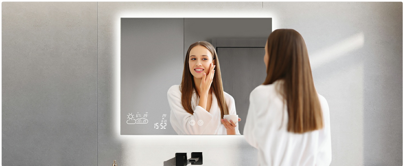
Image: A visual representation of the mirror's waterproof LED strips, demonstrating their IP54 rating and suitability for bathroom use.