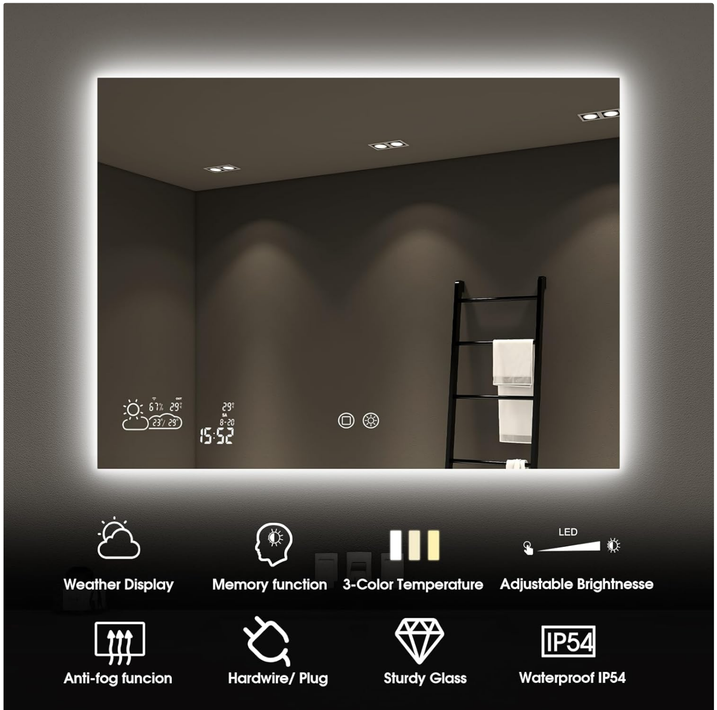
Image: Key features of the BYECOLD LED Bathroom Mirror, including weather display, memory function, three color temperatures, adjustable brightness, anti-fog, hardwire/plug options, sturdy glass, and IP54 waterproof rating.

The BYECOLD 48x24 LED Bathroom Mirror is an intelligent lighted vanity mirror designed to enhance your bathroom experience. It features integrated LED lighting with adjustable brightness and color temperature, a smart WiFi weather display, and an anti-fog function for clear visibility. This mirror is designed for horizontal wall mounting.