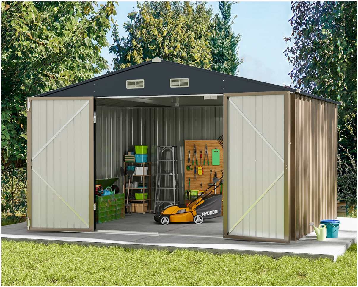
This image shows the Greesum Metal Outdoor Storage Shed with its double doors open, revealing the spacious interior. A silhouette of a person stands inside, providing a sense of scale for the 10FT x 8FT dimensions.