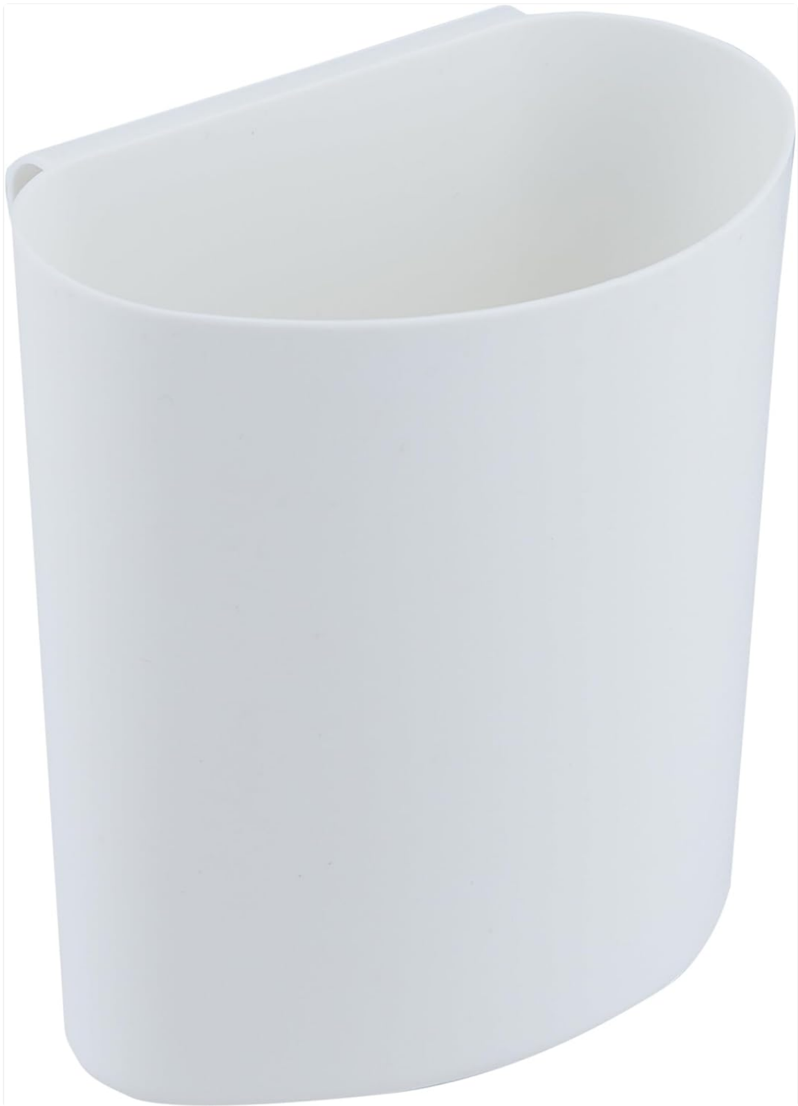
Image: A single white storage cup, designed to hang on the trolley's shelves.