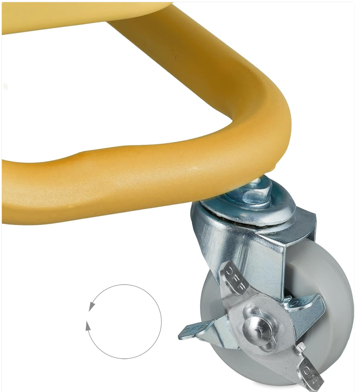
Image: Close-up of a trolley wheel, showing the brake mechanism. Ensure wheels are securely attached and brakes are functional.