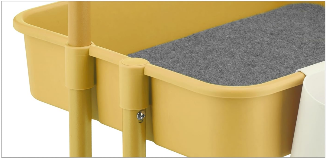
Image: Side view of a trolley shelf demonstrating the attachment of white hooks and a storage cup.