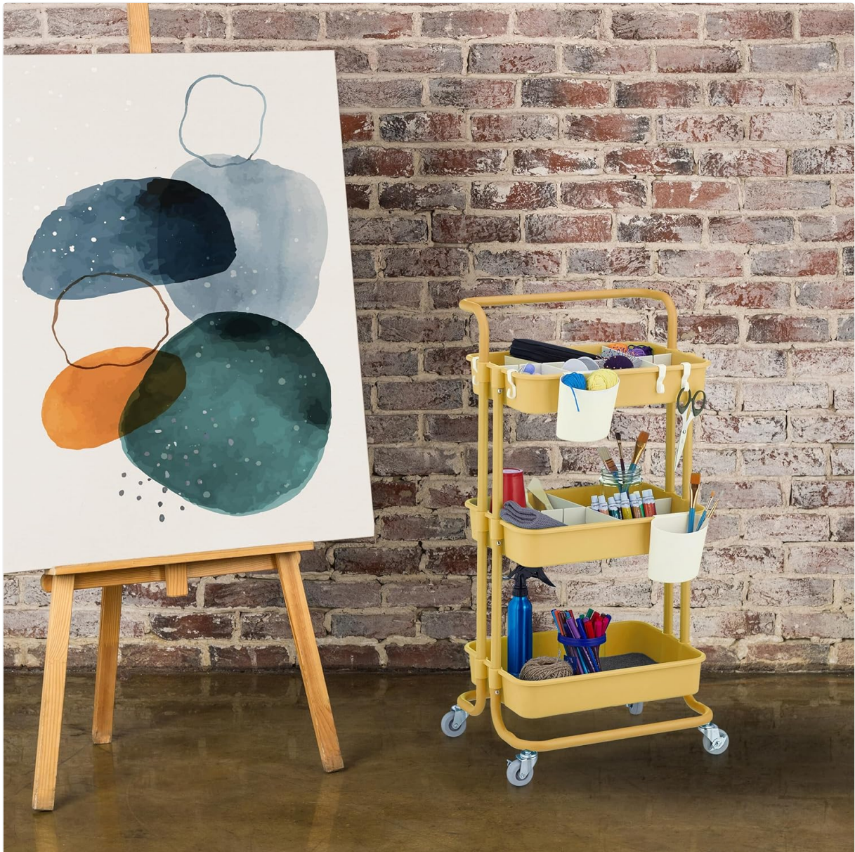
Image: The rolling trolley configured as a craft cart, holding art supplies and tools.