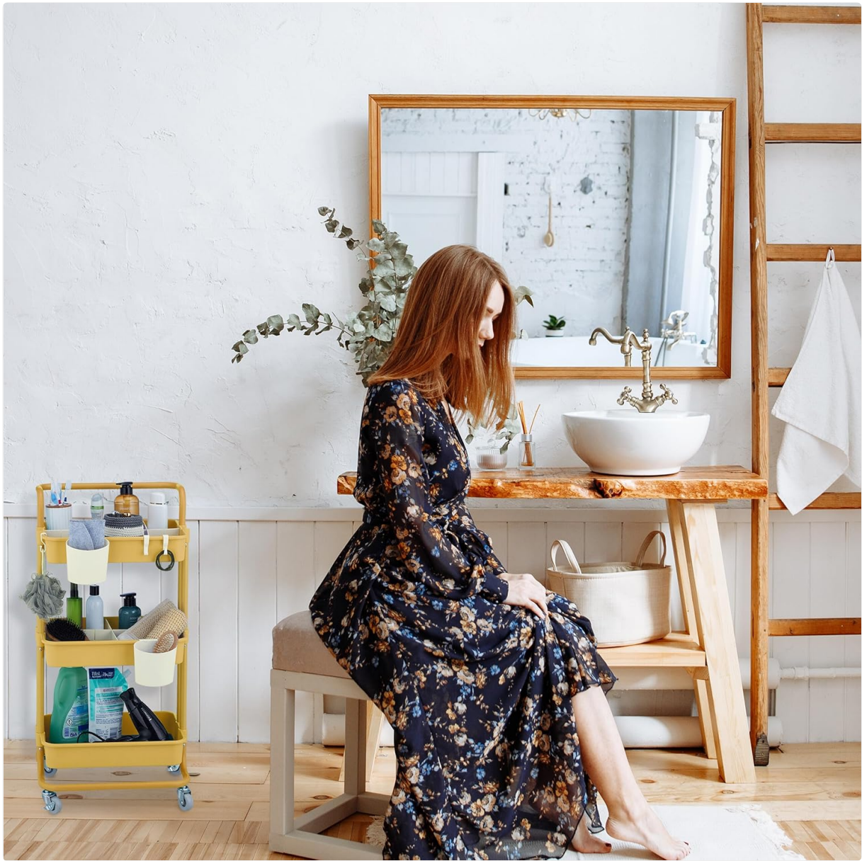
Image: The rolling trolley serving as a bathroom storage unit, holding toiletries and towels.