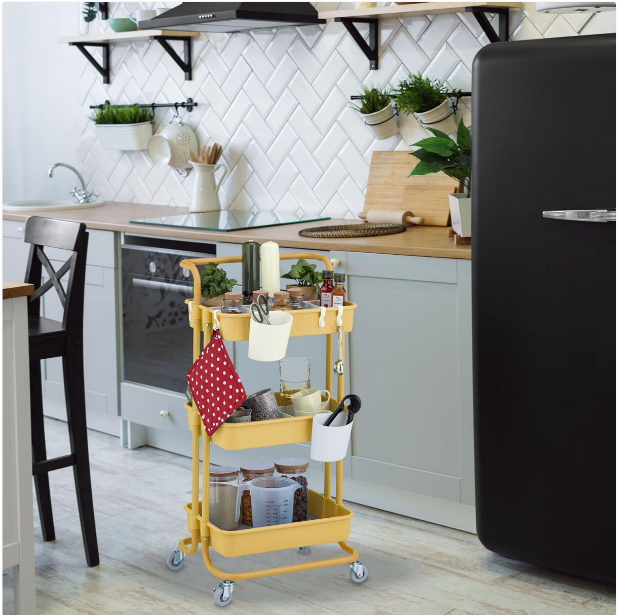
Image: The rolling trolley functioning as a kitchen cart, storing spices and utensils.