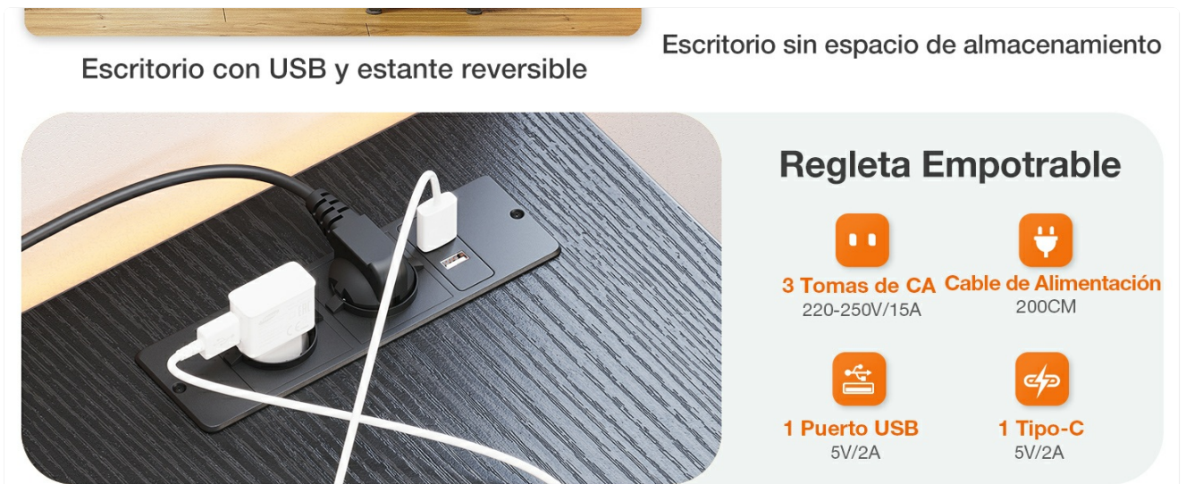
The integrated power strip in use, charging devices.