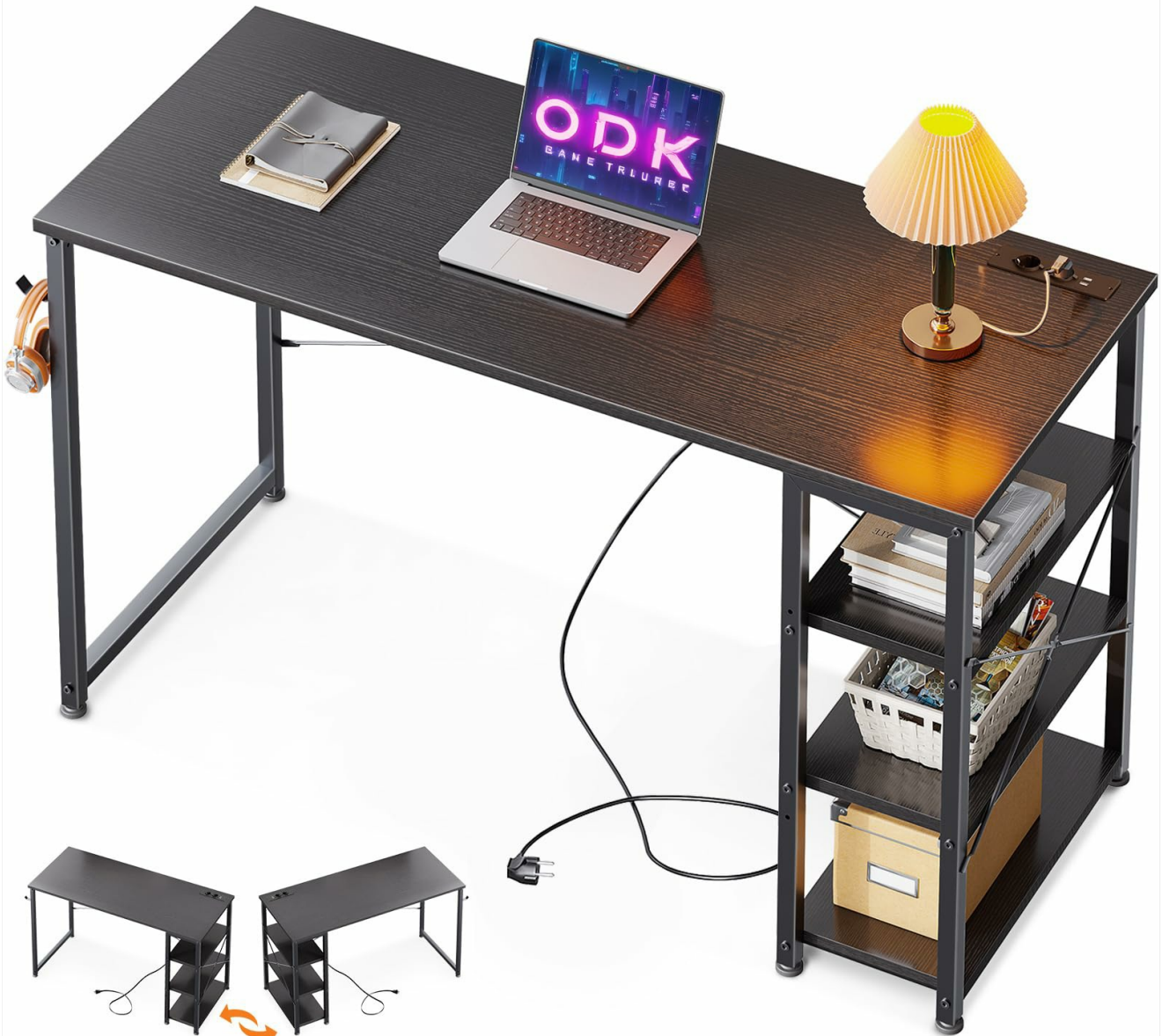
The ODK Small Desk in a typical home office setup.