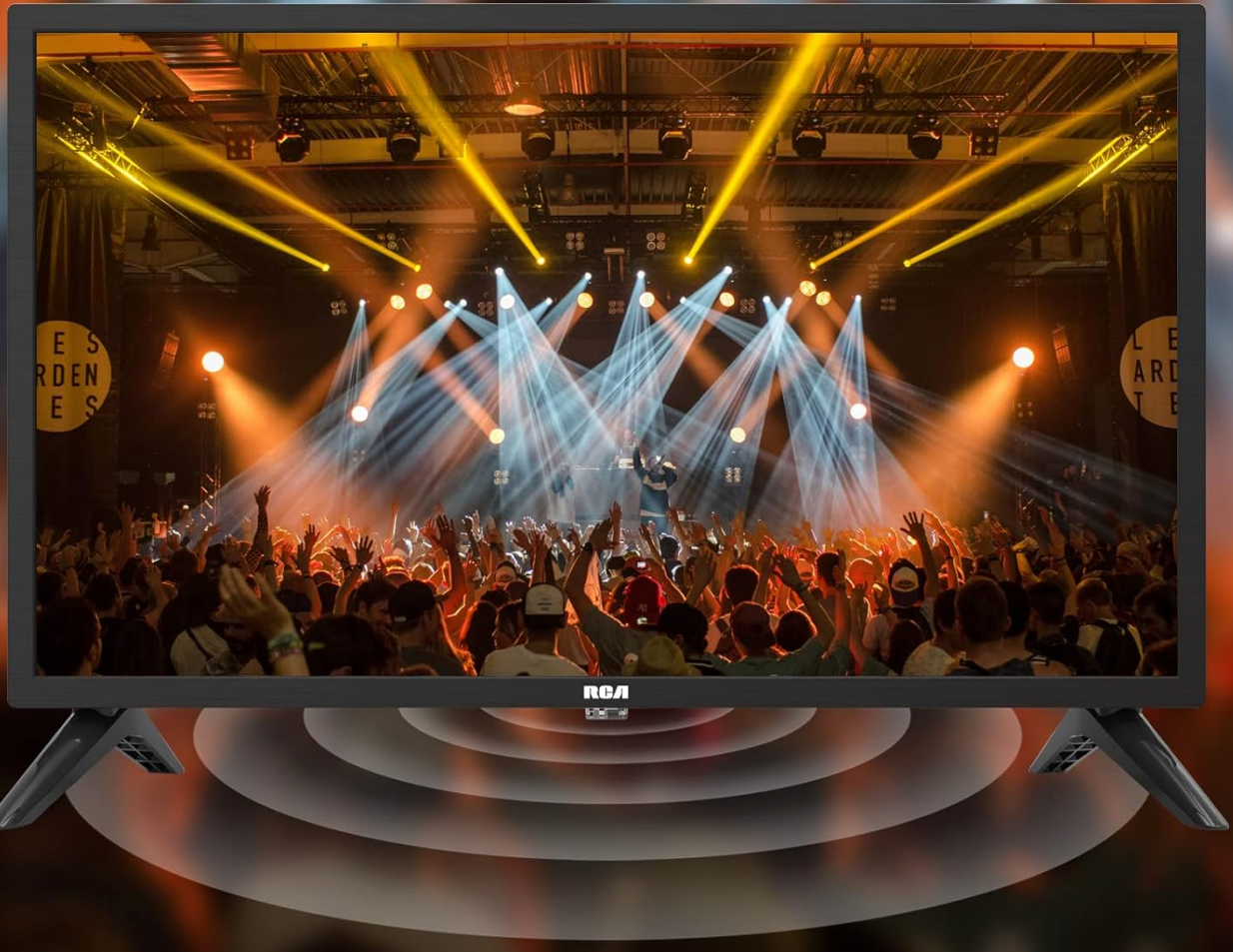
Image 5.4: An image illustrating the immersive audio experience provided by Dolby Audio-Dolby Digital, simulating cinema-level surround sound.

Surround sound brings cinema-level sound effects, creating an auditory feast, allowing you to taste the rhythm of each syllable, giving you an immersive experience.