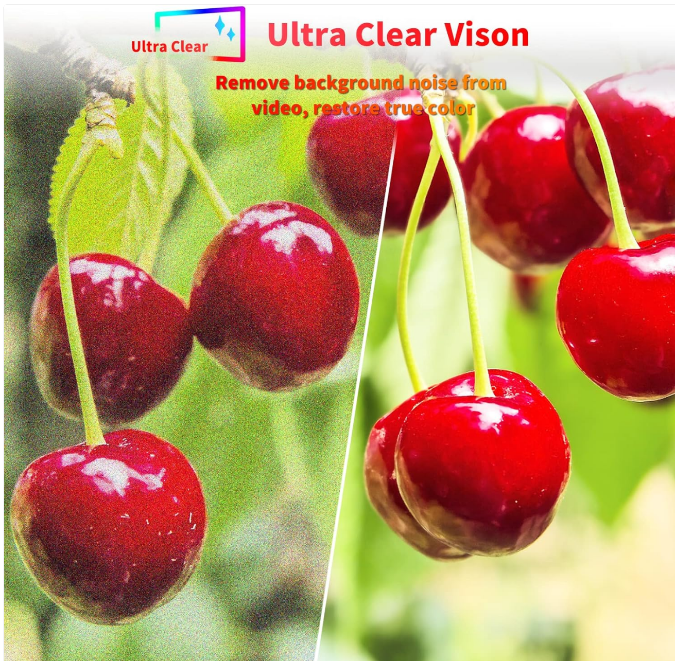
Image 5.2: An illustration of the 'Ultra Clear Vision' feature, which enhances picture clarity by reducing background noise and restoring true colors.

Access the TV's menu to adjust picture and audio settings. This includes brightness, contrast, color, and various sound modes.