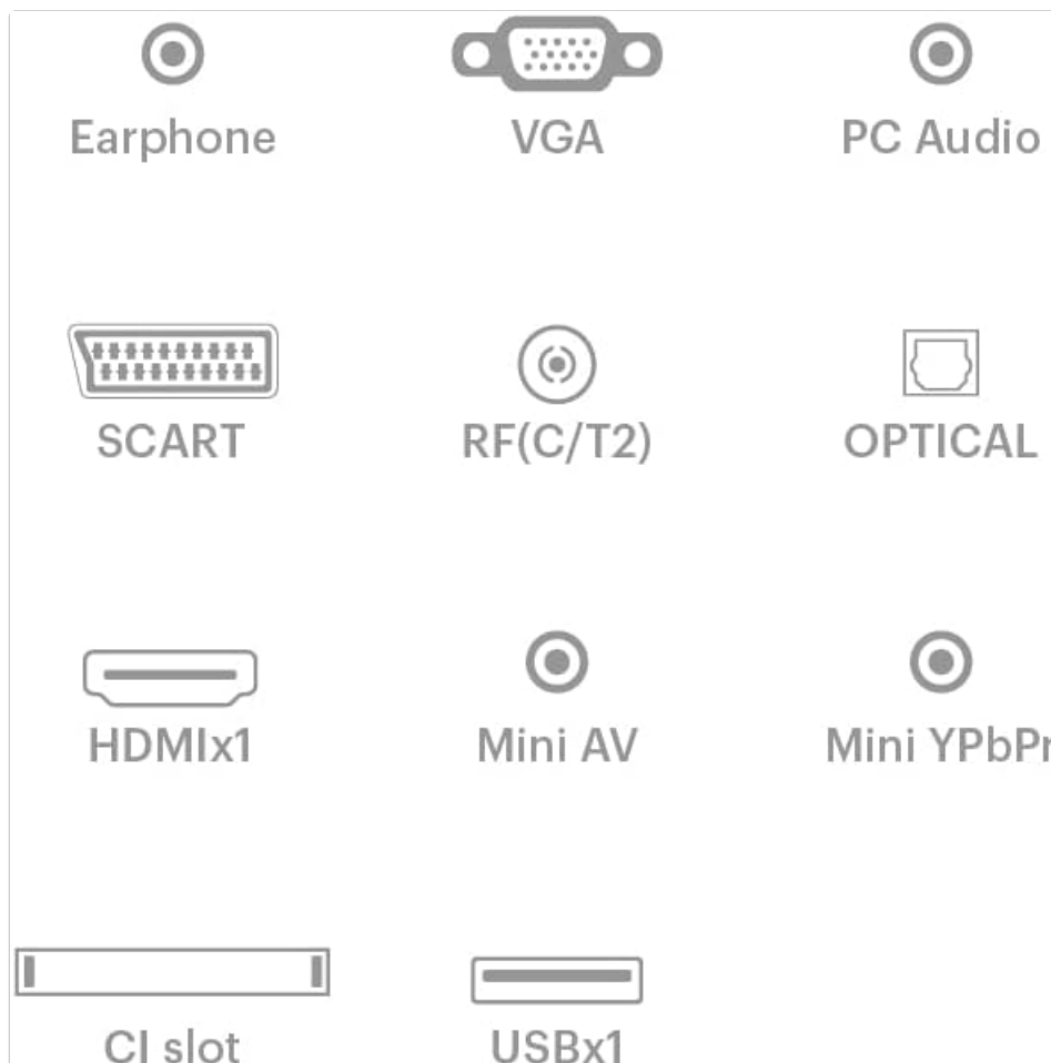
Image 4.3: A detailed diagram illustrating the various input and output ports available on the RCA D24F1D TV, including HDMI, USB, VGA, SCART, and audio connections.