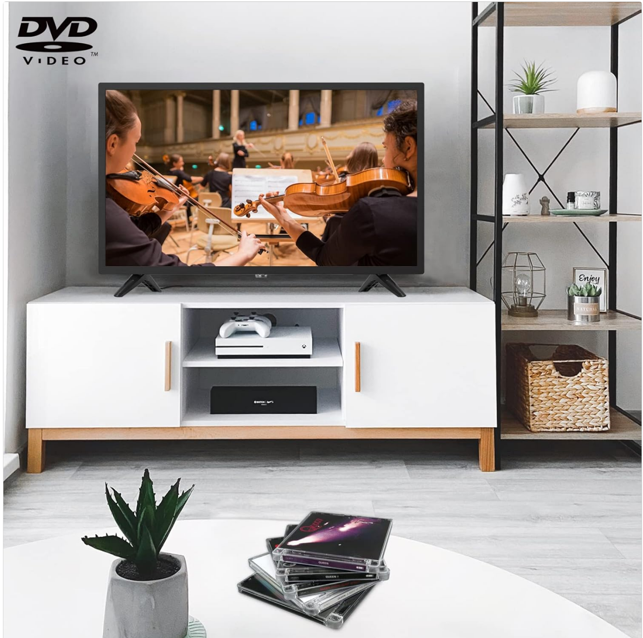
Image 5.1: The RCA D24F1D TV displaying content from its built-in DVD player, positioned in a home entertainment setup.