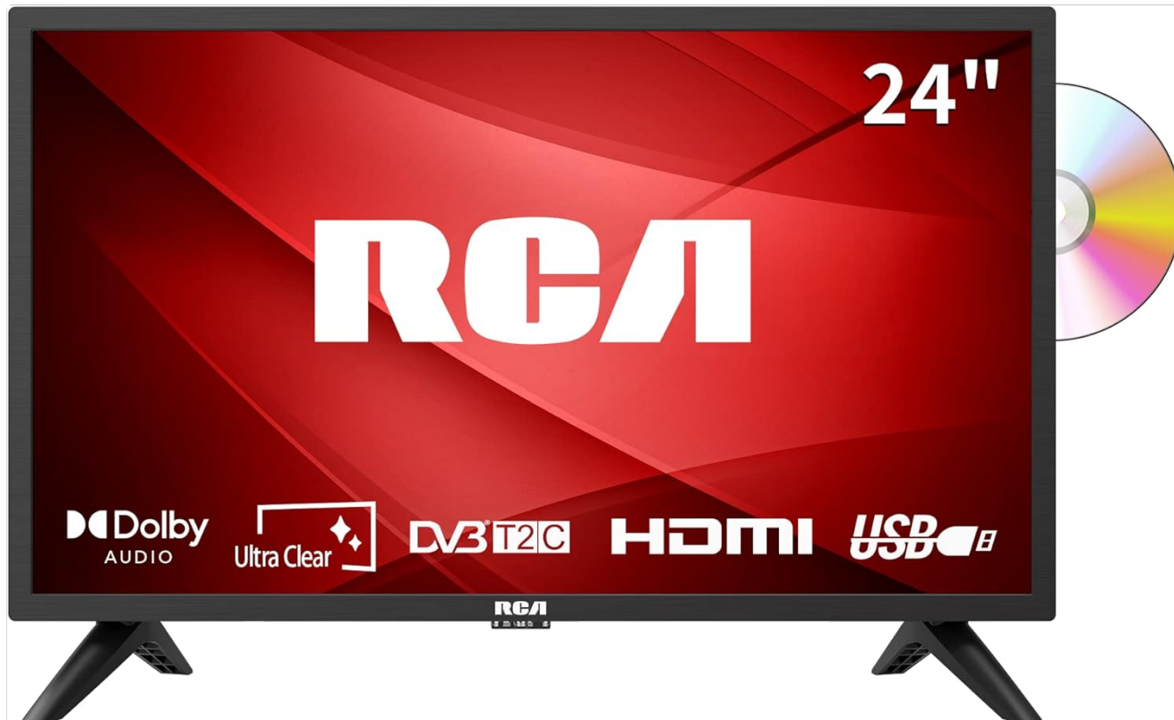
Image 1.1: Front view of the RCA D24F1D 24-inch LED TV, showcasing its compact design and integrated DVD player functionality.

This user manual provides essential information for the safe and efficient operation of your RCA D24F1D 24-inch LED Television with a built-in DVD player. Please read this manual thoroughly before using the product and retain it for future reference. This television combines a compact design with features like Freeview HD, Dolby Digital Audio, and multiple connectivity options, making it suitable for various small spaces.