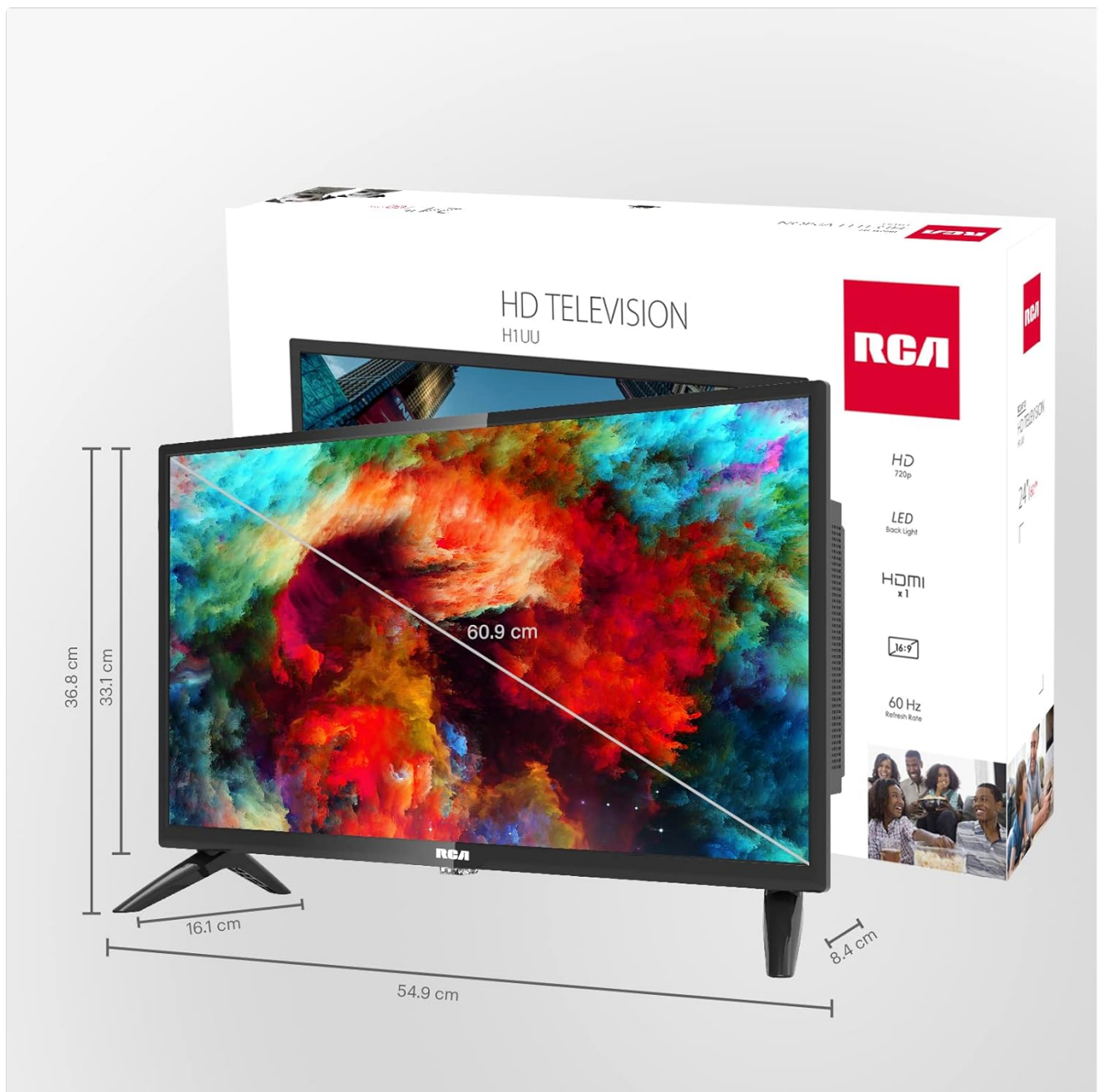
Image 8.1: A diagram illustrating the physical dimensions of the RCA D24F1D TV, including width, height, and depth, for accurate placement and installation planning.