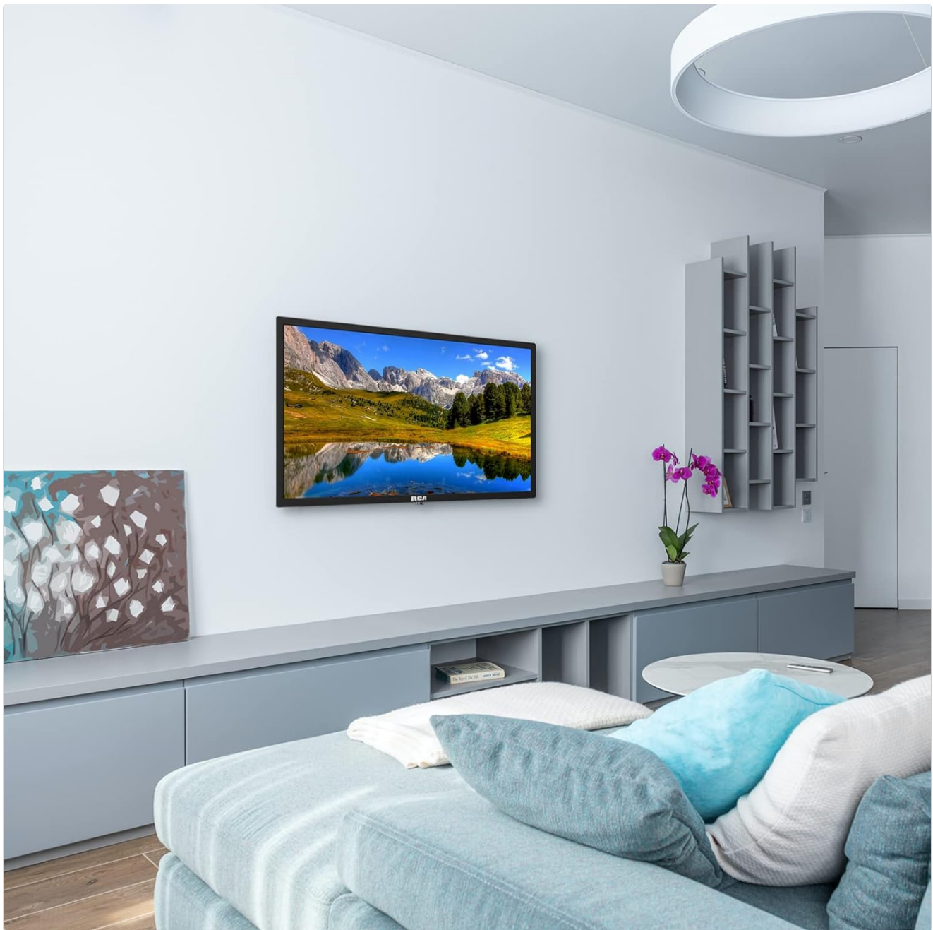
Image 4.2: The RCA D24F1D TV seamlessly integrated into a living room environment, showcasing its suitability for wall mounting.