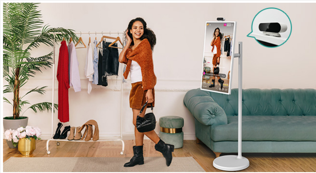
Figure 6: The external camera enables video calls and live streaming capabilities.