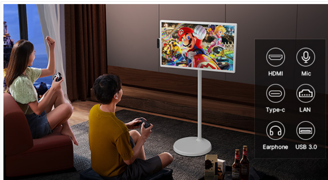
Figure 5: The device supports connecting gaming consoles for an immersive gaming experience.