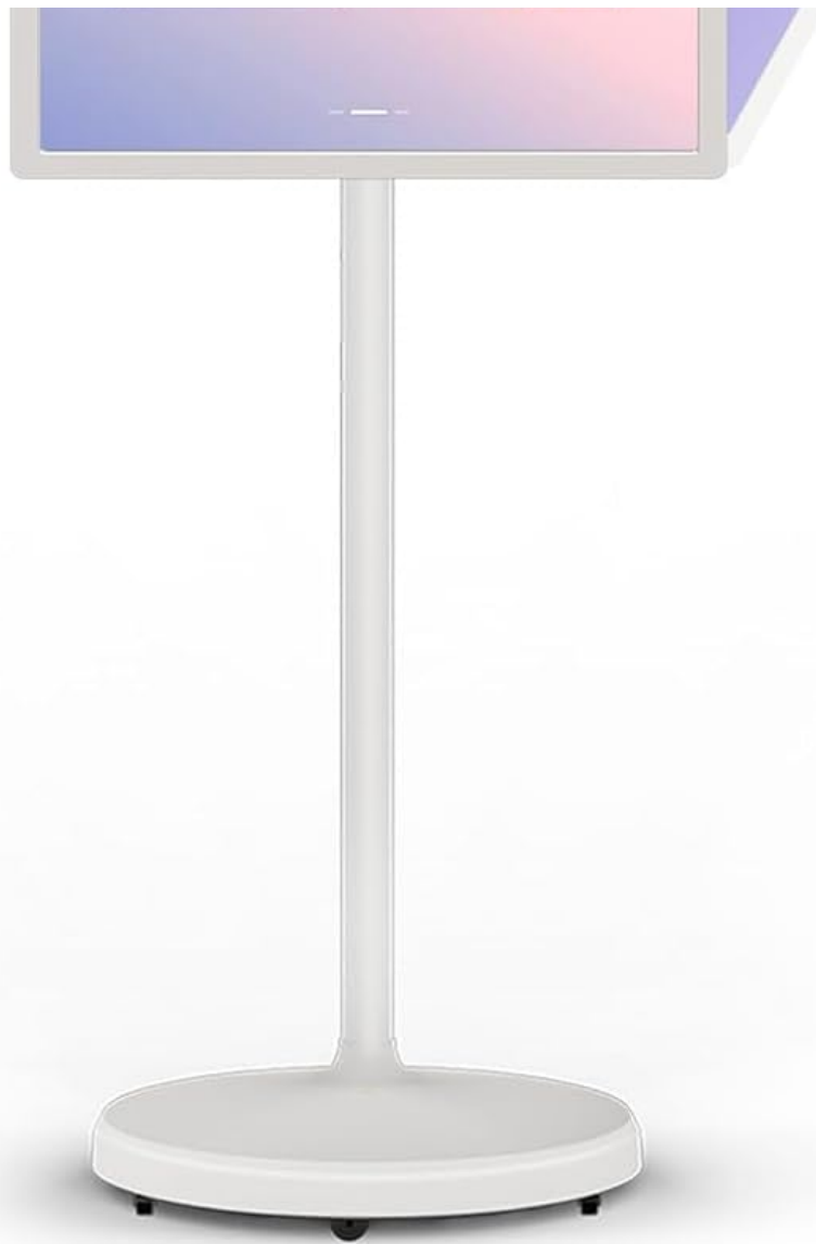
Figure 1: ApoloSign 32-inch Portable Smart TV in vertical orientation.