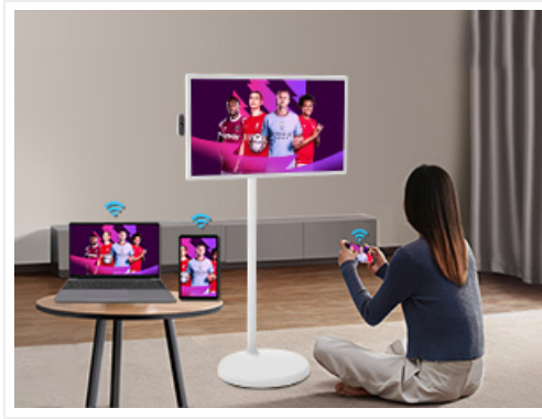
Figure 4: Demonstrates screen casting from various devices to the ApoloSign Smart TV.