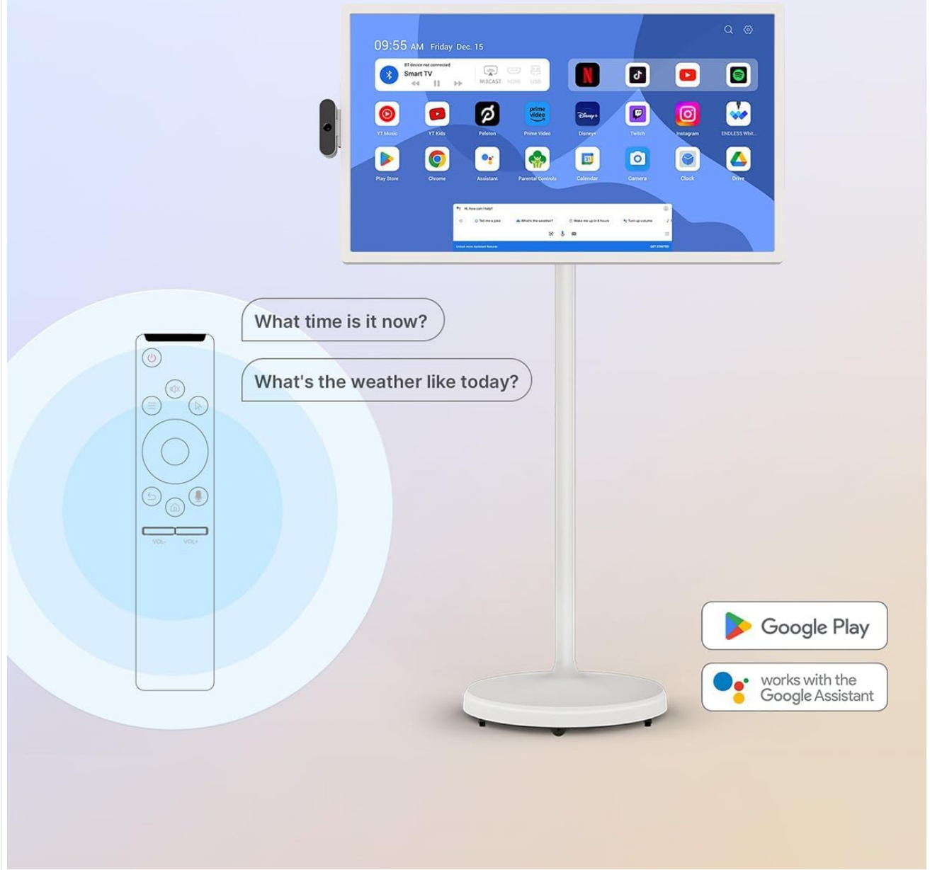
Figure 3: The Android OS interface showing various applications and Google Play Store access.

Equipped with a highly customized Android OS, supporting app downloads and voice control.