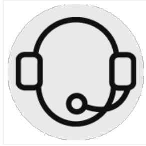
Figure 7: Customer Support details.