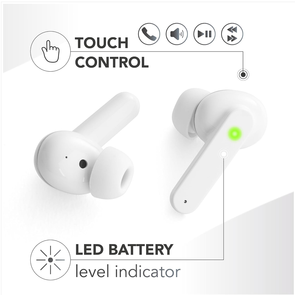
Image 3.2: Music Sound Fancy Earphones showing touch control areas and LED battery level indicator. The image points out the touch-sensitive surface for controls and the small LED light indicating battery status.