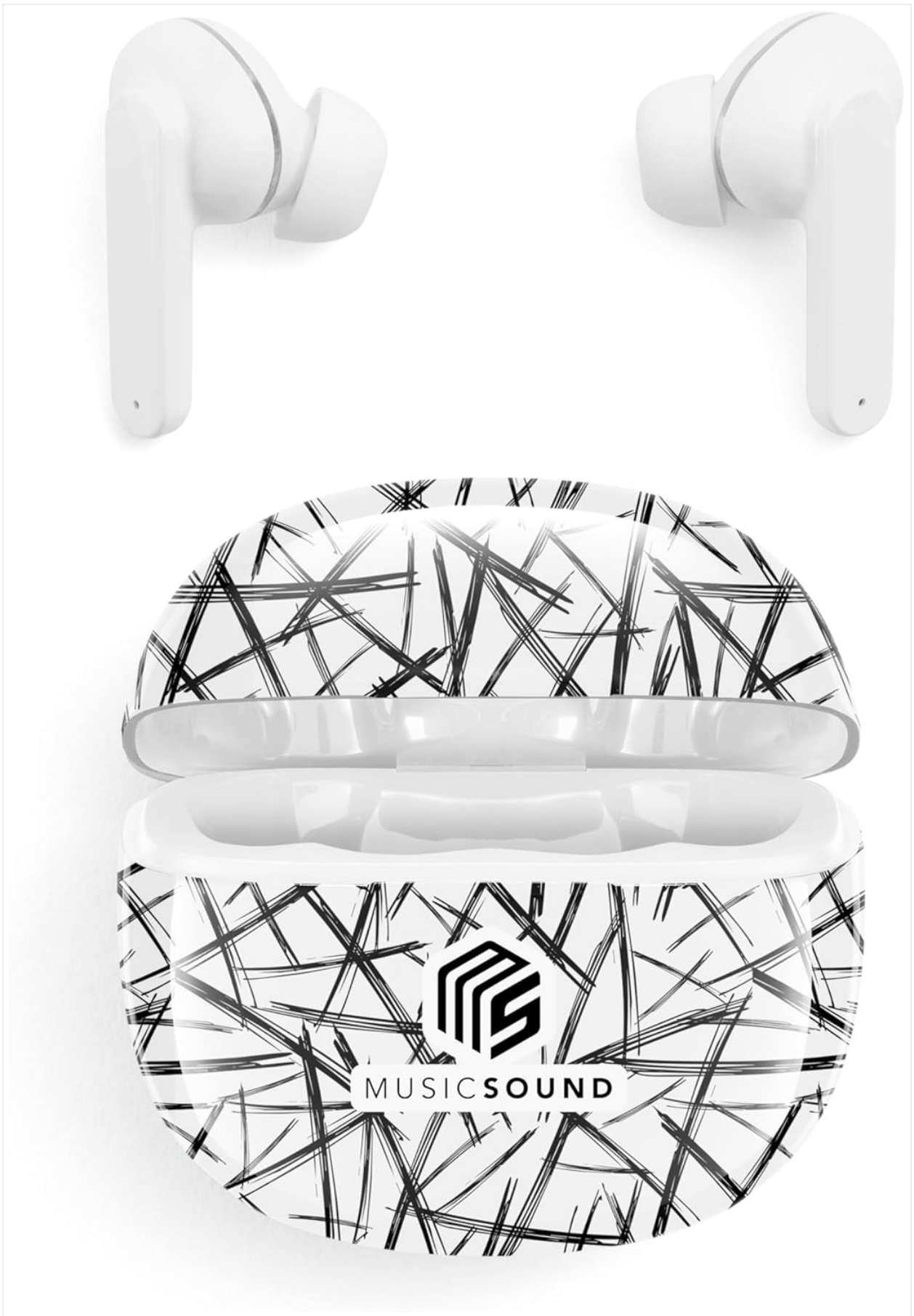
Image 1.1: Music Sound Fancy Wireless Earphones and Charging Case. The image displays the white in-ear earphones alongside their matching charging case, which features a distinctive black and white pattern.