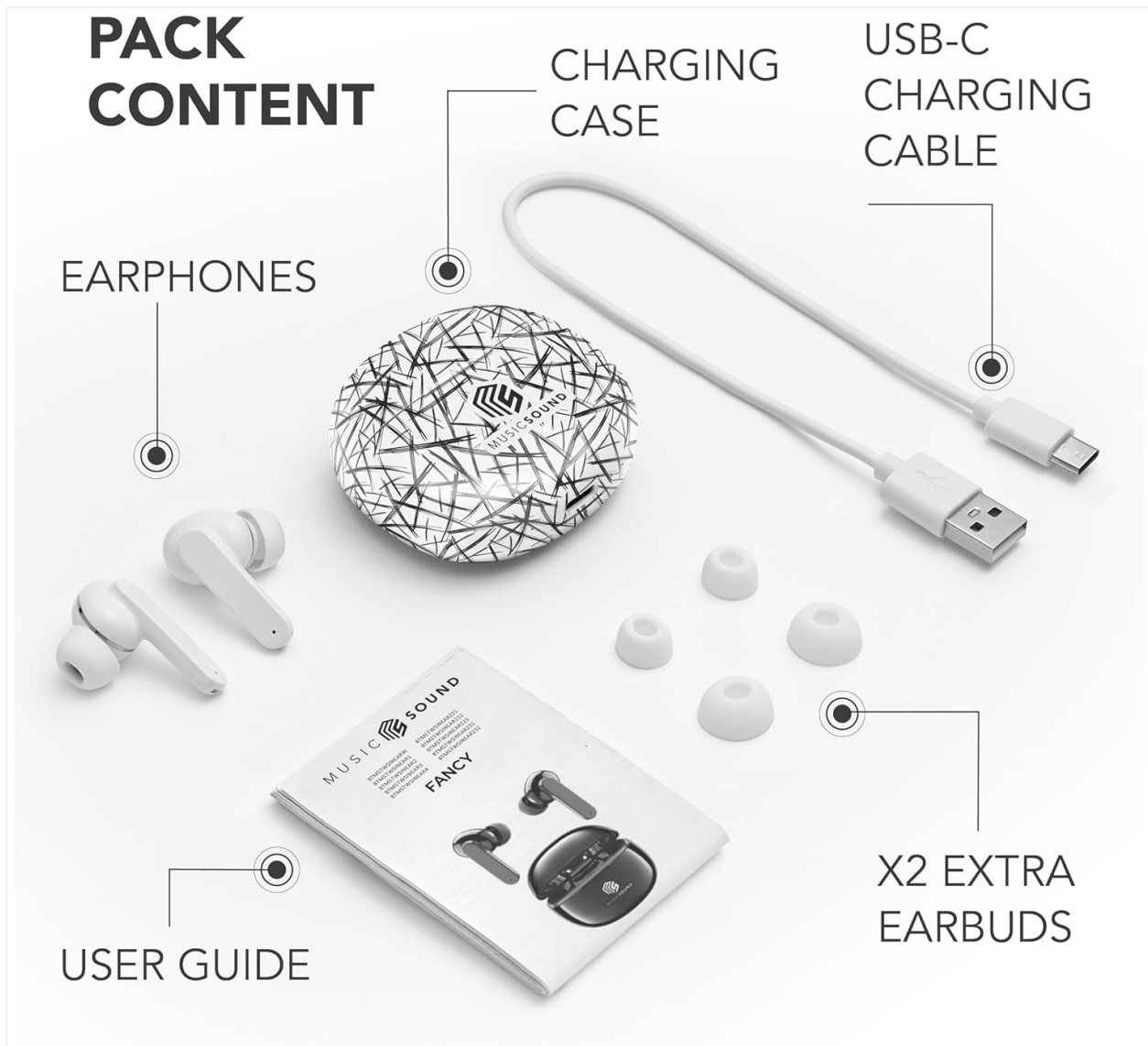
Image 2.1: Contents of the Music Sound Fancy Earphones package. This image clearly labels the earphones, charging case, USB-C charging cable, user guide, and two additional pairs of earbud tips.