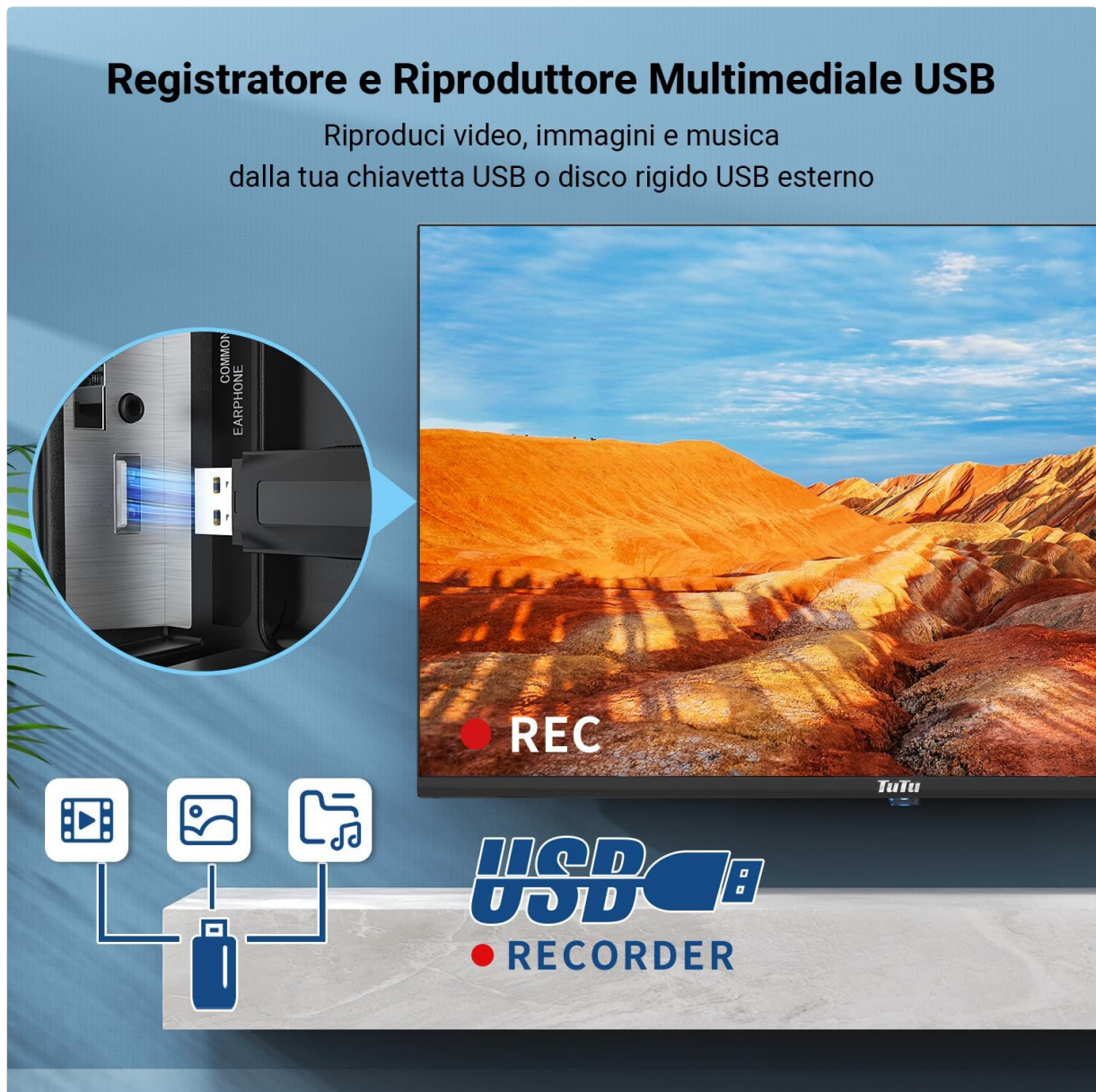
Image demonstrating the USB media player and recorder function, allowing playback of video, images, and music from a USB drive or external hard disk. The 'REC' indicator shows recording capability.

Insert a USB storage device into the USB port. The TV's media player will allow you to browse and play video, image, and music files. The TV also supports recording digital broadcasts to a connected USB device.