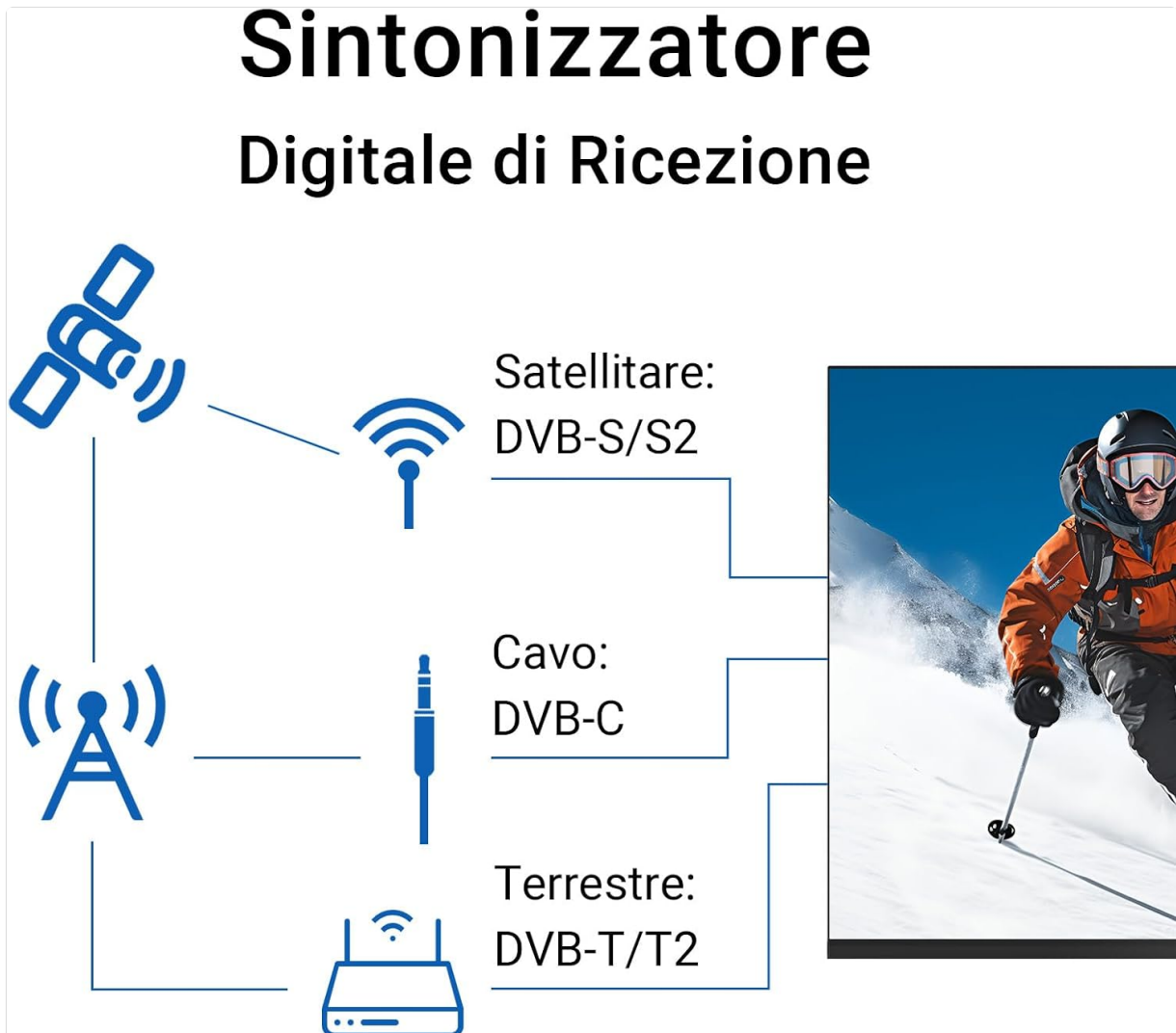
Illustration of the TV's triple tuner capabilities, showing connections for DVB-S/S2 (satellite), DVB-C (cable), and DVB-T/T2 (terrestrial) reception.

Connect your antenna, satellite dish, or cable to the appropriate RF or LNB IN port. Use HDMI cables for high-definition devices. Insert USB drives into the USB port for media access.