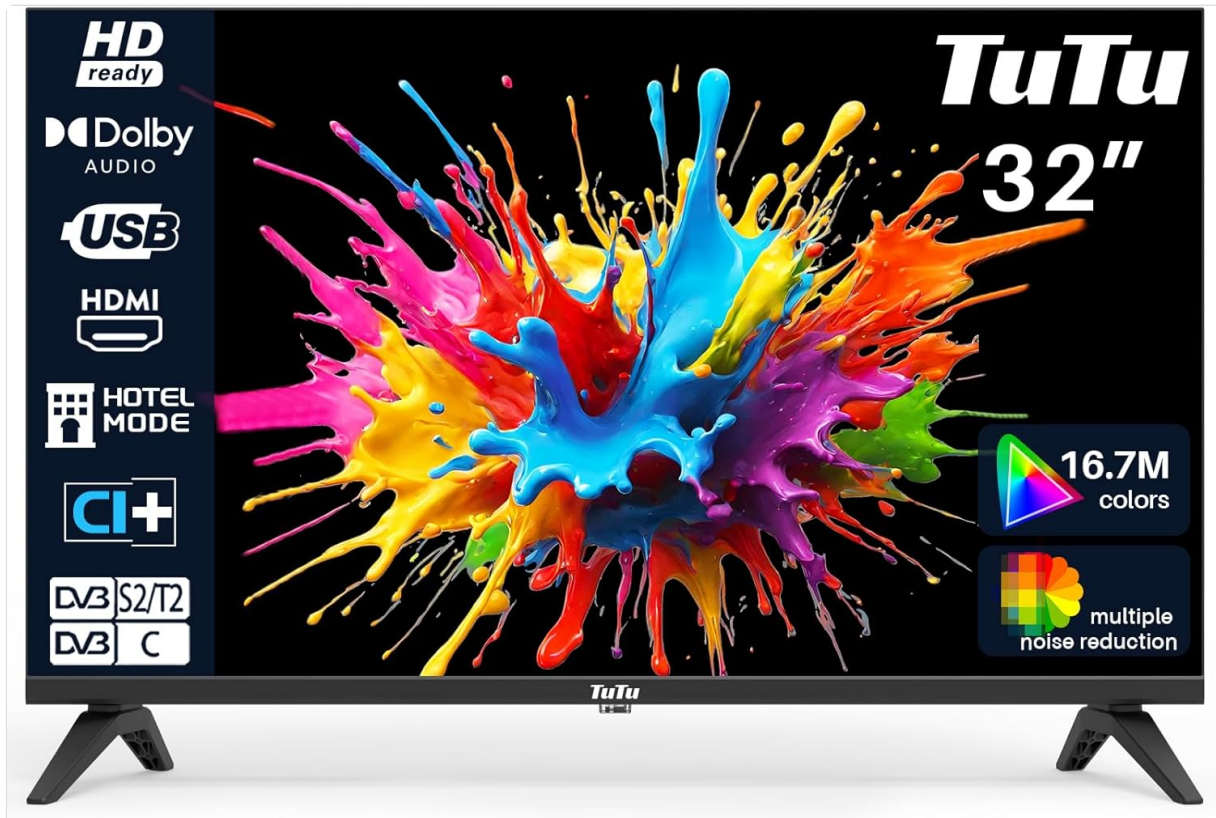
Front view of the TuTu TUB32HN1N 32-inch HD Ready TV, highlighting its borderless design and key features like HD Ready, Dolby Audio, USB, HDMI, Hotel Mode, CI+, and DVB-S2/T2/C tuners.

This manual provides essential information for the safe and efficient operation of your TuTu TUB32HN1N 32-inch HD Ready TV. Please read it thoroughly before using the television and retain it for future reference.