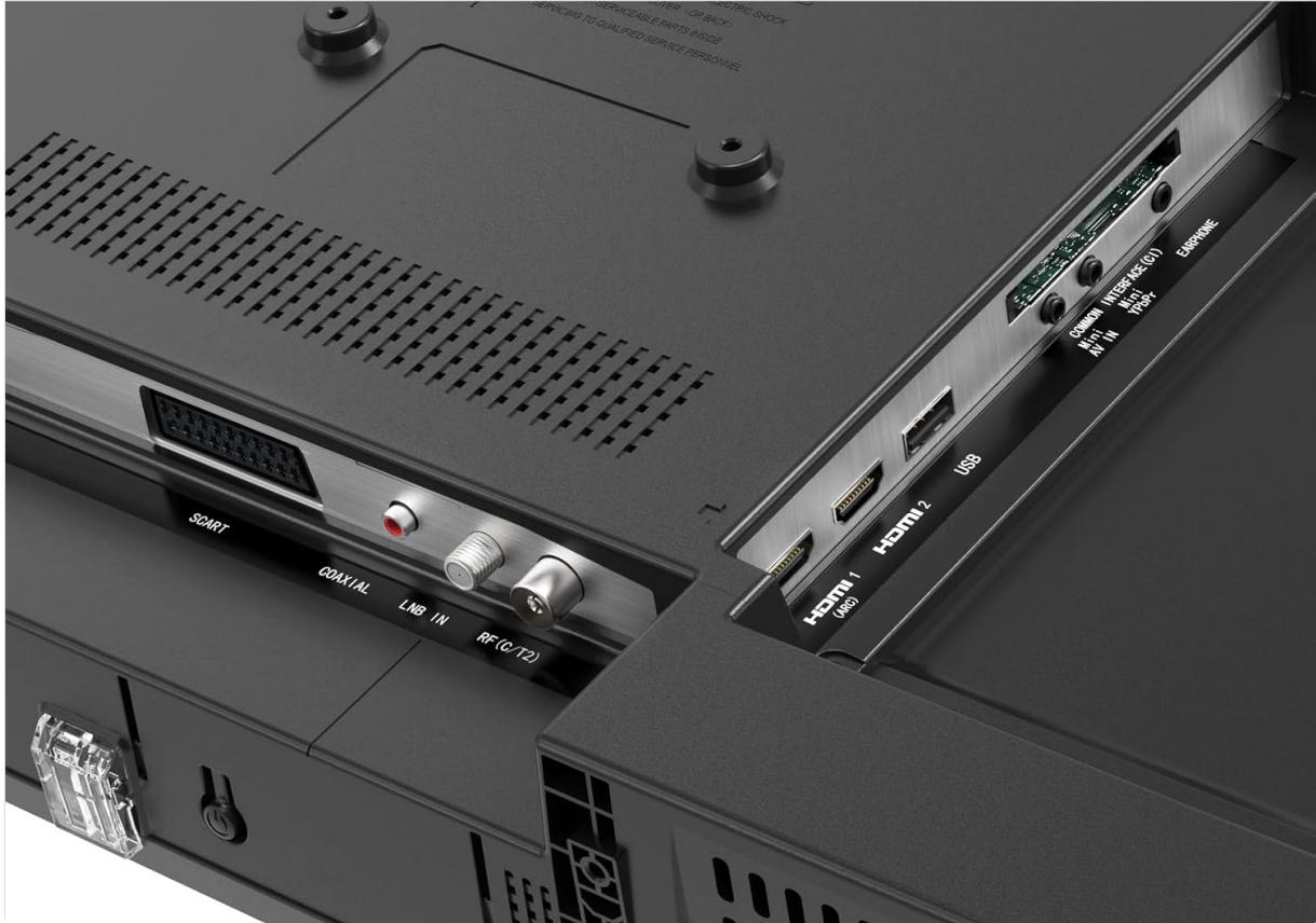
Detailed view of the TV's input/output ports, including SCART, Coaxial Out, LNB In, RF (Antenna), 2x HDMI, USB, CI+ Common Interface, Mini AV, Mini YPbPr, and Earphone Out.

The TV features a variety of ports for connecting external devices: