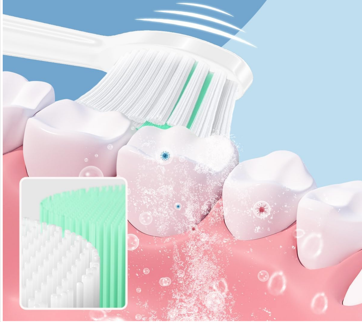
Image: Detailed view of the W-shaped polished bristles designed for effective and gentle cleaning.

Remove plaque without damaging your gums