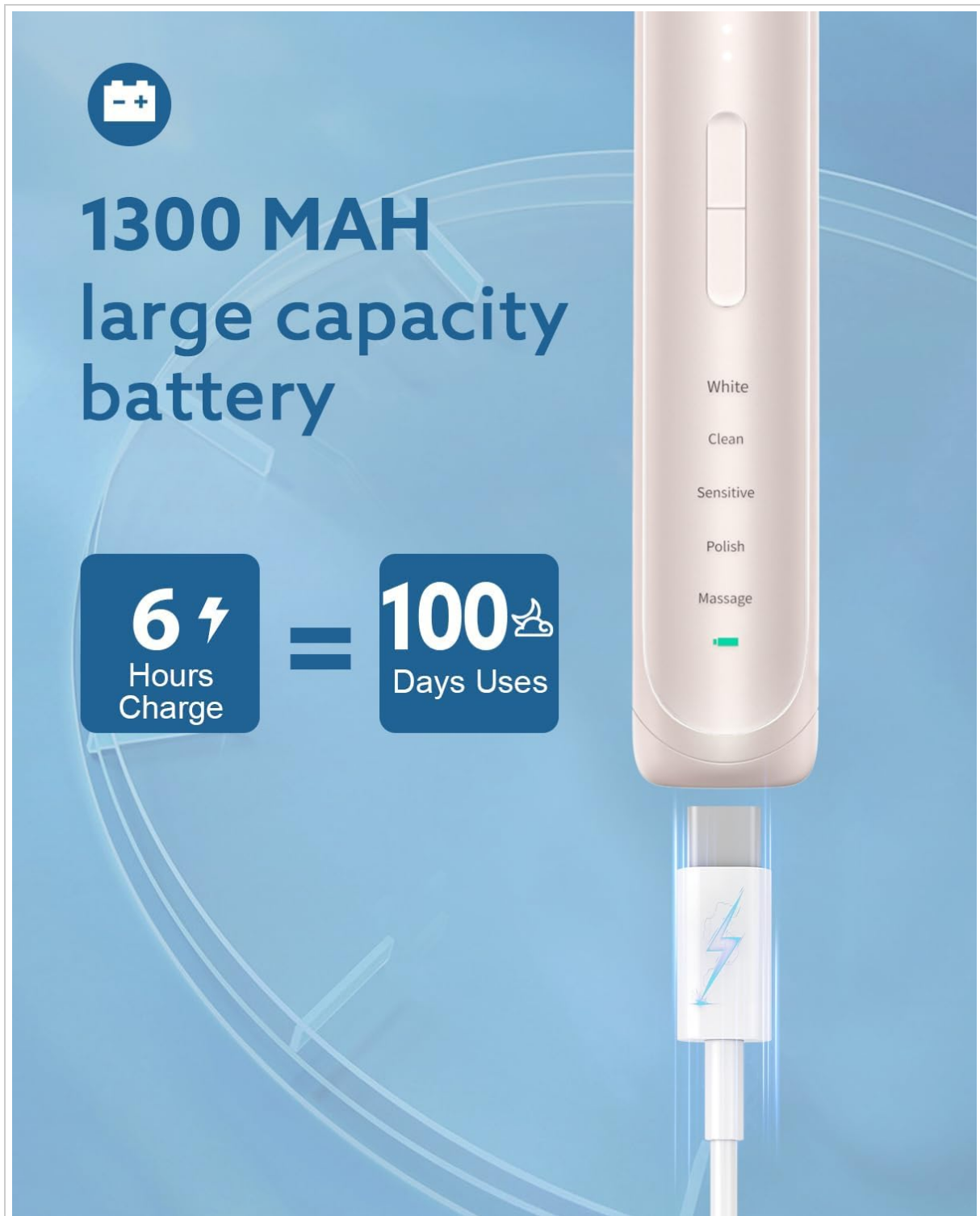
Image: The toothbrush handle connected to its Type-C charging cable, highlighting its long battery life.