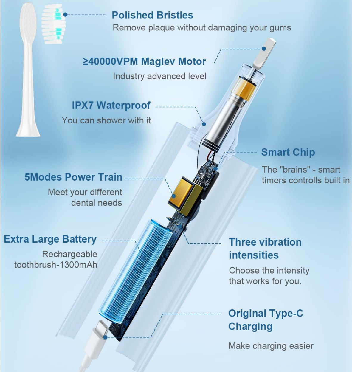
Image: An exploded view diagram of the toothbrush highlighting its advanced technology and features.