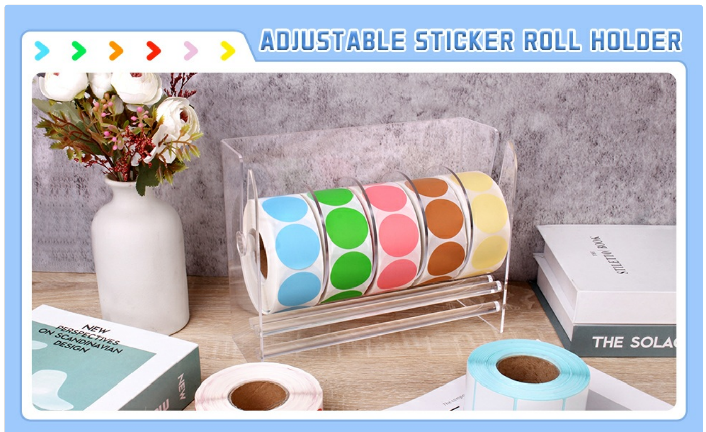
Image: The KIYTARBOO Label Dispenser, showcasing its clear acrylic structure holding several rolls of colorful circular labels. Labels are shown being dispensed from the front.

Thank you for choosing the KIYTARBOO Label Dispenser. This adjustable sticker roll holder is designed to organize and dispense various types of labels, stickers, and tapes, helping to keep your workspace tidy and improve efficiency. Made from durable acrylic material, it offers a transparent design and adjustable discs for versatile use in offices, homes, schools, studios, libraries, and restaurants.