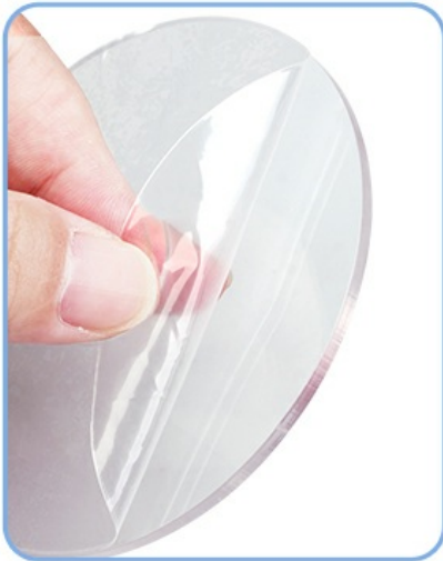
Tear off the protective film of the small disc