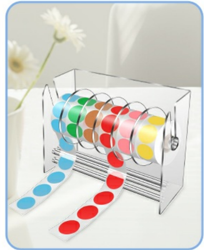
Place the rotating spindle into the sticker dispenser holder

Image: An illustrative diagram highlighting the adjustable discs for separating label rolls and the horizontal columns for keeping dispensed labels neat.