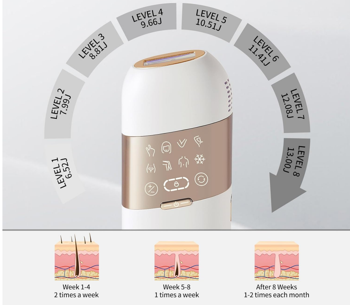
Figure 2: 8 Energy Levels and Treatment Progression