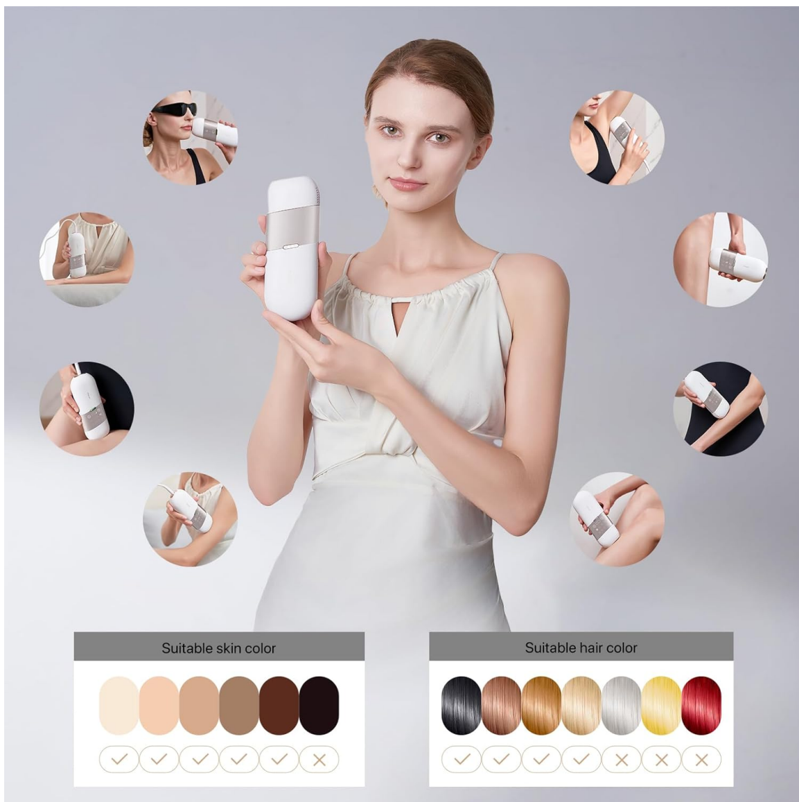
Figure 5: Skin Tone and Hair Color Compatibility Chart