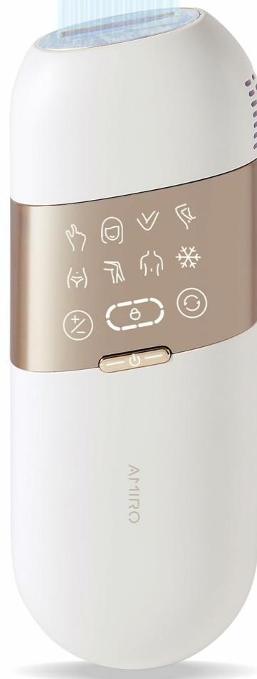
Figure 1: AMIRO Opal IPL Hair Removal Device