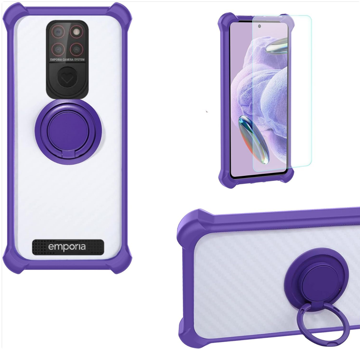
Image 1.1: Overview of the Emporia Smart.5 Mini phone case and included tempered glass screen protector.