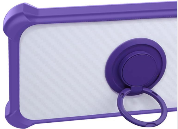
Image 4.1: The ring holder offers 180-degree and 360-degree rotation for versatile viewing angles and improved grip.