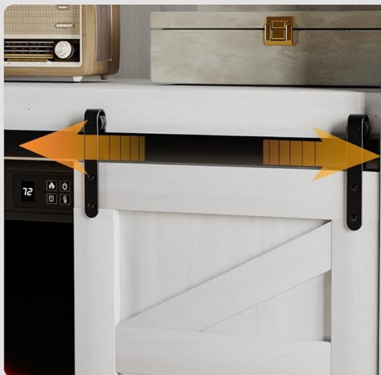
Sliding Barn Door