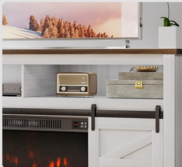
More Storage Space