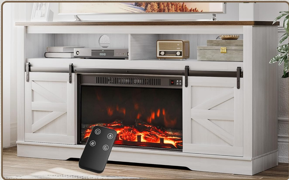
Image: A detailed view of the electric fireplace insert, showing its control panel, remote control, and illustrating different flame brightness levels (L1, L2, L3).