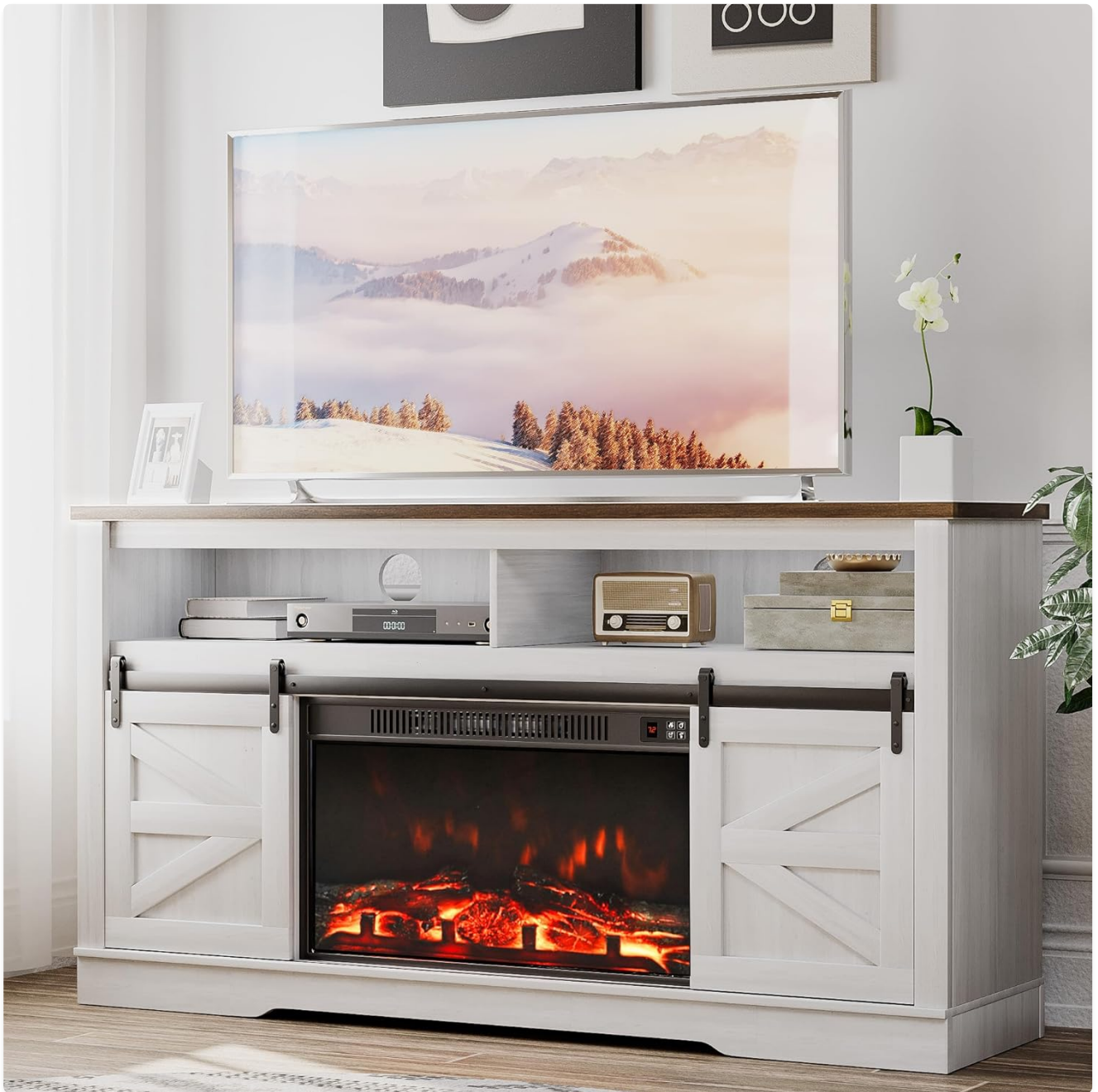
Image: The JUMMICO Fireplace TV Stand, a bright white media console with a central electric fireplace and sliding barn doors, supporting a large television.