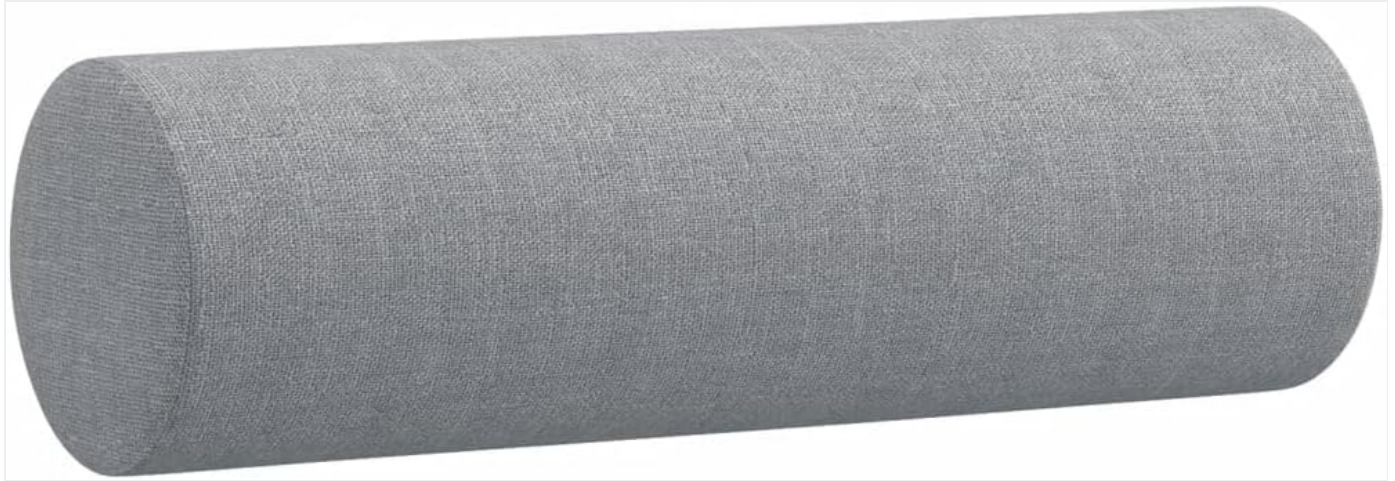
Image: One of the decorative cylindrical pillows included with the sofa.