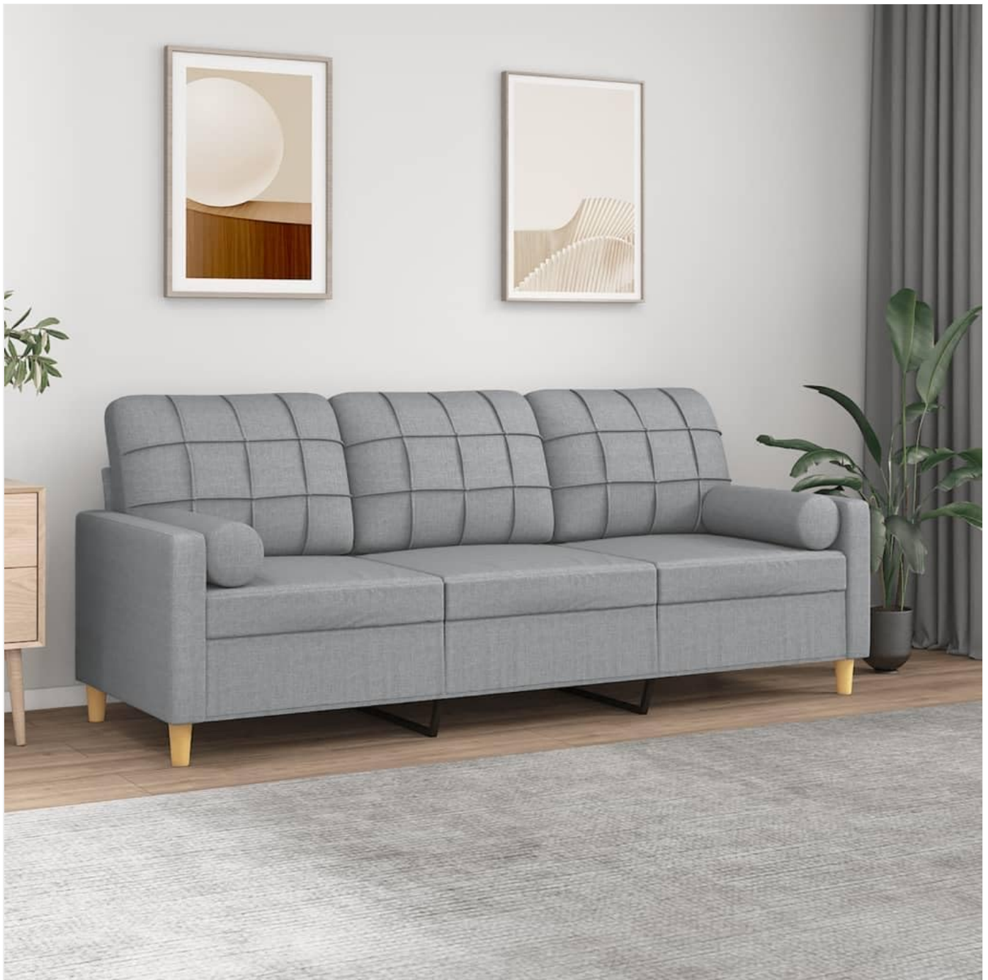
Image: The vidaXL 3-Seater Sofa in light grey fabric, featuring a modern design with decorative pillows.