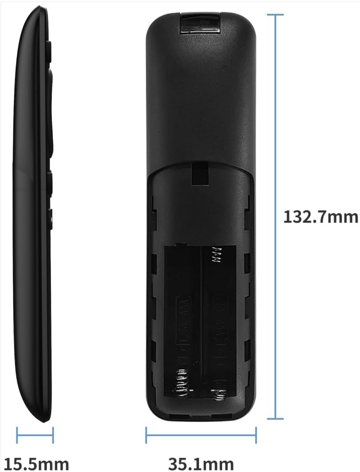
Image 3.1: The back of the remote control showing the battery compartment. Please ensure correct battery orientation.