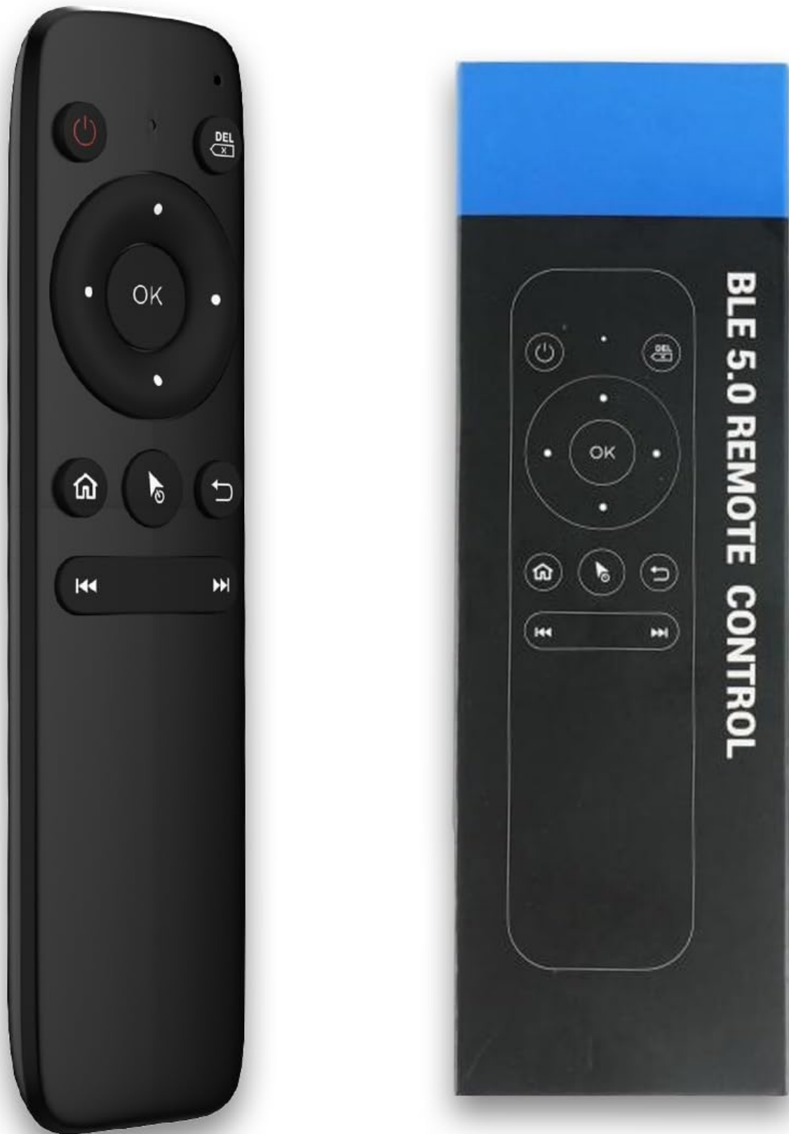
Image 1.1: The Ottocast Wireless Air Mouse Remote Control alongside its product packaging.