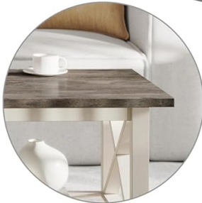
Wooden Top and Frame