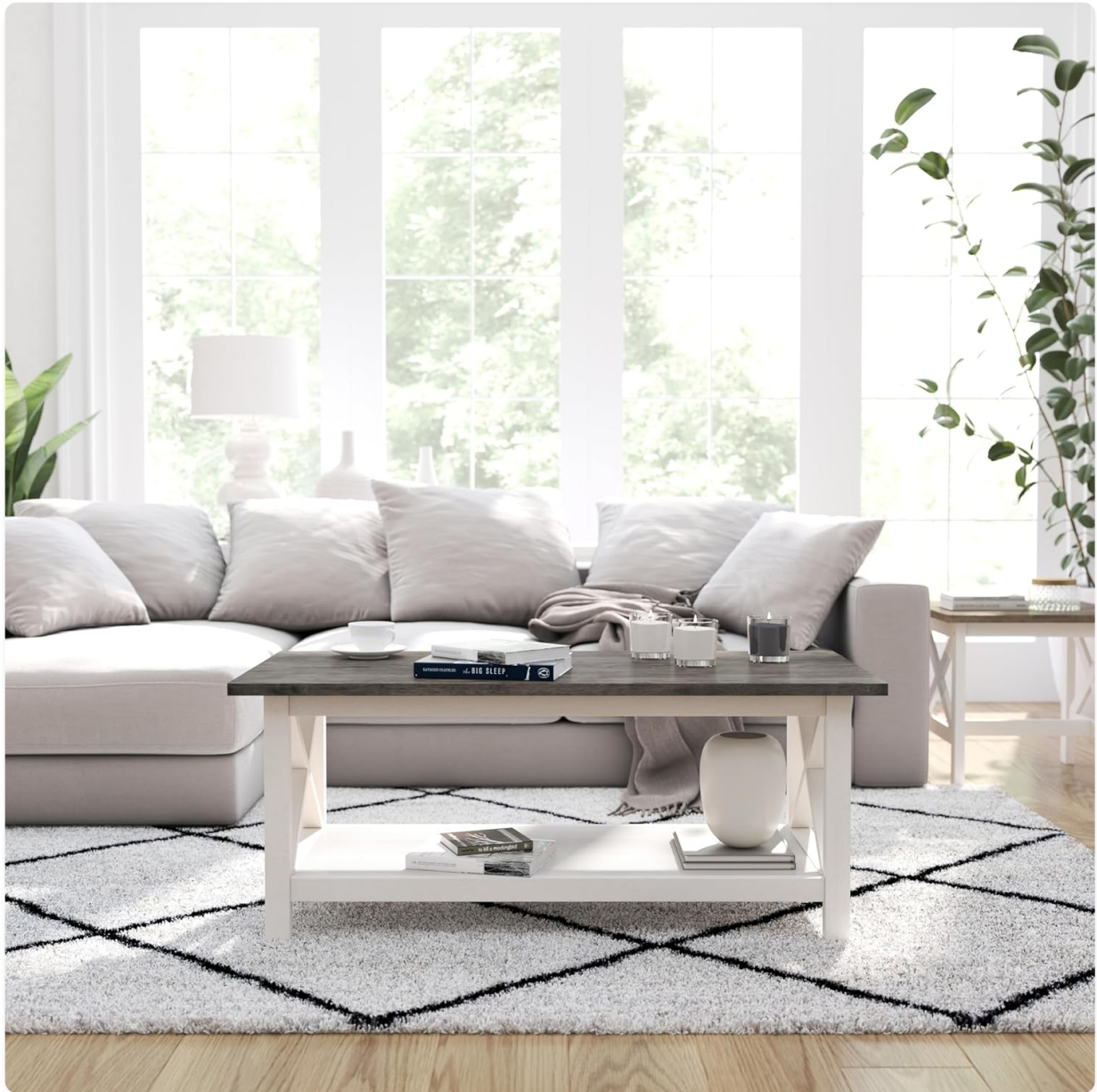
Image 1.1: The Merrick Lane Matty Farmhouse Coffee Table in a living room, showcasing its rustic design and lower shelf.