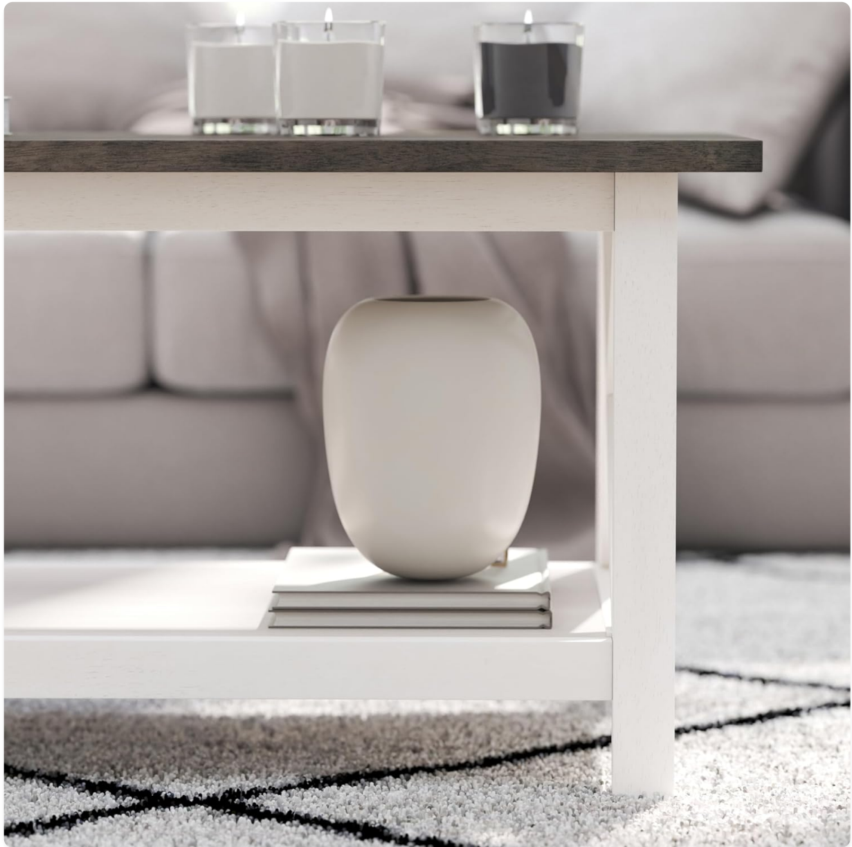
Image 5.1: The lower shelf of the coffee table, demonstrating its utility for displaying decorative items or storing essentials.