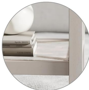
Engineered Wood Lower Storage Shelf