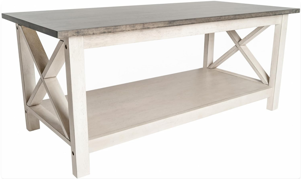
Image 3.1: A detailed view of the coffee table, showing the X-frame structure and the lower storage shelf.