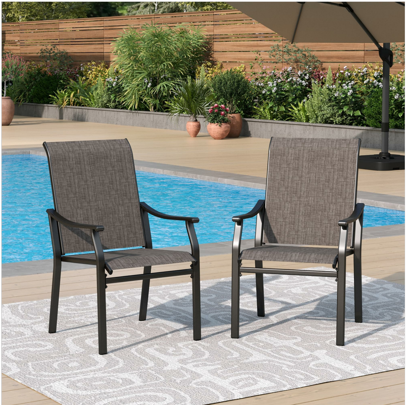
The PHI VILLA Outdoor Dining Chairs are designed for comfortable outdoor use, featuring a high back and armrests for support.