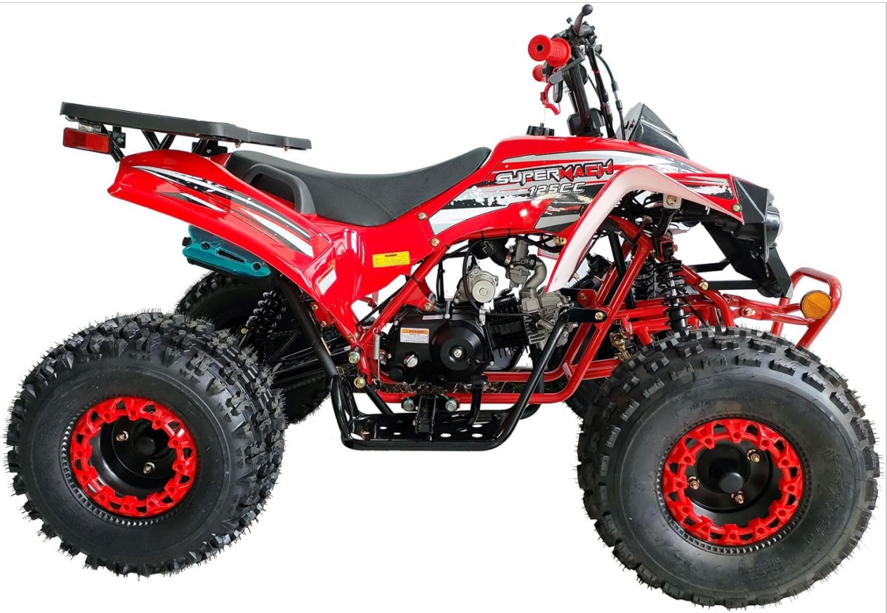
Image 2.1: Side view of the HHH CT125-8 125cc ATV in red.