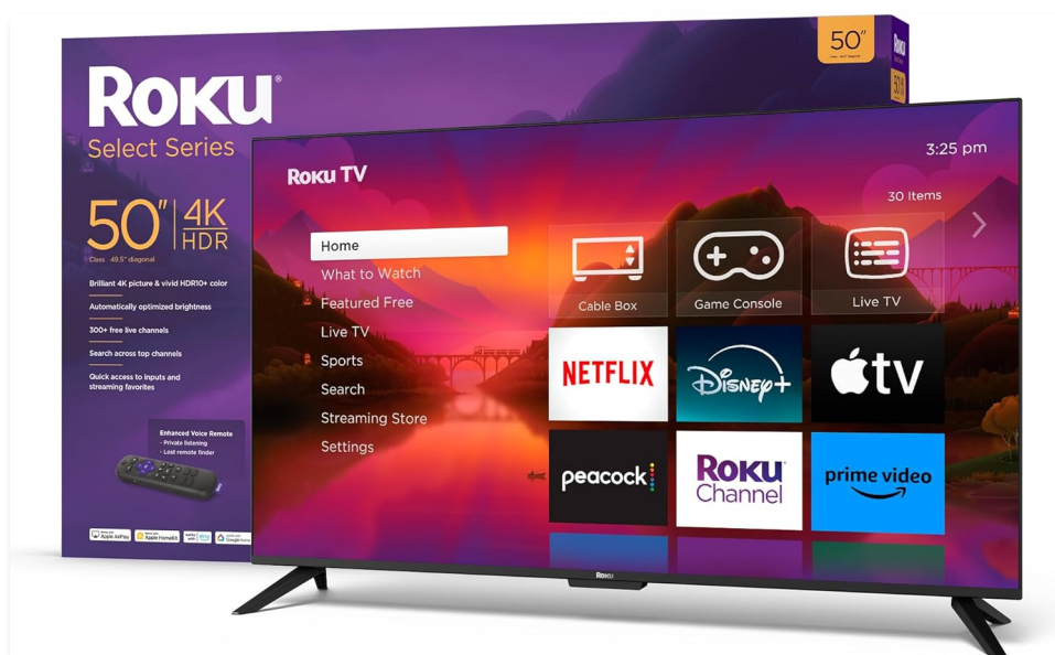
The Roku 50-Inch Select Series 4K HDR Smart TV, showcasing its sleek design and vibrant display.