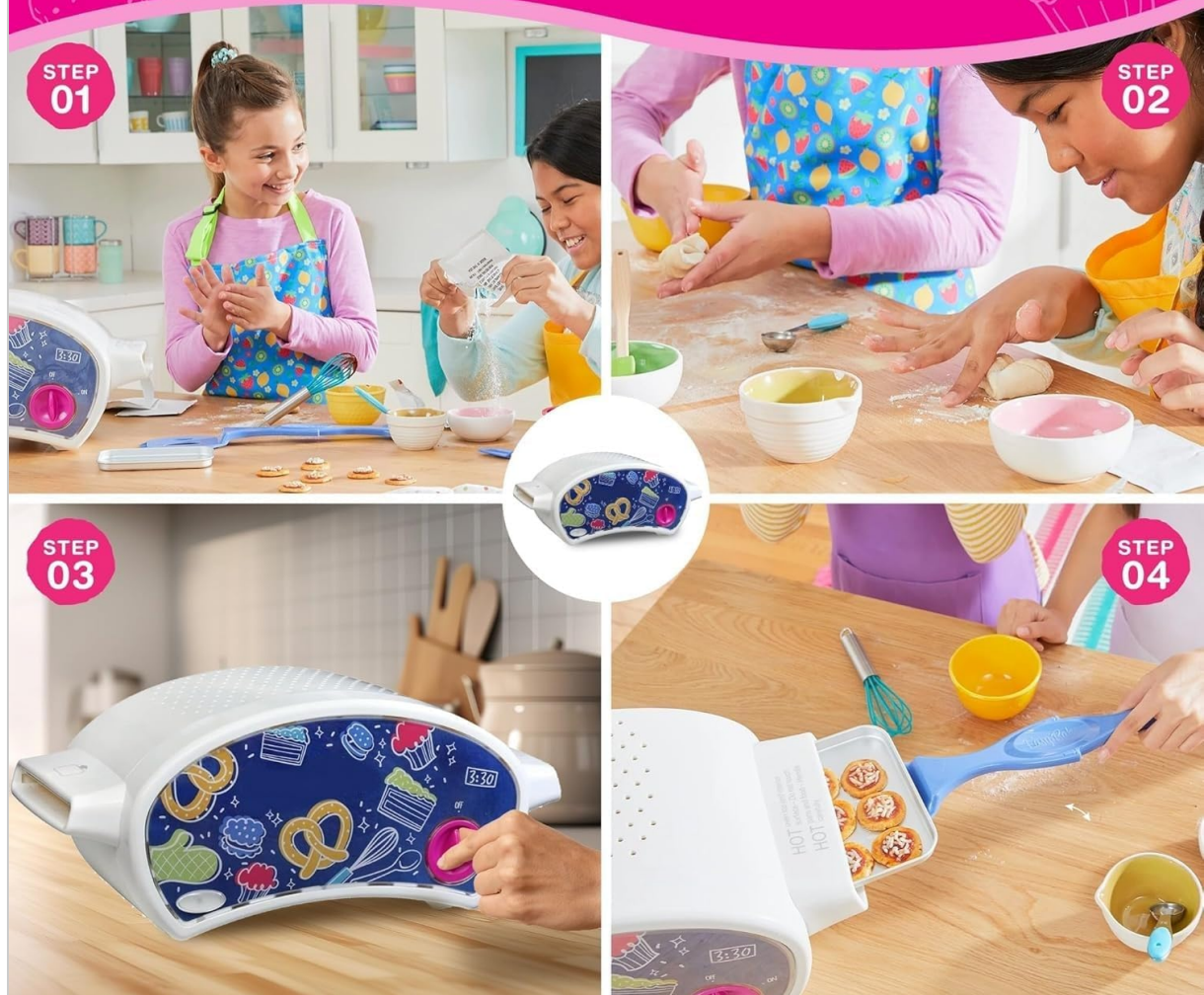
Figure 3: Step-by-step guide for using the Easy Bake Oven. This image illustrates the process from preparing the mix to baking and removing the finished product.