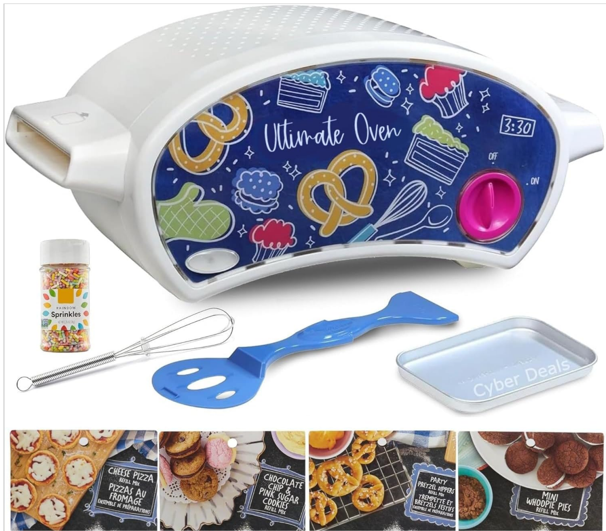
Figure 2: The Easy Bake Oven Baking Bundle ready for use, showcasing the oven unit, baking pan, spatula, whisk, and mix boxes on a clean surface.