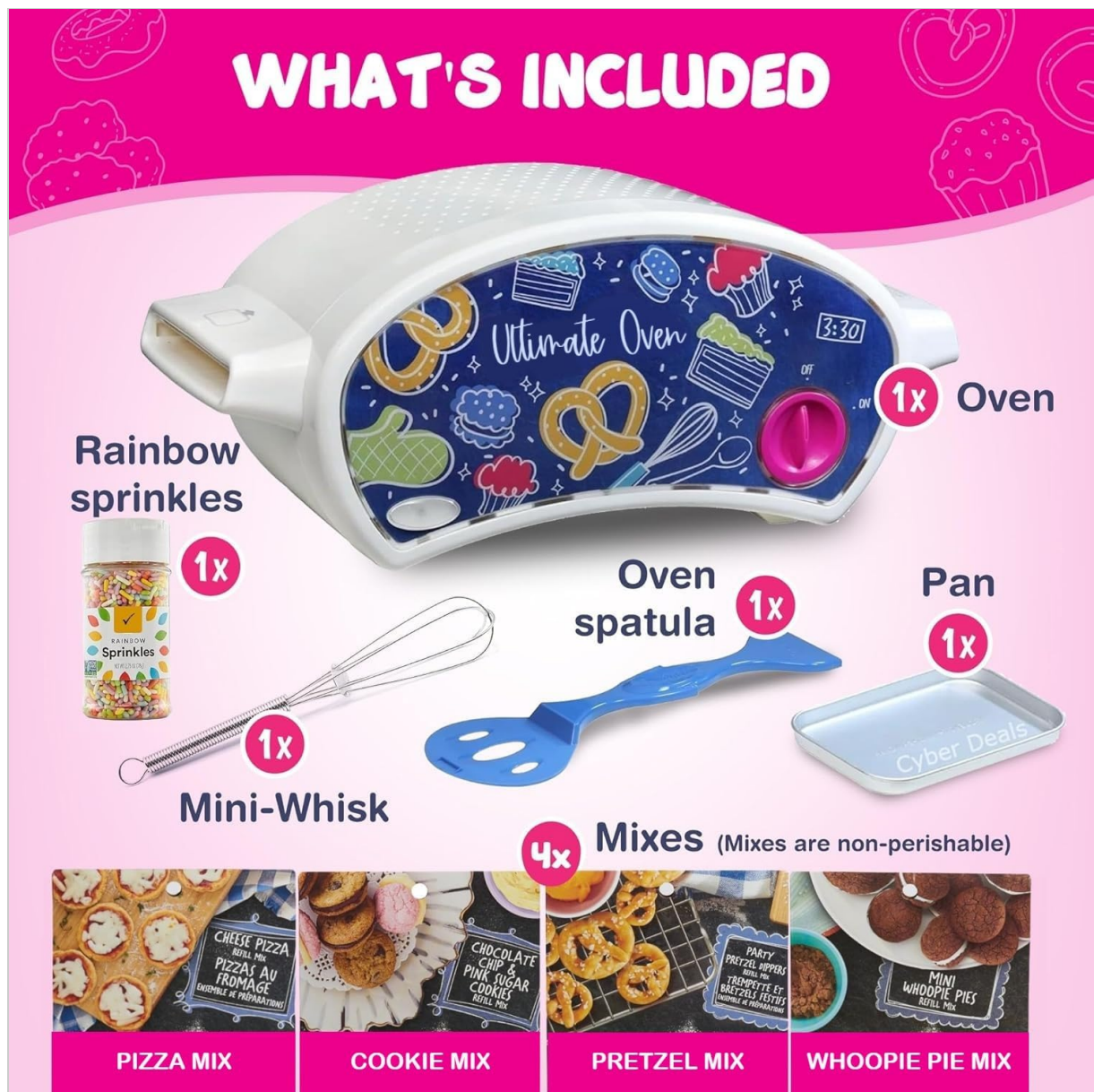
Figure 1: All components included in the Easy Bake Oven Baking Bundle. This image displays the main oven unit, a small metal baking pan, a blue plastic oven spatula, a mini metal whisk, four boxes of Easy Bake mixes (cookie, pretzel, pizza, and whoopie pie), and a container of rainbow sprinkles.