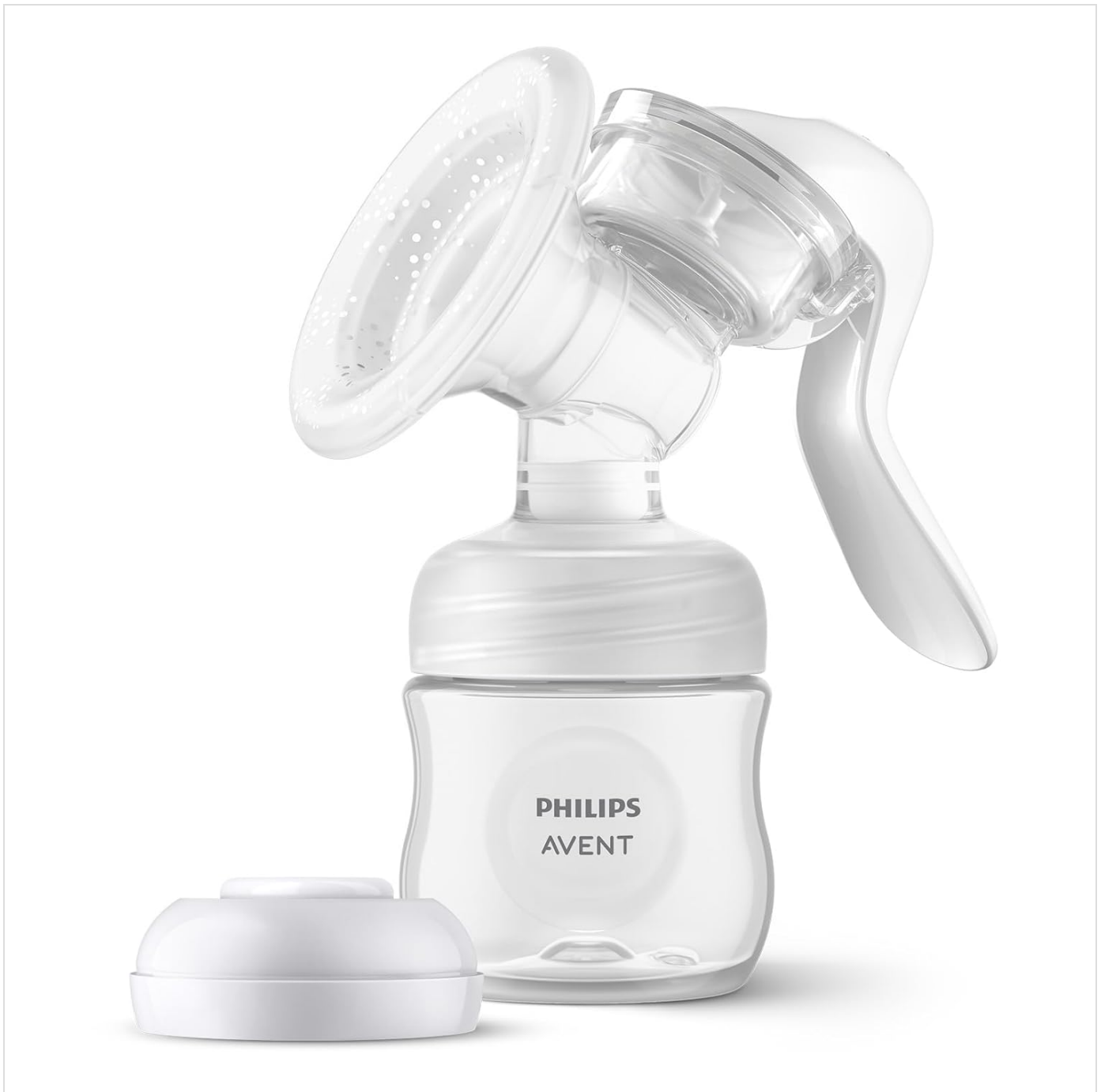
Image: The Philips Avent Manual Breast Pump fully assembled, showing the pump body, handle, silicone cushion, and the attached 4oz Natural bottle with a separate sealing lid.