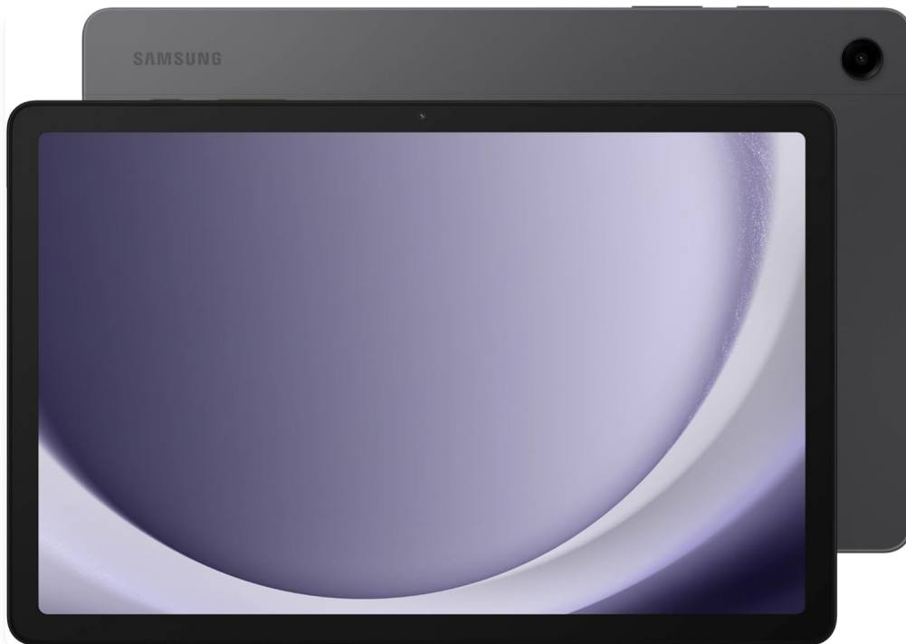
Figure 1: Front and back view of the Samsung Galaxy Tab A9+.

The Samsung Galaxy Tab A9+ is your go-to device for on-the-go family fun. Featuring a bright, engaging 11-inch screen and an upgraded chipset, it delivers smooth performance for watching shows, playing games, or tackling daily tasks. Its multi-window display allows for seamless multitasking, making it an ideal companion for both entertainment and productivity.