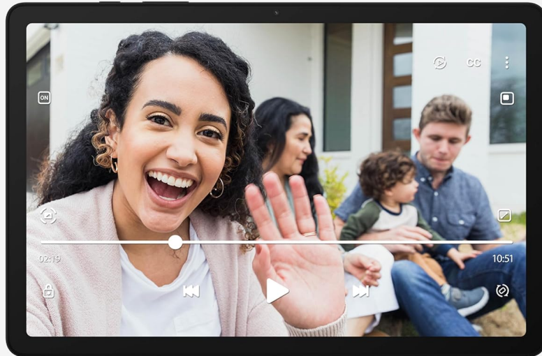
Figure 6: The large screen is ideal for family entertainment.