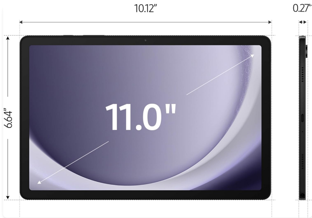
Figure 3: Dimensions of the Samsung Galaxy Tab A9+.