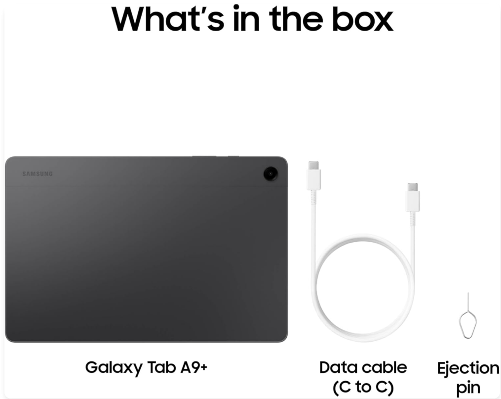
Figure 2: Included items in the Galaxy Tab A9+ package.