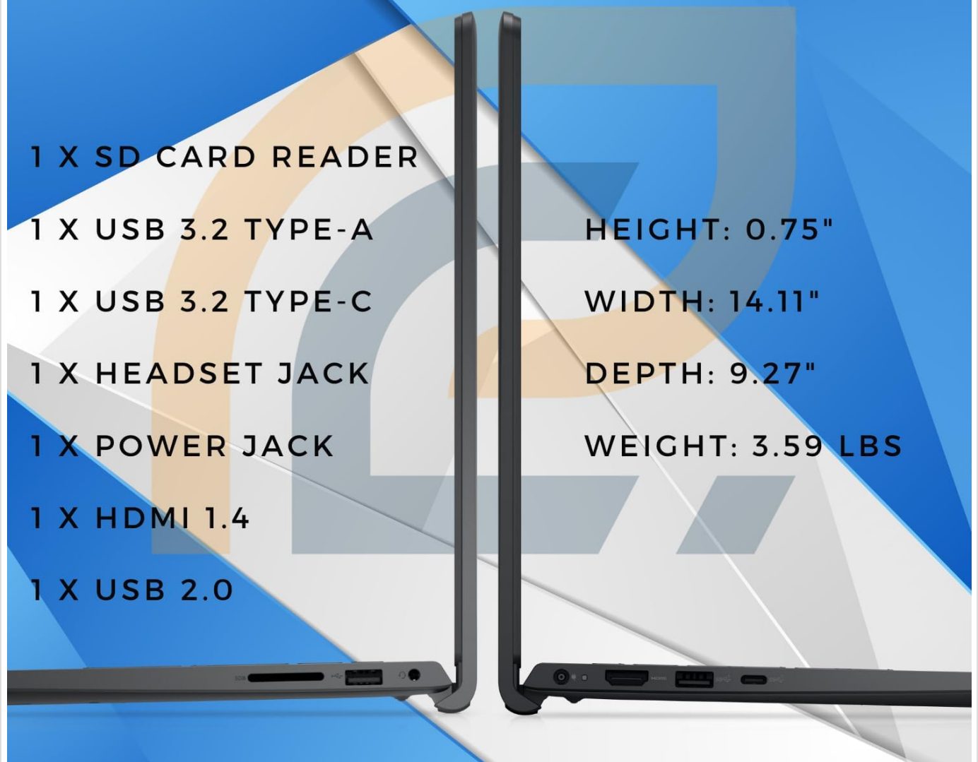
Image: A visual representation of the Dell Inspiron 3535 laptop's side profiles, highlighting its various ports and physical dimensions. Ports include SD Card Reader, USB 3.2 Type-A, USB 3.2 Type-C, Headset Jack, Power Jack, HDMI 1.4, and USB 2.0.