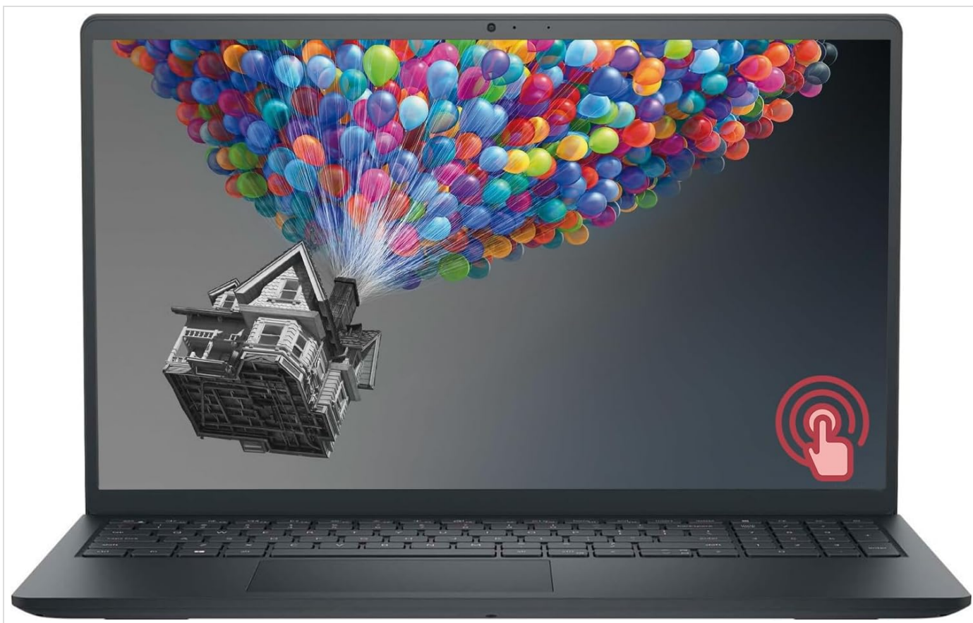
Image: The Dell Inspiron 3535 laptop, closed, showcasing its sleek design. The screen displays a vibrant image of a house lifted by balloons, indicating its display capabilities.

This manual provides essential information for setting up, operating, maintaining, and troubleshooting your Dell Inspiron 3535 laptop. Please read this guide thoroughly to ensure proper use and to maximize the performance and longevity of your device.