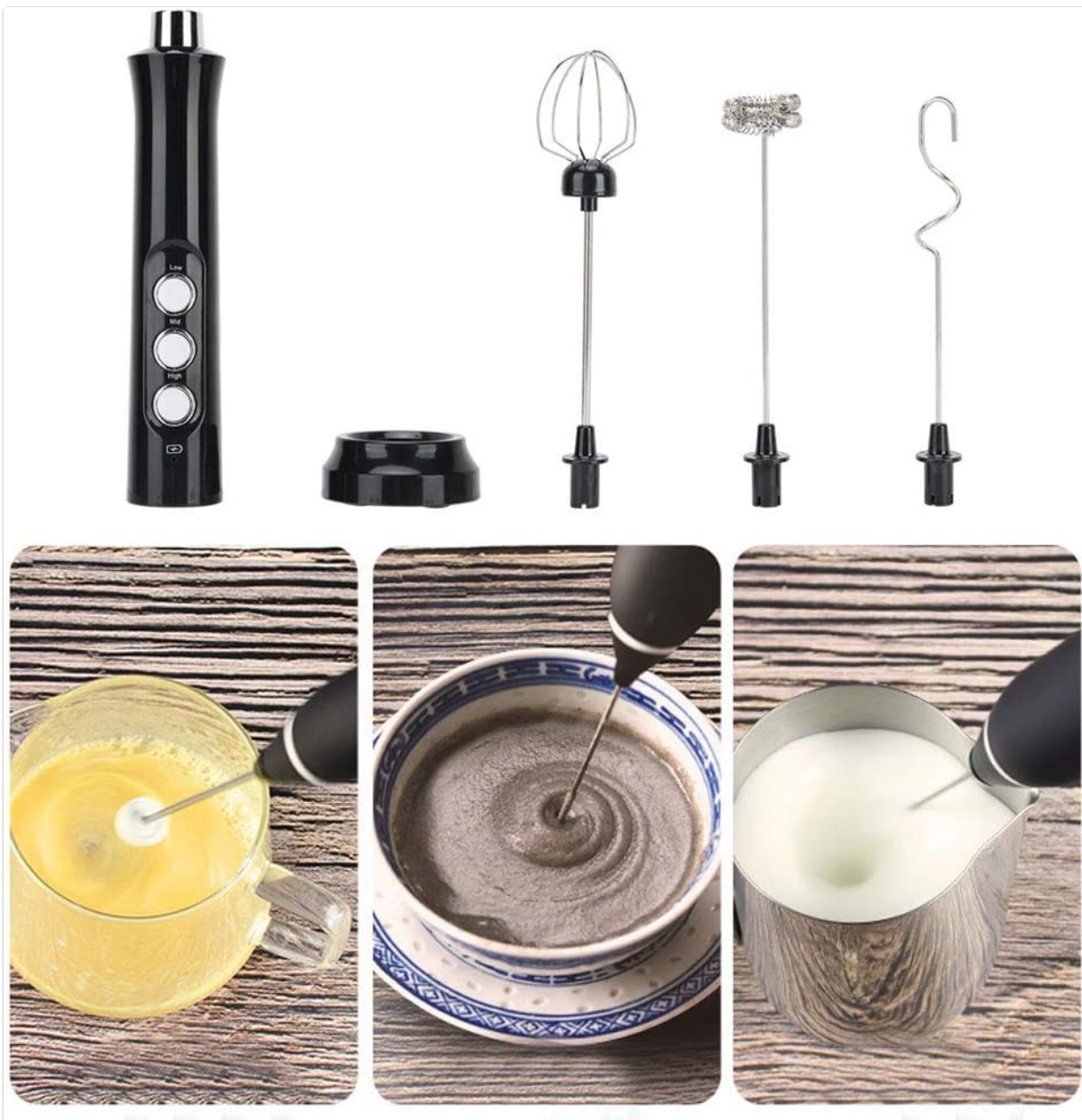
Image: All components of the Gavigain Milk Frother, including the main unit, charging base, double-layer frother head, egg beater head, and mixing head. Below are three small images demonstrating the frother mixing eggs, a dark beverage, and milk.