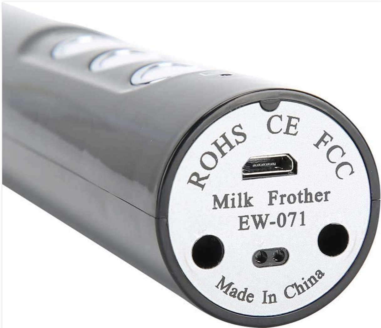
Image: A close-up view of the bottom of the Gavigain milk frother, clearly showing the USB charging port and regulatory markings like ROHS, CE, FCC, and the model number EW-071.