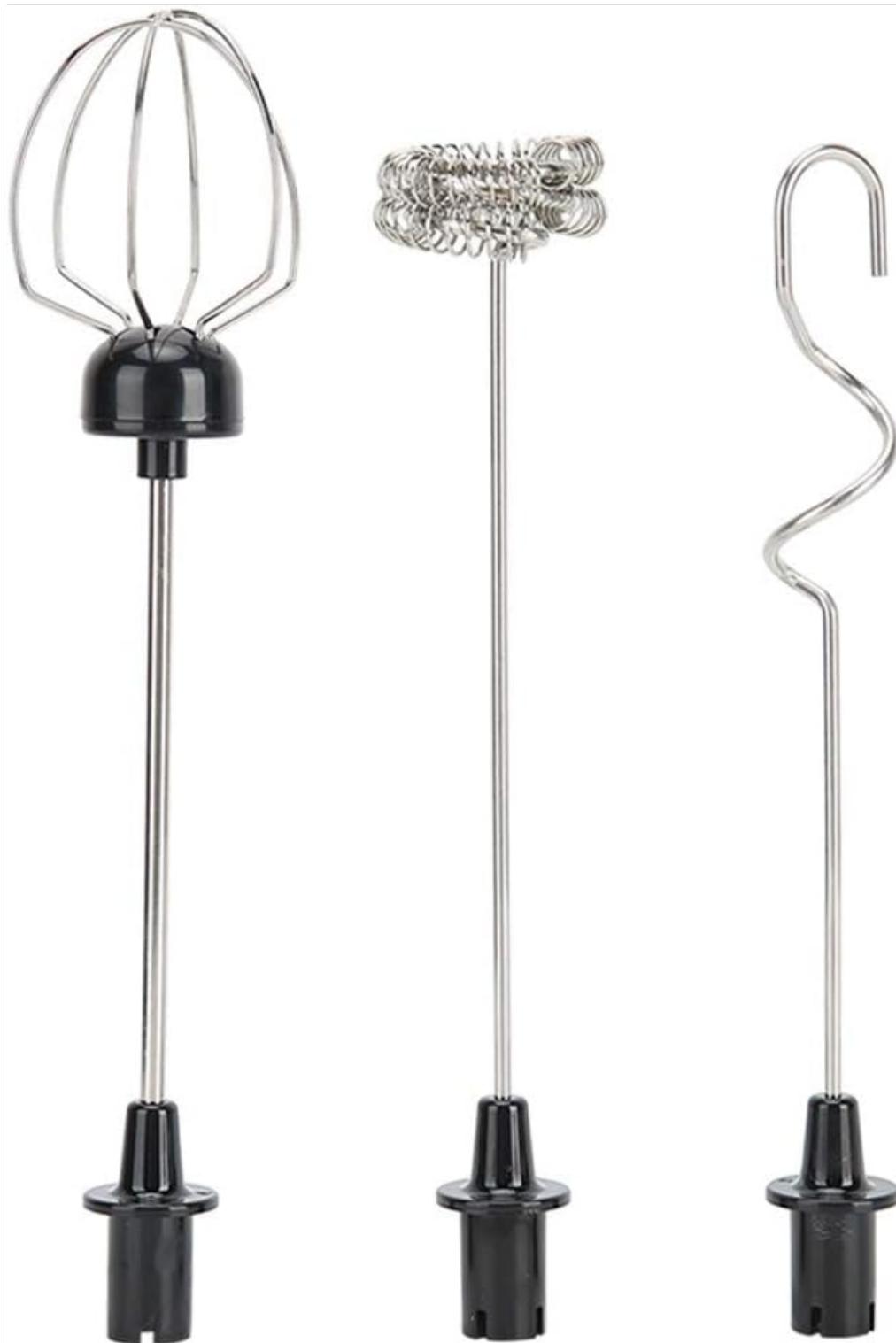
Image: A close-up of the three distinct interchangeable whisk attachments for the Gavigain milk frother: a large balloon whisk, a double-layer frothing whisk, and a spiral mixing whisk.