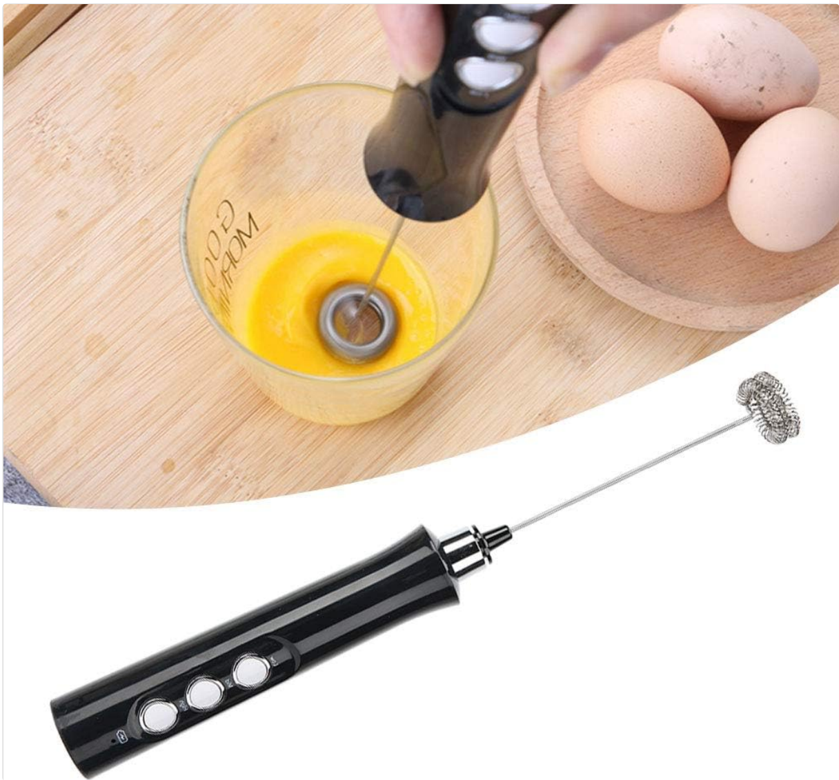
Image: The Gavigain milk frother, with a whisk attachment, mixing eggs in a clear glass bowl on a wooden cutting board. Several raw eggs are visible in the background.