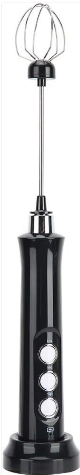
Image: The black Gavigain milk frother, equipped with the large balloon whisk attachment, standing upright on its dedicated charging base.